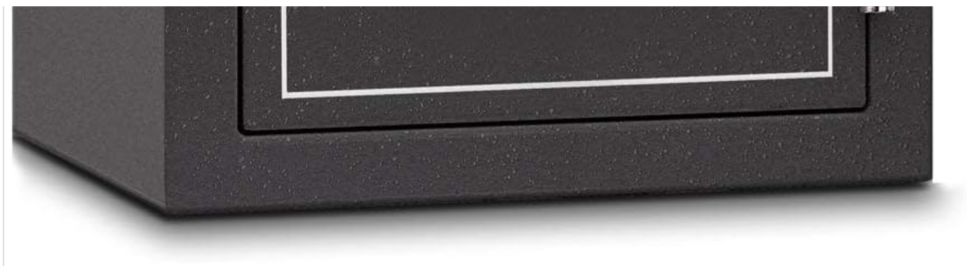
Figure 1: Front view of the Mesa Safe MBF Series Combination Lock Safe in its closed position.