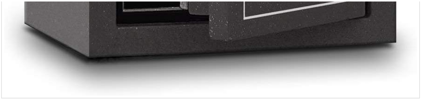
Figure 3: The safe door open, revealing the combination dial and the robust locking bolts.