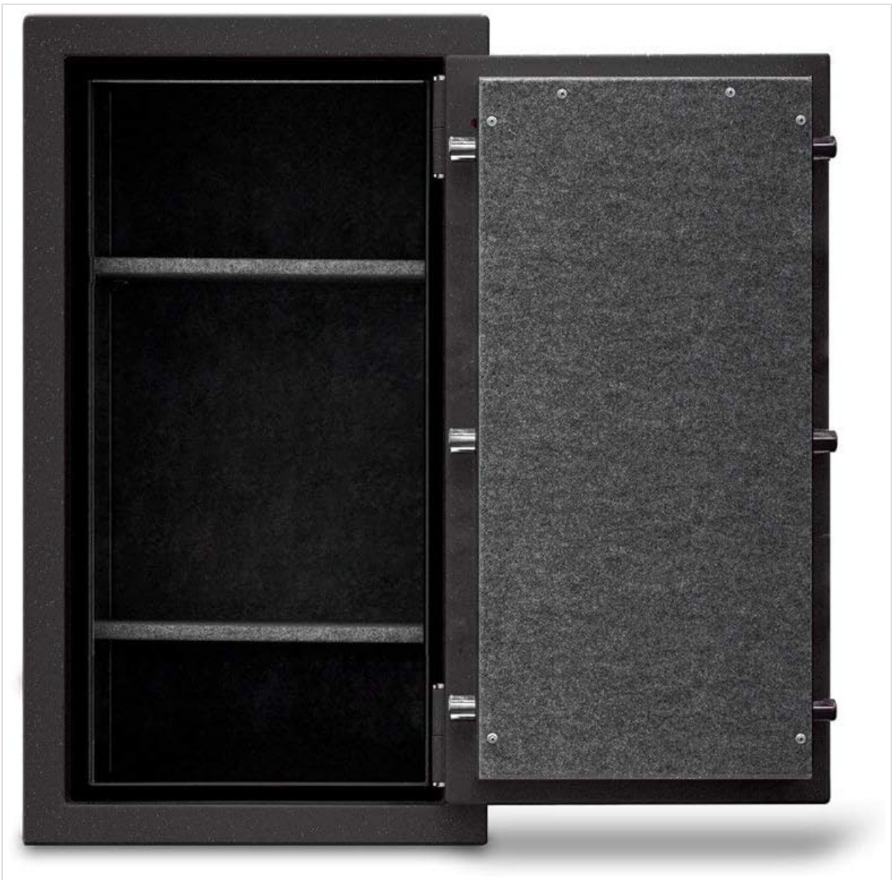
Figure 2: Interior view of the safe with shelves, illustrating access to potential anchoring points on the base.