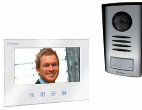
Figure 1: Golmar SV-370S Color Videoset components. The indoor monitor features a 7-inch screen and control buttons, while the outdoor unit includes a camera, speaker, microphone, and call button.

The Golmar SV-370S Color Videoset provides secure and convenient communication with visitors at your entrance. It consists of an indoor monitor and an outdoor door station.