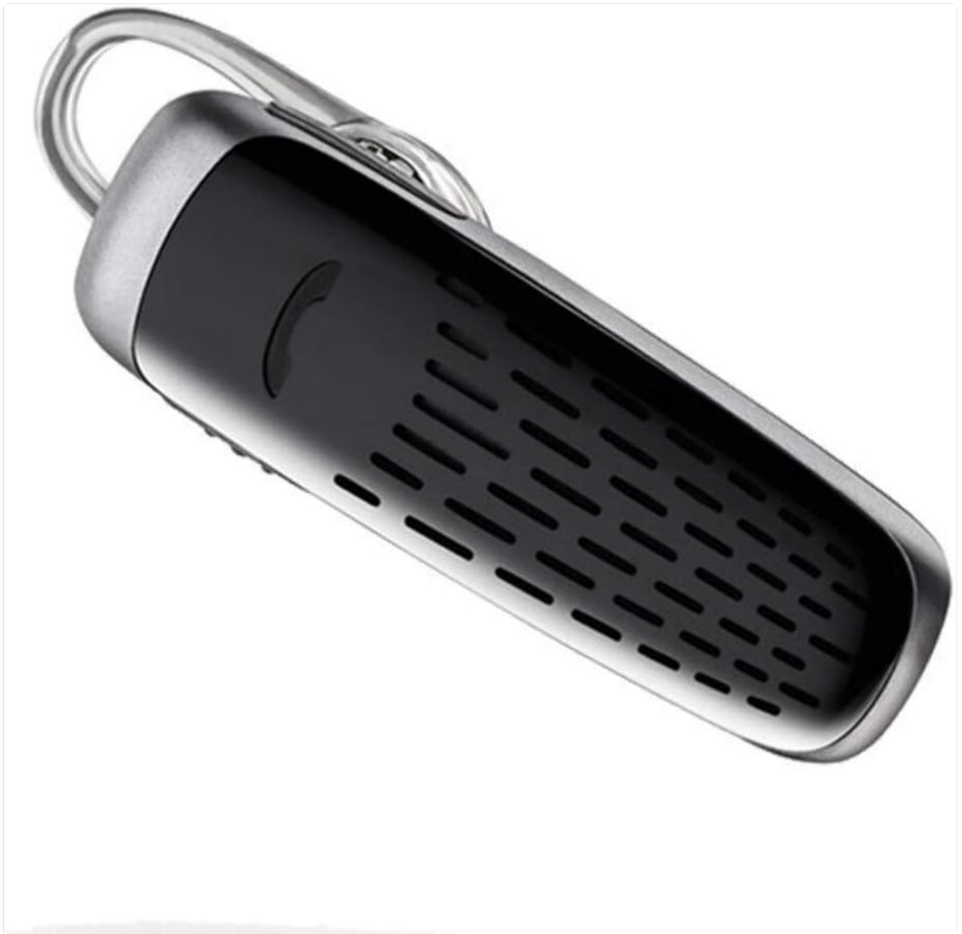
Image: The Plantronics M25 Bluetooth Headset, a compact black and silver device with an earloop, shown from an angled perspective. The call button is visible on the side.