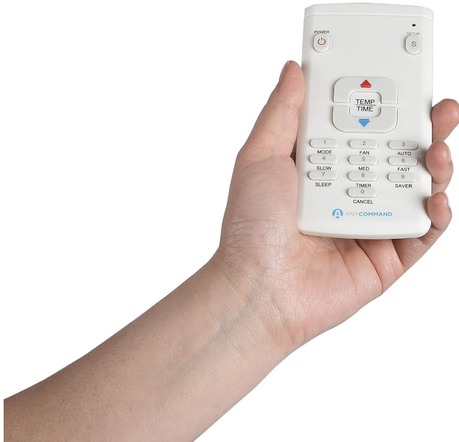
Image: Remote highlighting various operational modes.