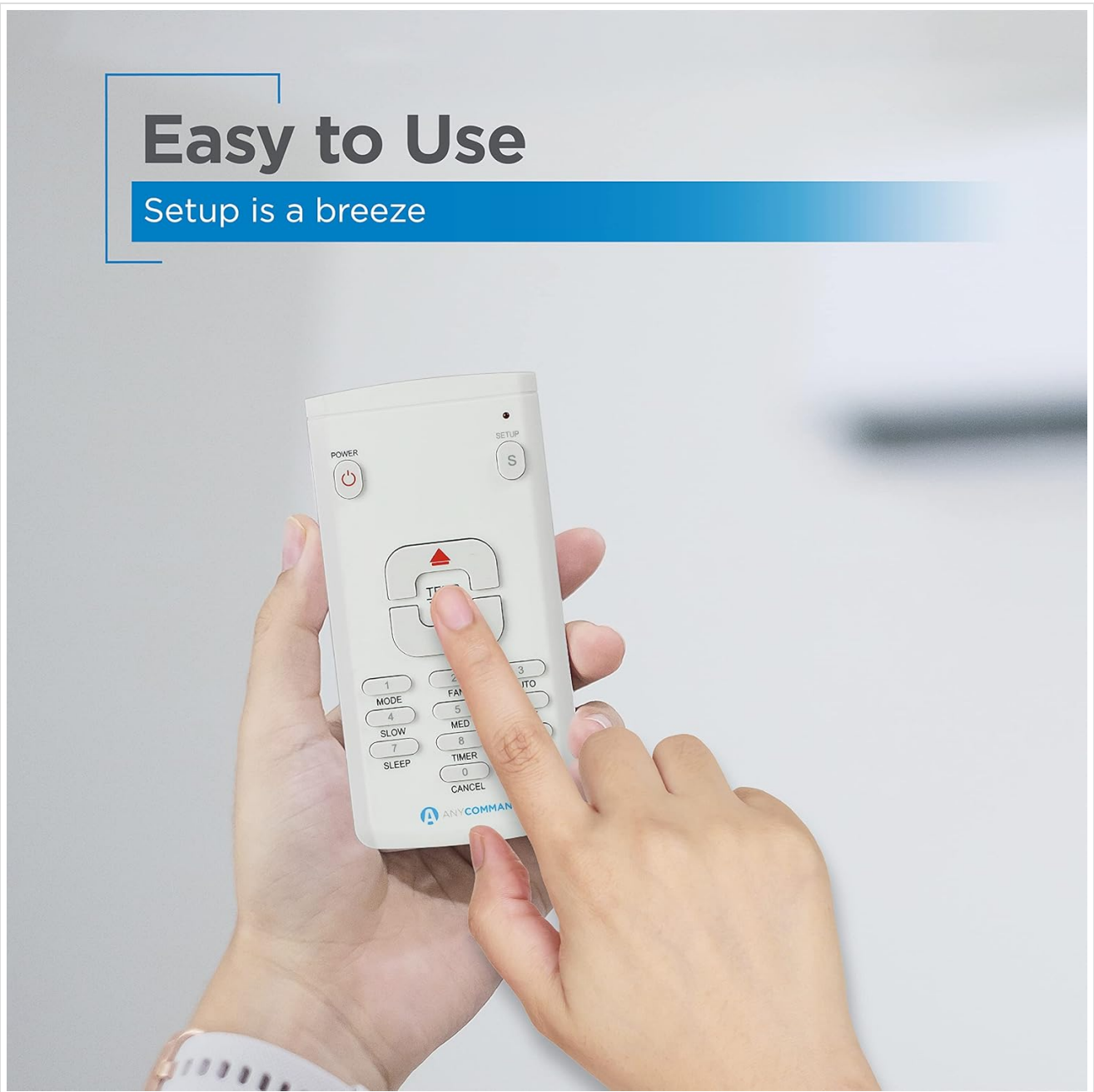
Image: Hands demonstrating the ease of setting up the remote.