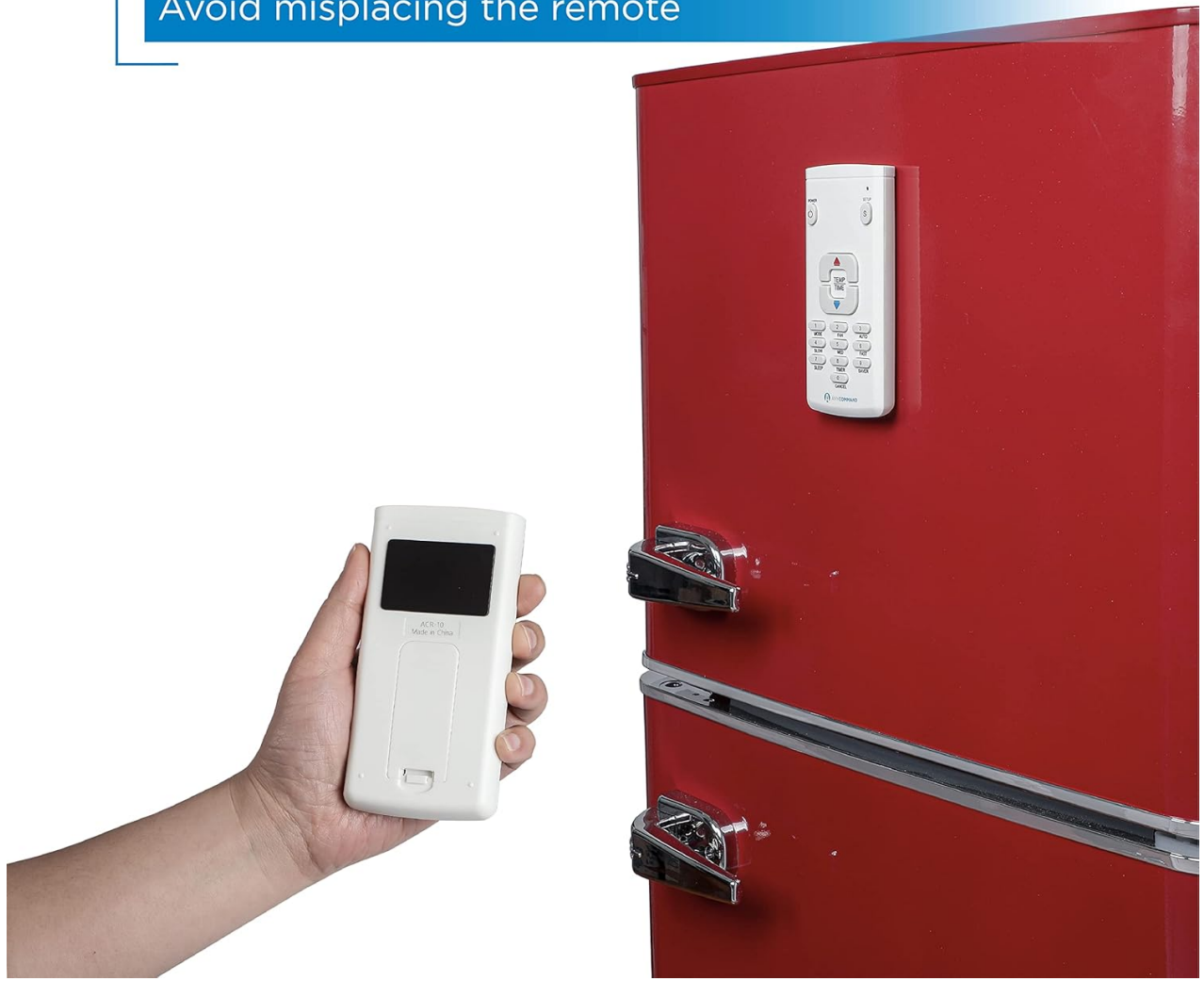
Image: Remote demonstrating its magnetic backing on a refrigerator.