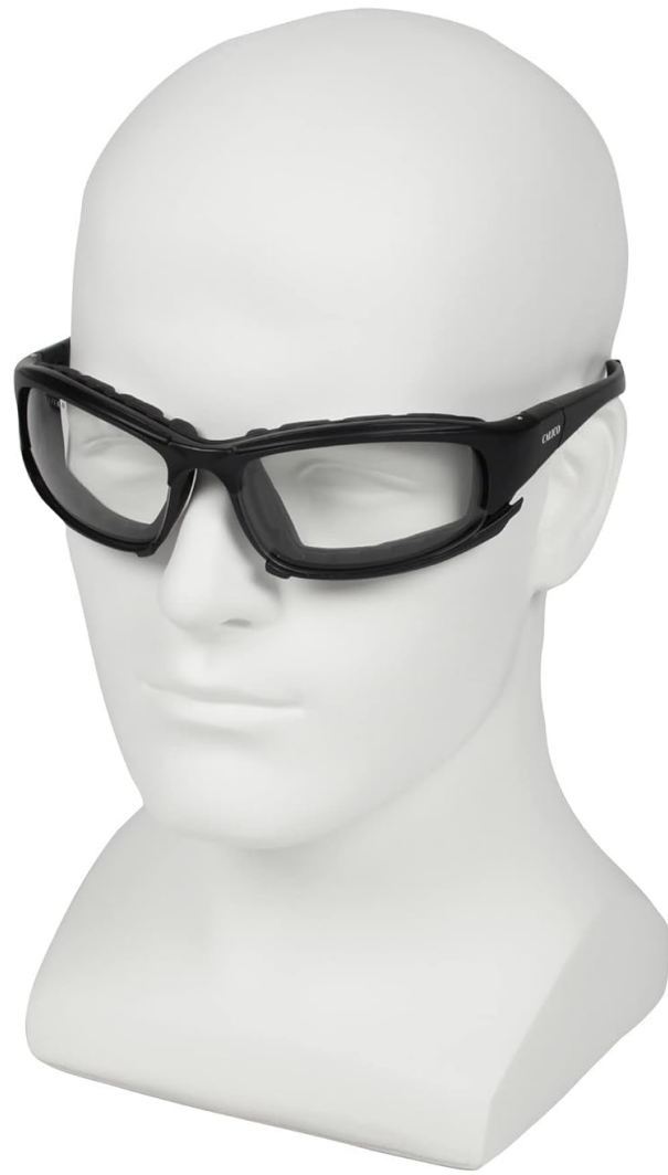
Figure 3.5: The safety glasses displayed on a mannequin head, demonstrating their fit and suitability for various industrial applications such as automotive, metal, and aerospace fields.

Ideal eye protection in automotive, metal and aerospace fields