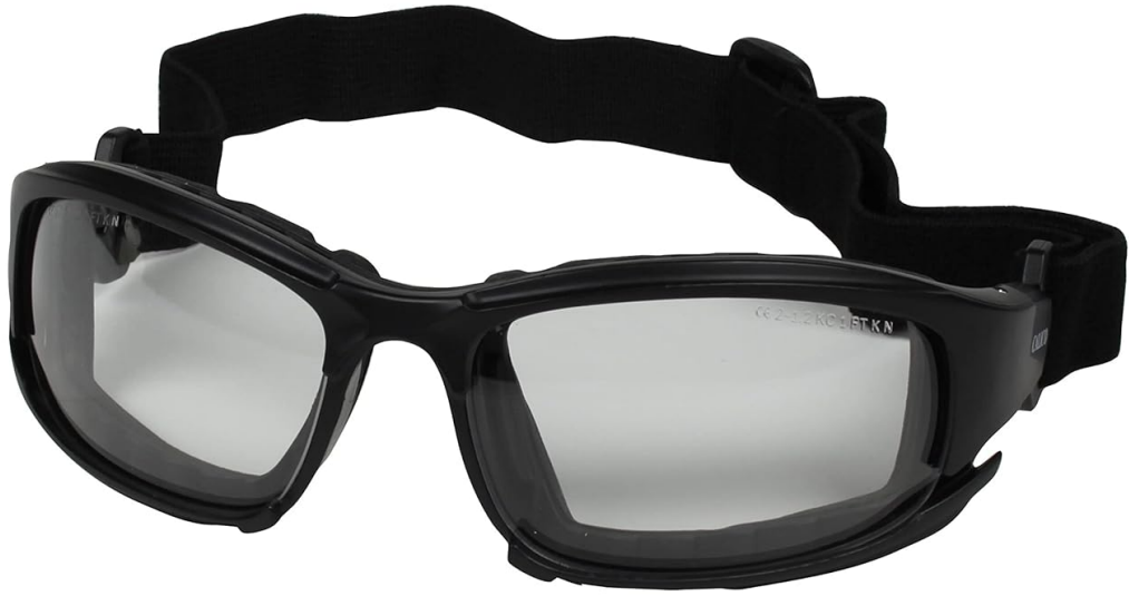
Figure 3.1: Front view of the KleenGuard V50 Calico Safety Glasses. These glasses feature a black frame and clear lenses, designed for general eye protection.