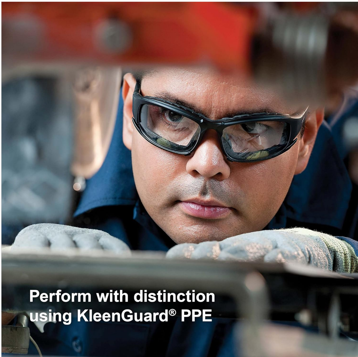
Figure 3.6: A worker wearing KleenGuard V50 Calico Safety Glasses, illustrating their practical use in a professional setting.