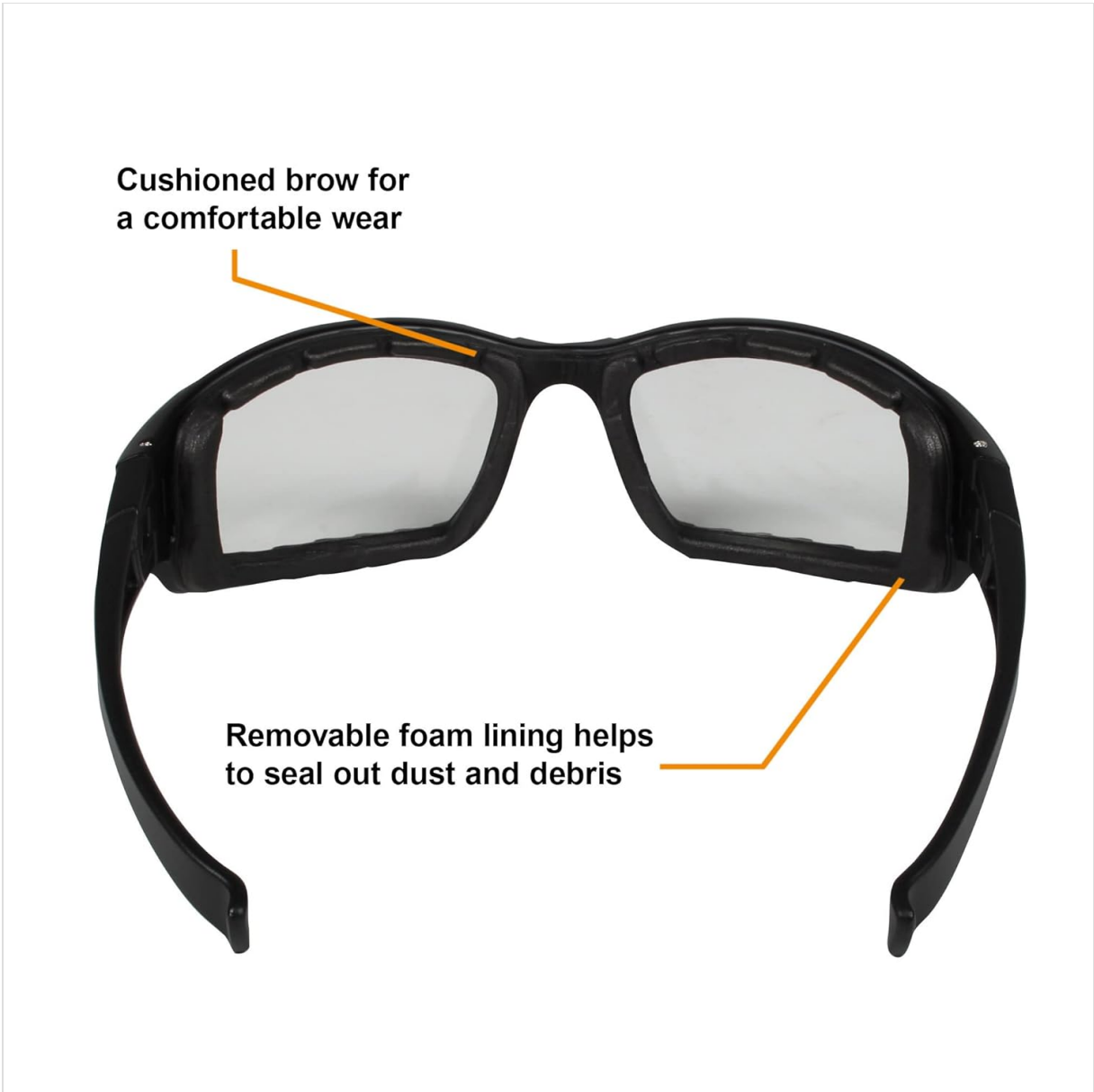
Figure 3.4: Inside view of the safety glasses, showing the cushioned brow for comfortable wear and the removable foam lining designed to seal out dust and debris.