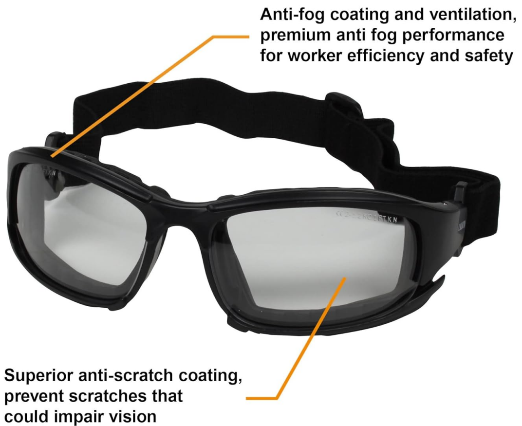
Figure 3.2: Close-up view highlighting the anti-fog coating and ventilation for improved worker efficiency and safety. The lenses also feature a superior anti-scratch coating to prevent vision impairment.