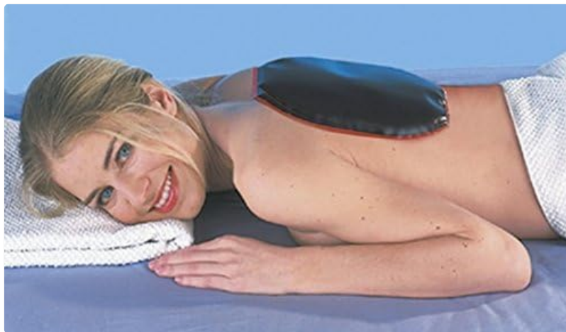
Image: A user applying the Moor Heat Pad to their upper back for targeted heat therapy.