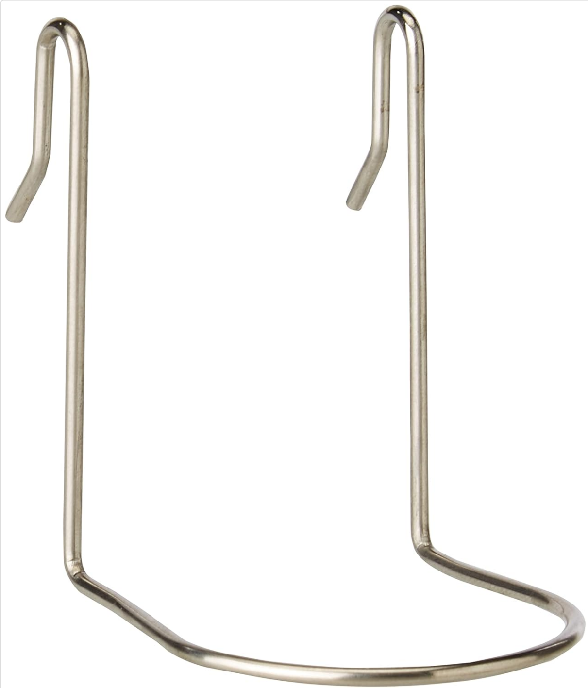
Image 4.1: The metal wire holder, designed for secure attachment of the water bottle to a cage or hutch. The hooks are visible at the top, ready for installation.