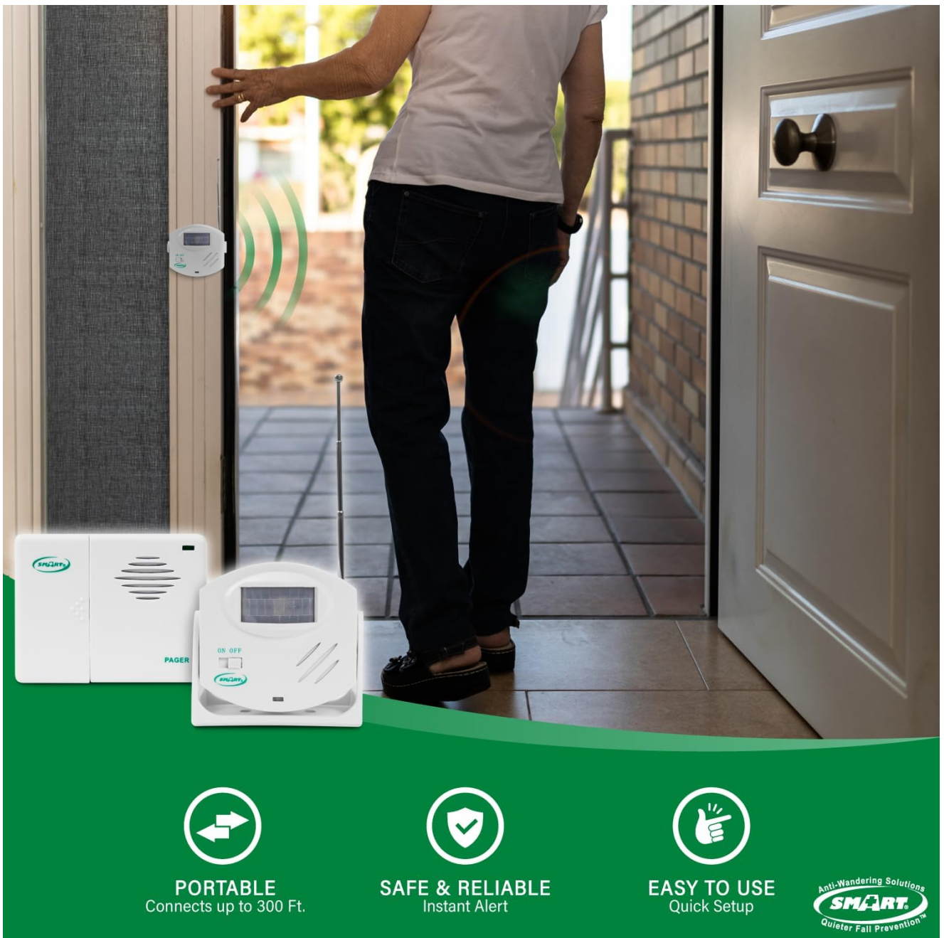
Image: The motion sensor positioned near a doorway, with the pager in the foreground, illustrating its use for monitoring entry/exit.