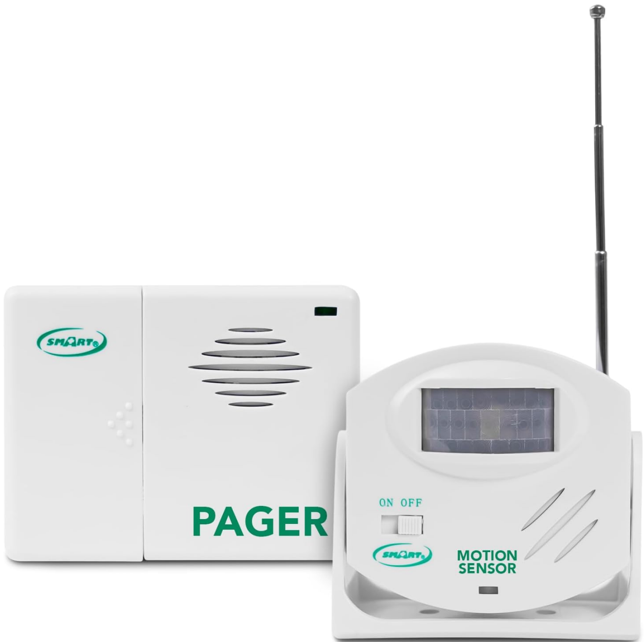
Image: The Smart Caregiver Wireless Motion Sensor and Pager, showing both units in white with green accents.