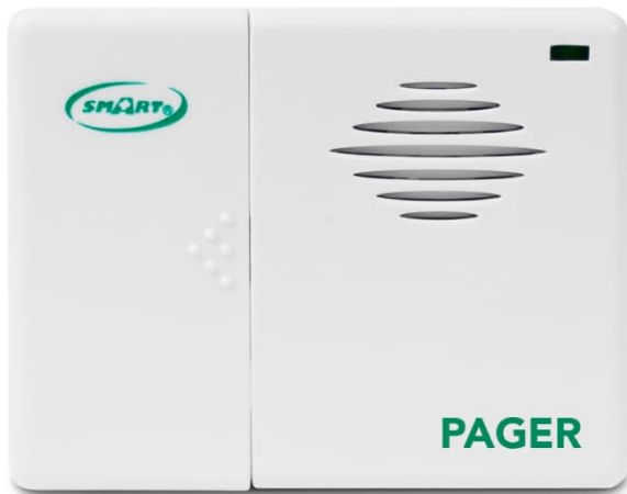
CLIP-ON CAREGIVER PAGER