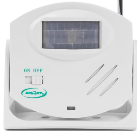
MOTION SENSOR WITH SWIVEL BRACKET