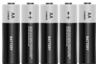
5 AA BATTERIES