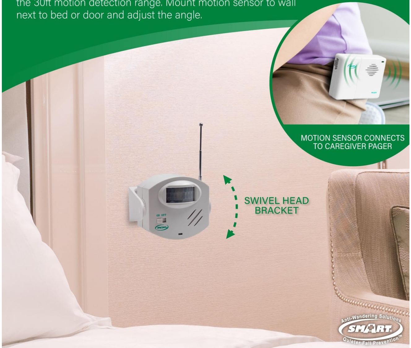
Image: A close-up of the wireless motion sensor mounted on a wall, highlighting its swivel head bracket for adjustable angle.

Wireless motion sensor system alerts caregivers when patients cross the 30ft motion detection range. Mount motion sensor to wall next to bed or door and adjust the angle.