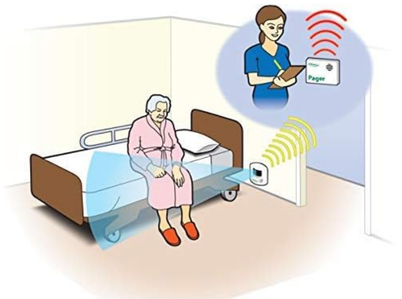
Image: A diagram showing the motion sensor placed near a bed, detecting when an individual attempts to sit up or leave the bed, and the pager alerting the caregiver.