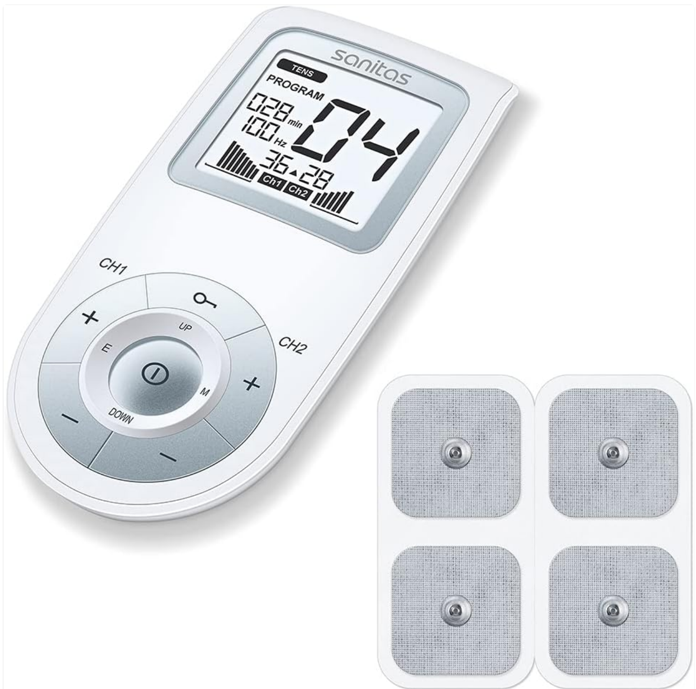
Figure 1: Sanitas SEM 43 Digital EMS/TENS Device with Electrode Pads.