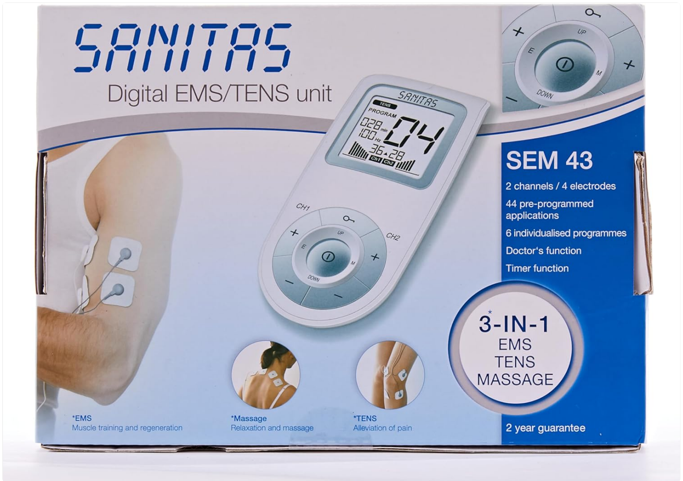
Figure 6: Product packaging highlighting key features and warranty information.