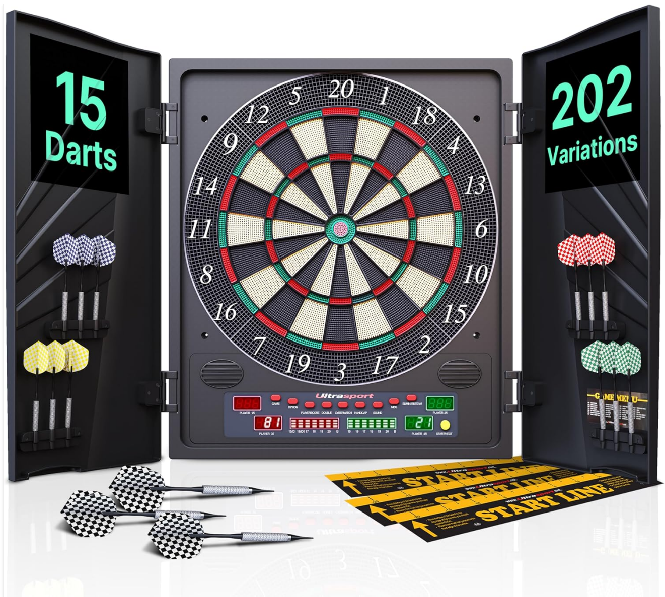
Image: The Ultrasport Electronic Dartboard with its protective doors open, displaying the dartboard face, a set of 15 soft-tip darts, and three throw line markers on the floor. The display shows '81' for Player 1 and '21' for Player 2, indicating an active game.