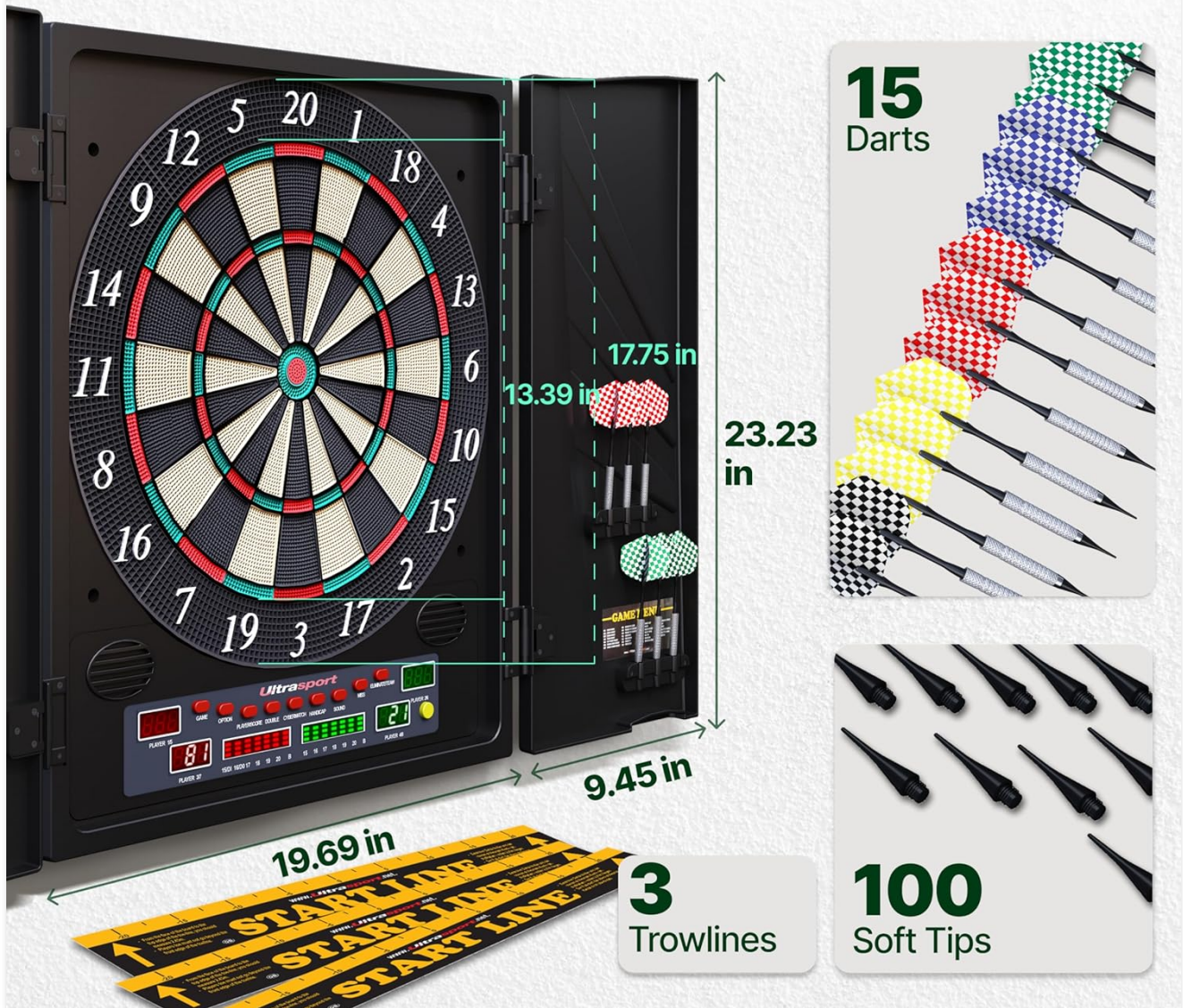
Image: A diagram illustrating the dimensions of the electronic dartboard (23.23 inches height, 19.69 inches width, 9.45 inches depth when open) and showcasing the included accessories: 15 darts, 100 soft tips, and 3 throw lines.