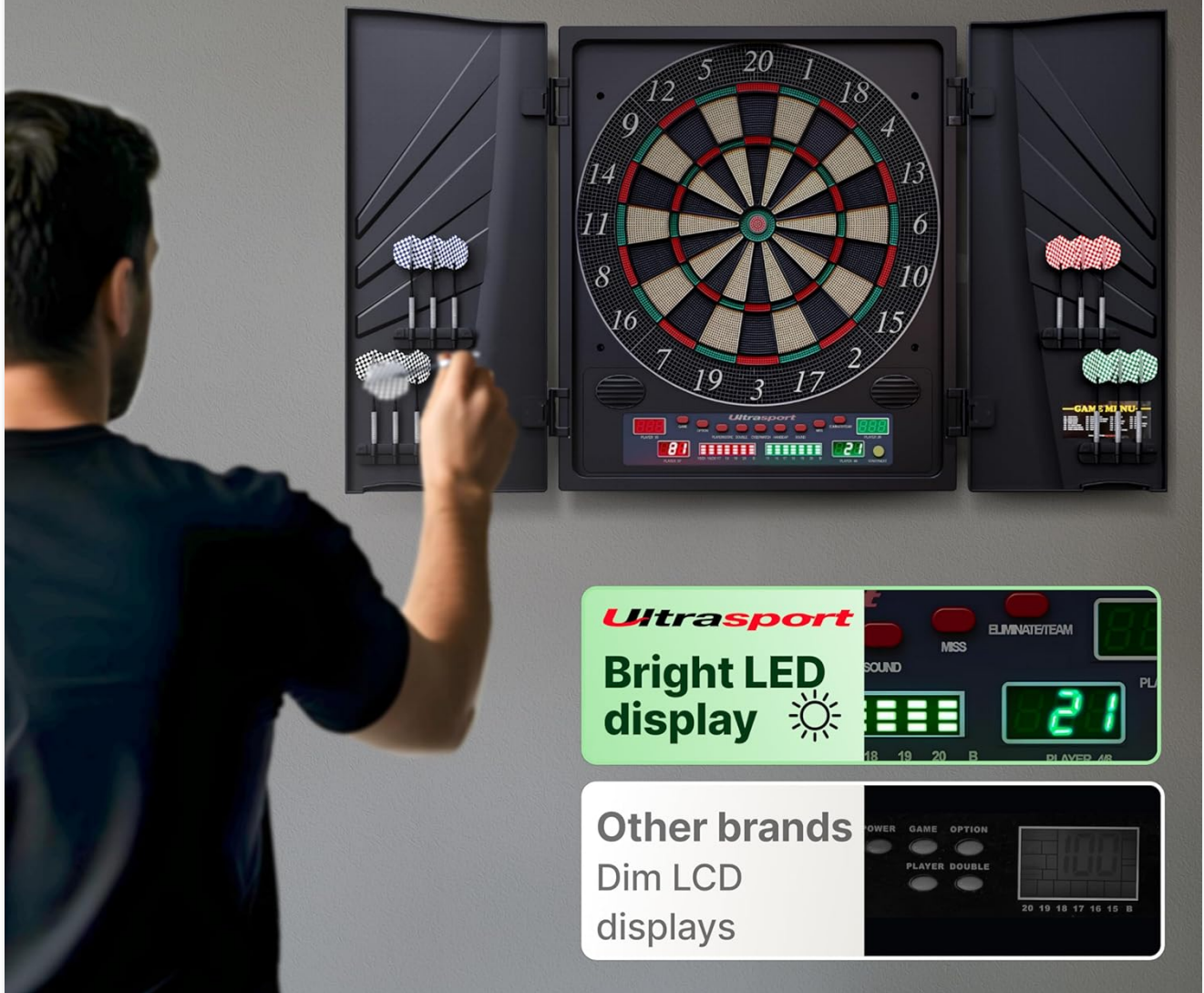
Image: A person is shown from behind, throwing a dart at the Ultrasport Electronic Dartboard. The bright LED display is clearly visible, showing a score of '21', indicating its high-contrast visibility during play.