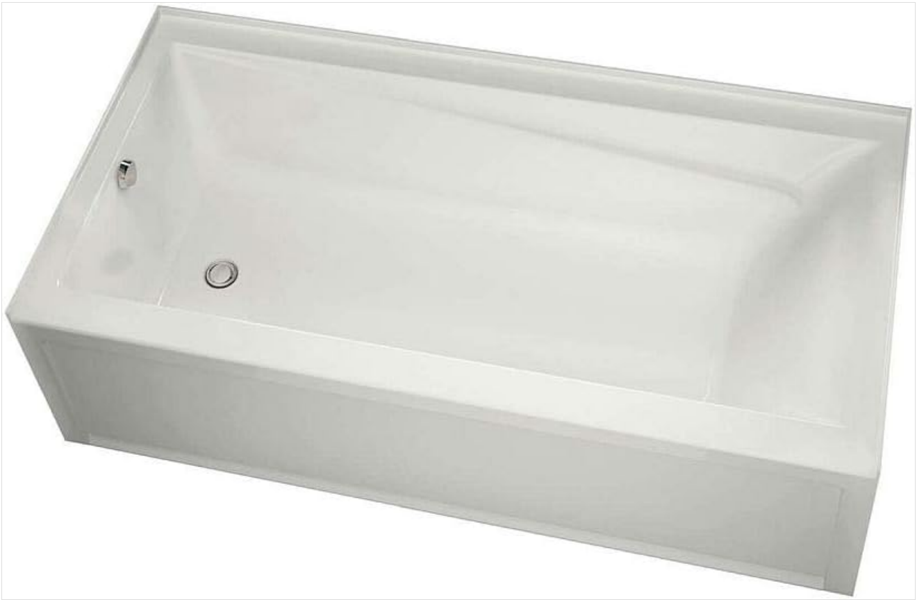
Image: A close-up, top-down perspective of the MAAX Exhibit Bathtub, clearly showing the right-hand drain and overflow assembly, along with the textured floor and discreet armrests.