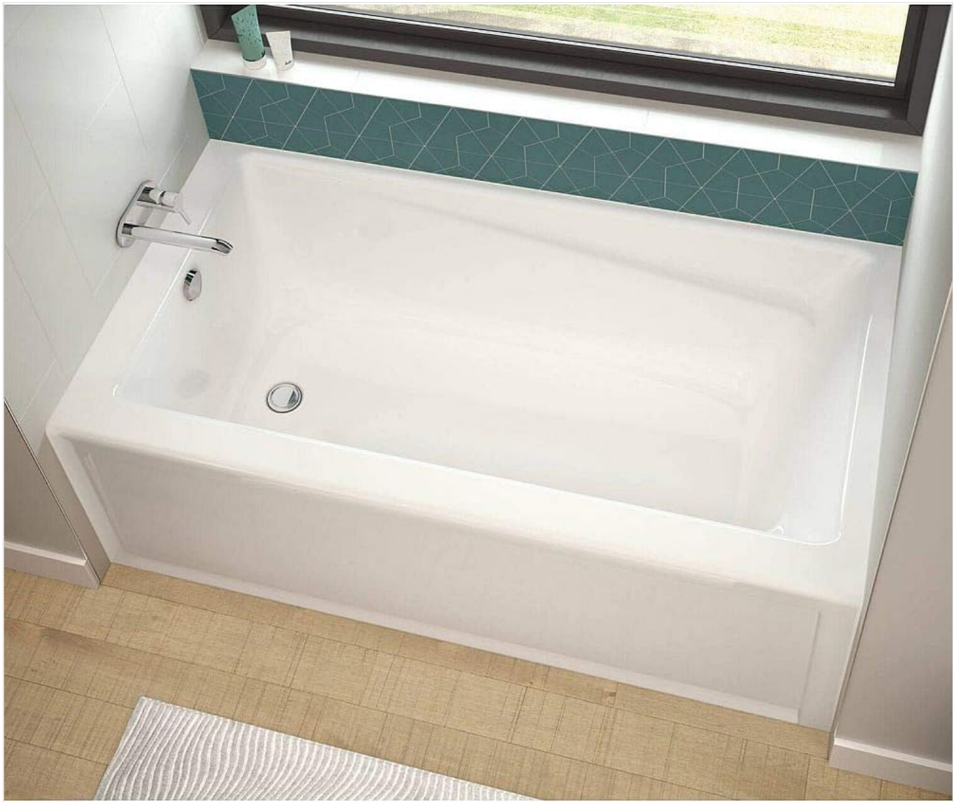
Image: MAAX Exhibit Bathtub installed in a bathroom setting, showcasing its right-hand drain and the integrated skirt. The bathtub is positioned under a window, highlighting its alcove installation.