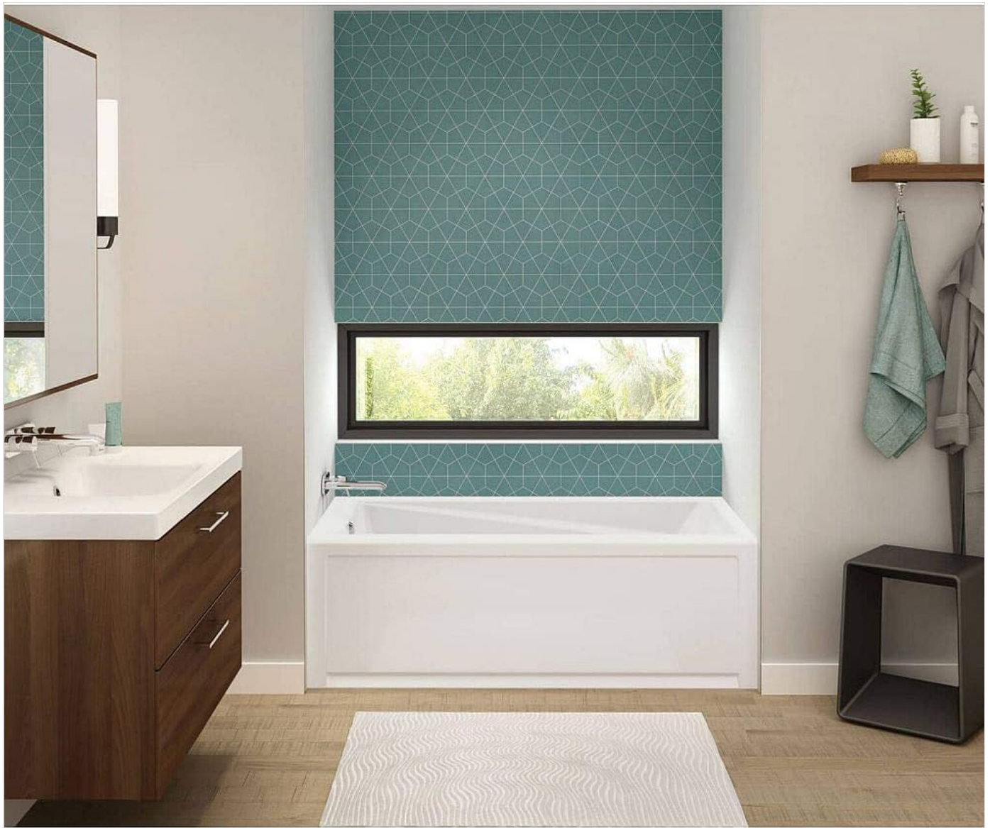
Image: A wider view of the MAAX Exhibit Bathtub in a bathroom, illustrating its minimalist design and how it integrates into a modern bathroom environment. The image shows the full length of the tub and its surrounding wall and floor.