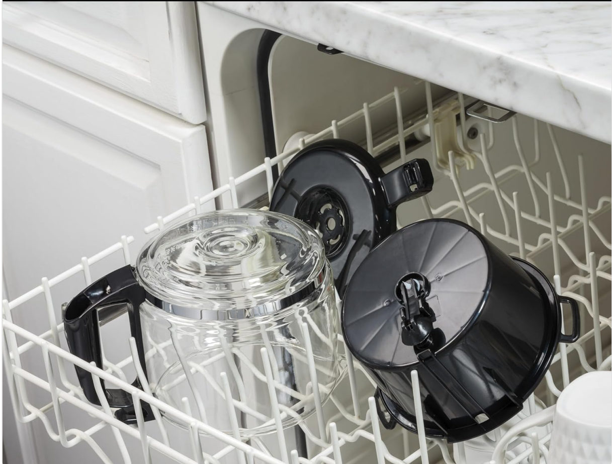
Image: The durable borosilicate glass carafe and Lift & Clean brew basket are dishwasher safe for easy cleaning.