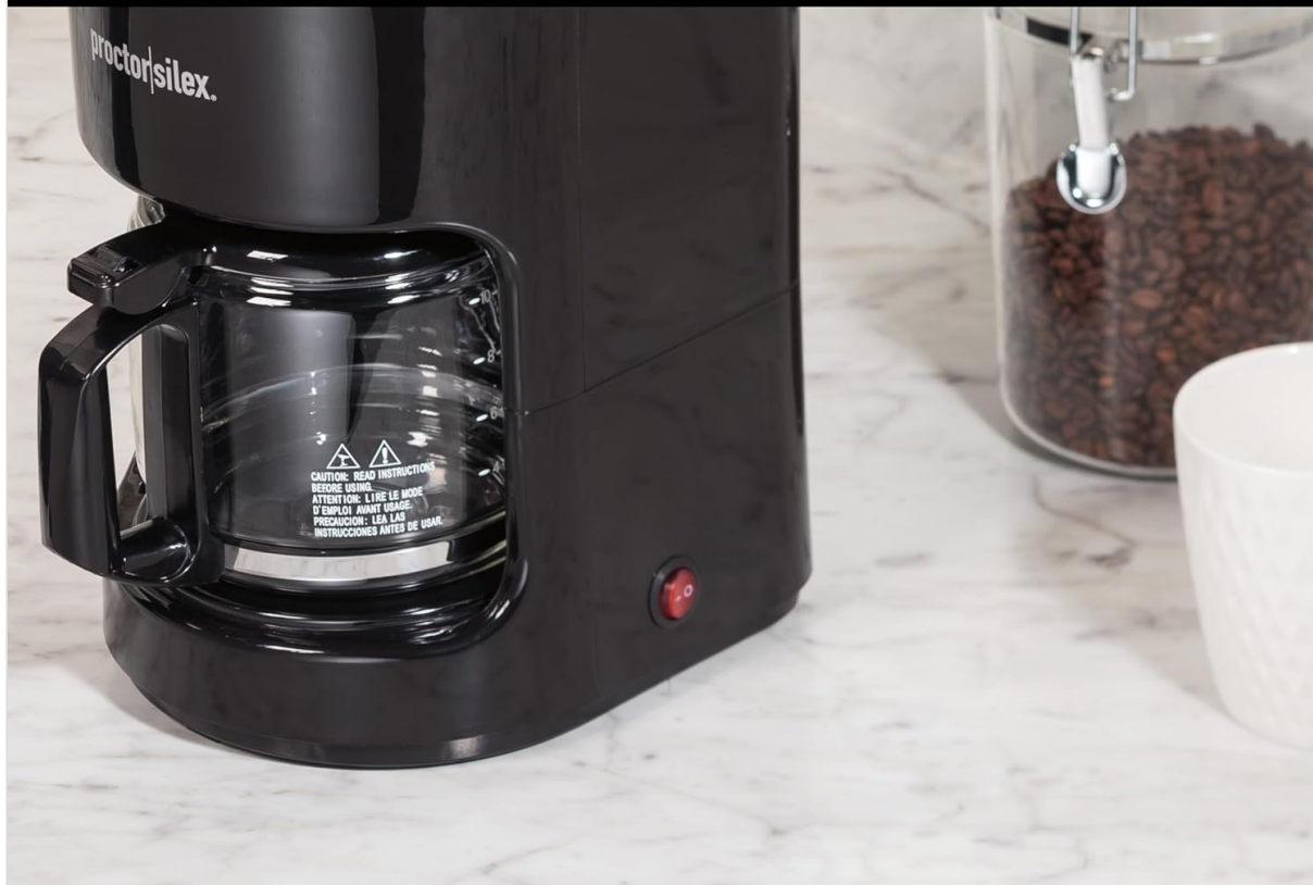
Image: The ON/OFF indicator light clearly shows when the coffee maker is in operation.

On/off indicator light on the switch illuminates when the coffee maker is on