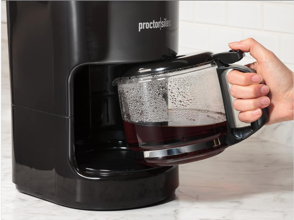
Image: The Auto Pause & Pour feature allows you to grab a cup of coffee before the brewing cycle is complete.

With Auto Pause & Pour, the flow of coffee stops when you lift the carafe