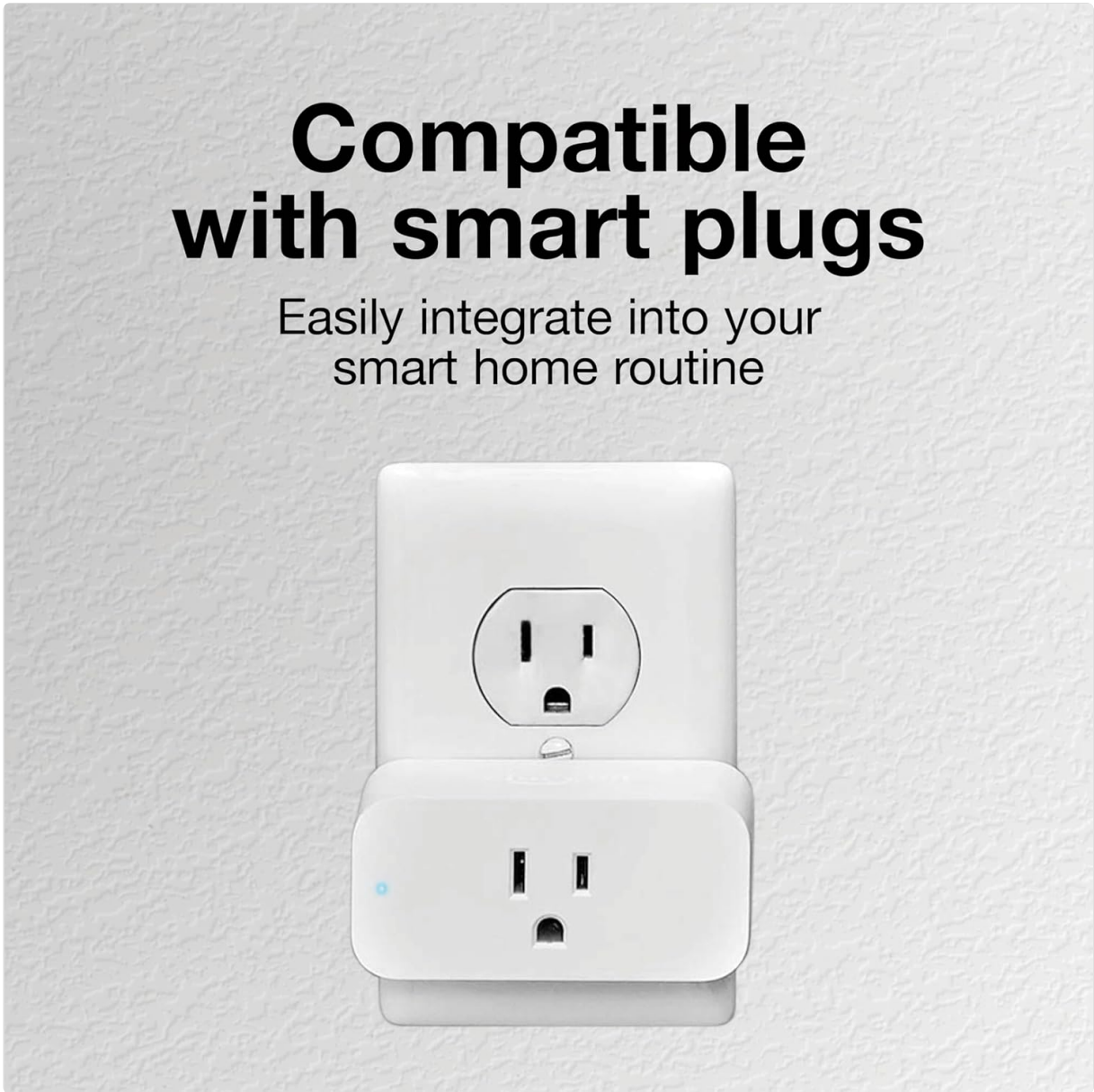
Image: The coffee maker is compatible with smart plugs (sold separately) for integration into smart home routines.

Easily integrate into your smart home routine