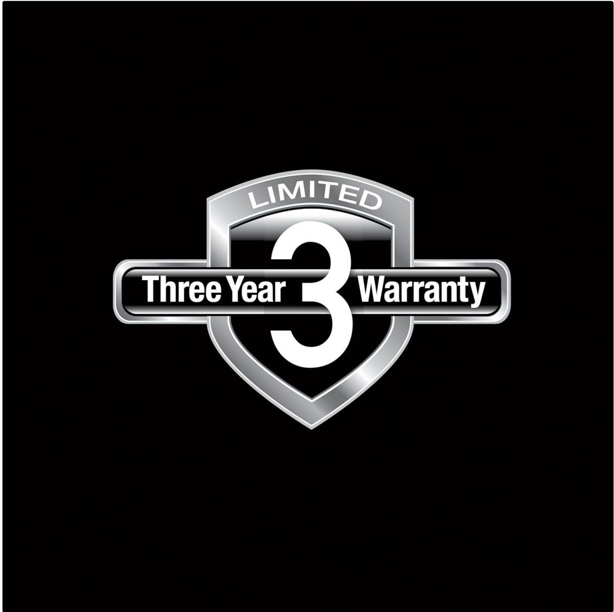
Image: The 3-Year Limited Warranty ensures product reliability and customer satisfaction.

This Proctor Silex coffee maker is backed by a 3-Year Limited Warranty . For warranty claims, product support, or to purchase replacement parts, please visit the official Proctor Silex website or contact their customer service department.