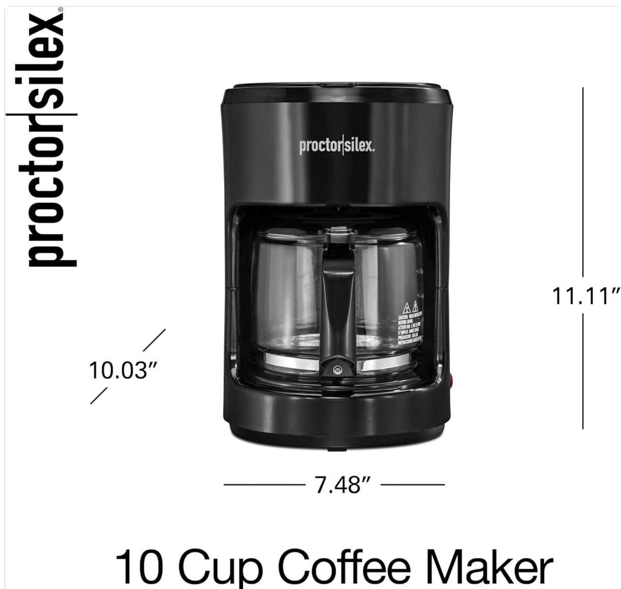
Image: Detailed dimensions of the coffee maker for placement and reference.