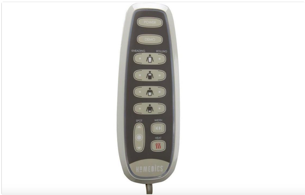
Figure 2: Remote control for the HoMedics MCS-510H massage cushion. This remote allows full control over massage type, intensity, and heat functions.