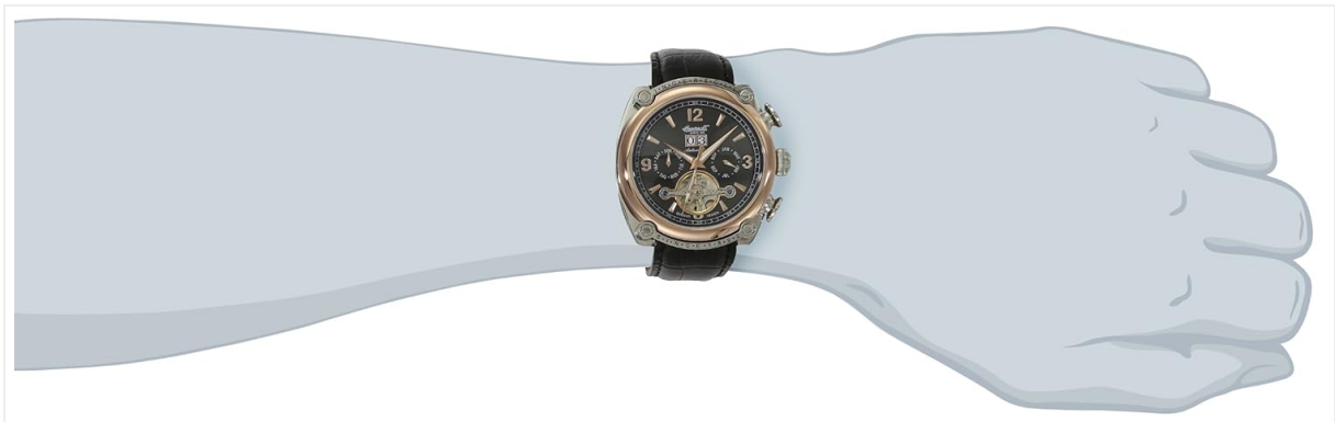
Image: The Ingersoll IN6907RBK watch displayed on a wrist, illustrating its size and fit.

Fasten the watch securely but comfortably on your wrist. The automatic movement is powered by the motion of your arm, so regular wear will keep the watch wound. If the watch is not worn for an extended period, it may stop and require manual winding to restart.