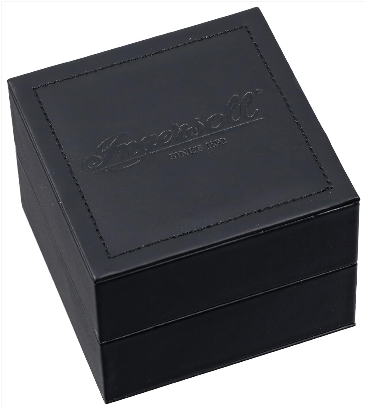
Image: The black Ingersoll watch box, designed for safe storage and presentation of the timepiece.

Carefully remove the watch from its packaging. Inspect the watch for any visible damage. Retain the original packaging for future storage or transport.