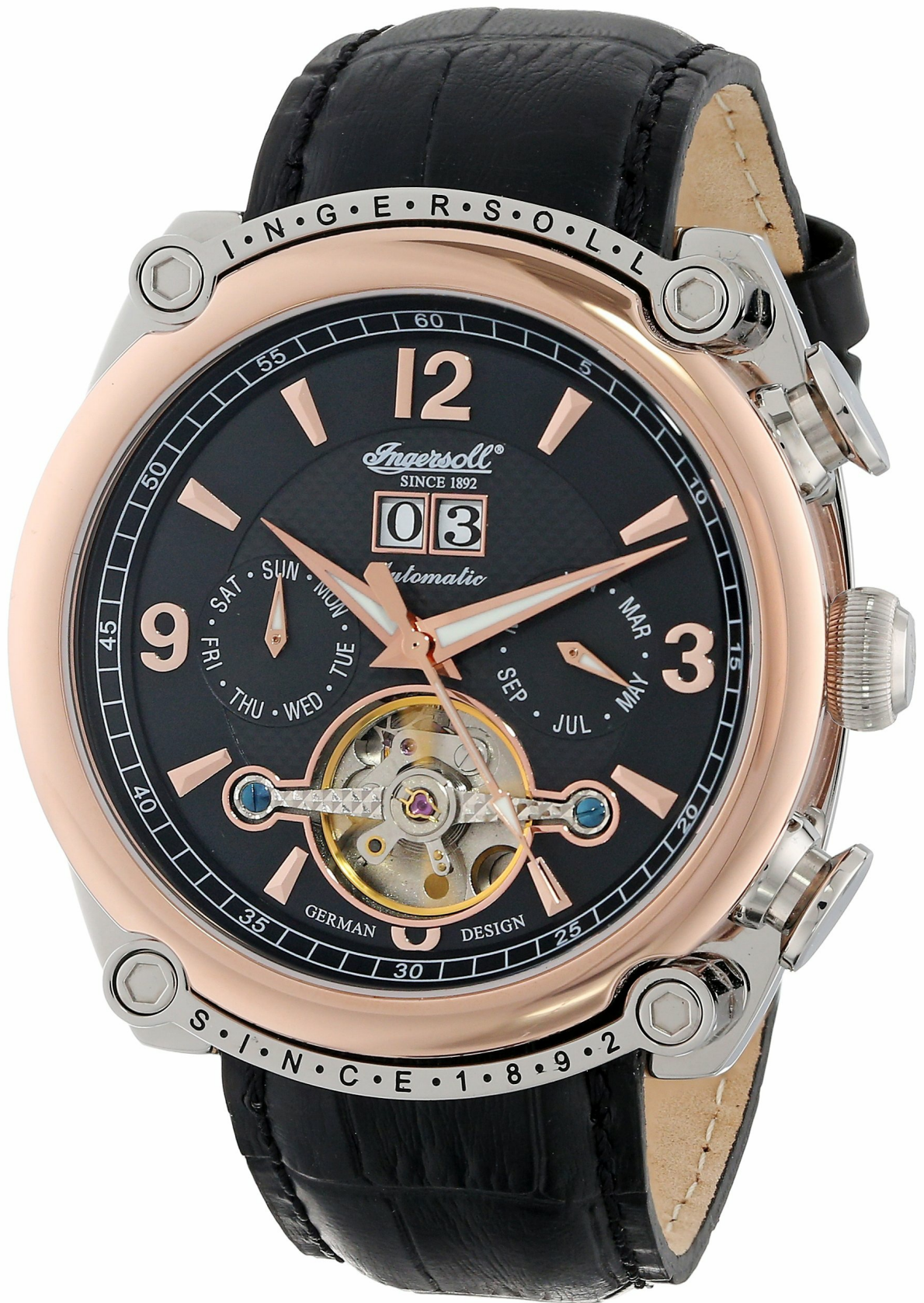
Image: Front view of the Ingersoll IN6907RBK Cimarron automatic watch, showcasing its analog display and intricate dial details.