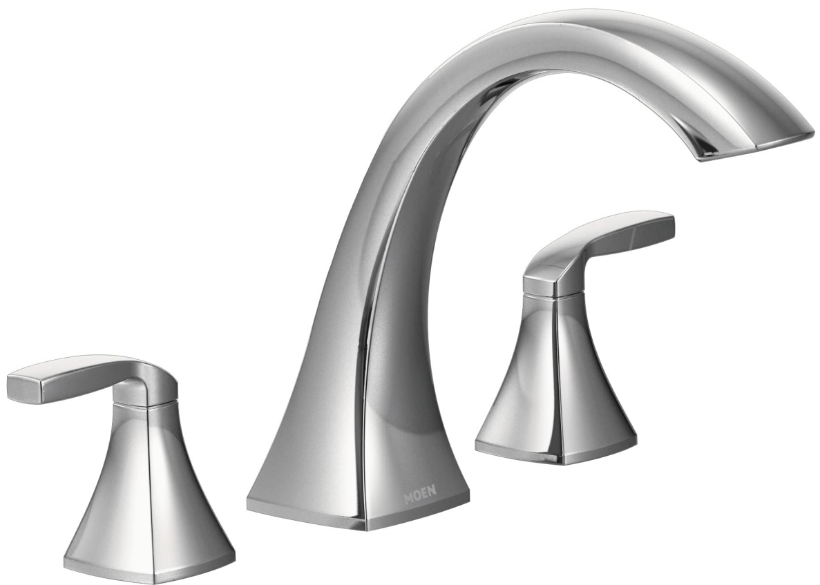
Image: Moen Voss Chrome Two-Handle Roman Tub Faucet Trim Kit, showcasing the high-arc spout and two lever handles.