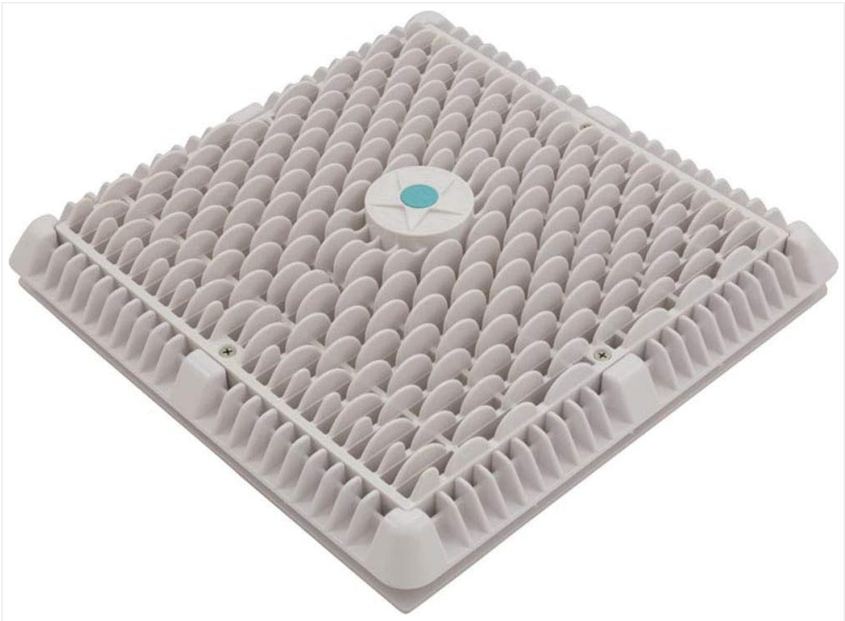
Figure 2.1: Top view of the AquaStar Square Wave Suction Outlet Cover.