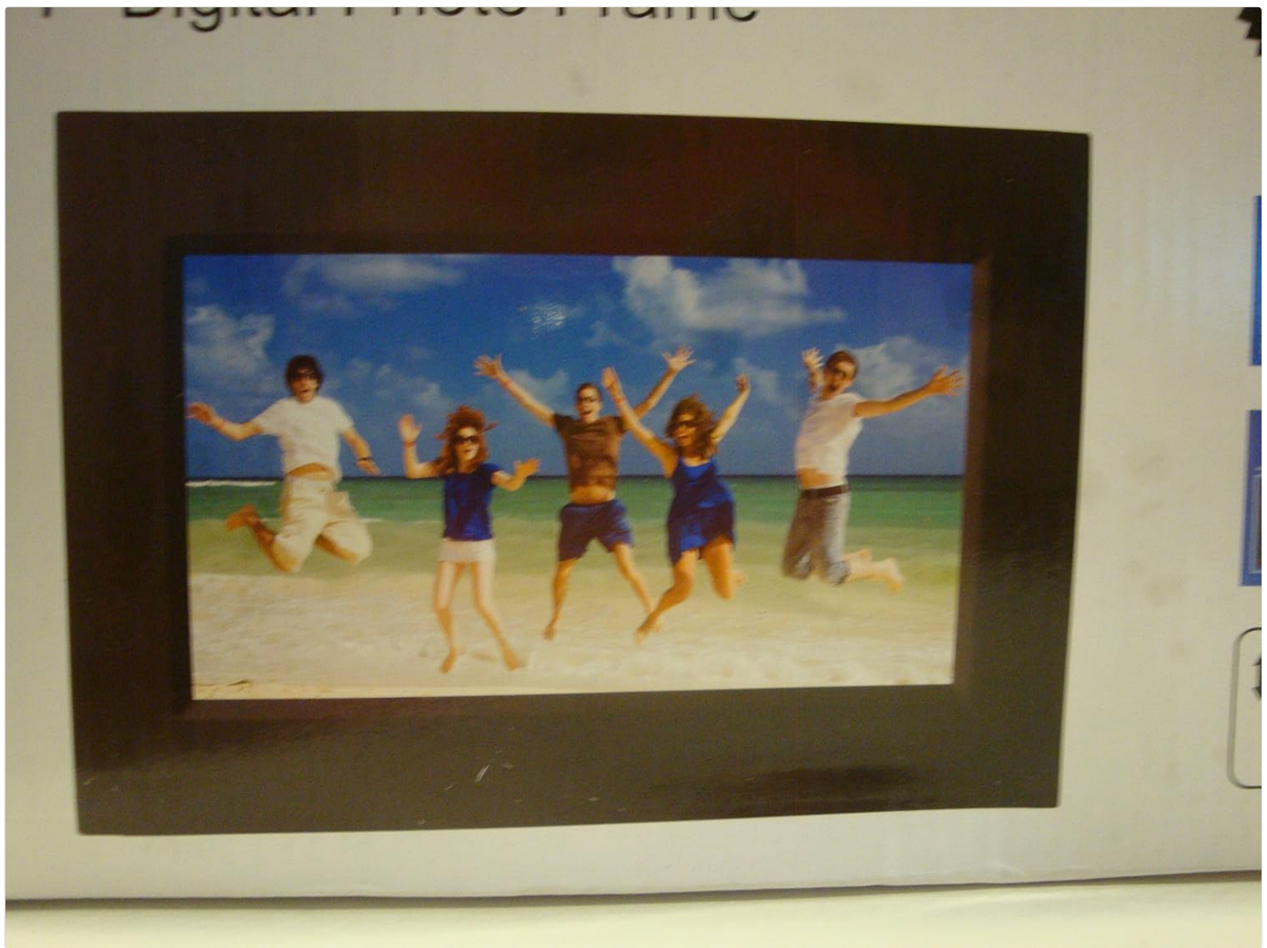
Image: Front view of the Sylvania SDPF757 Digital Photo Frame. This image shows the digital photo frame displaying a picture of people on a beach, illustrating its primary function.