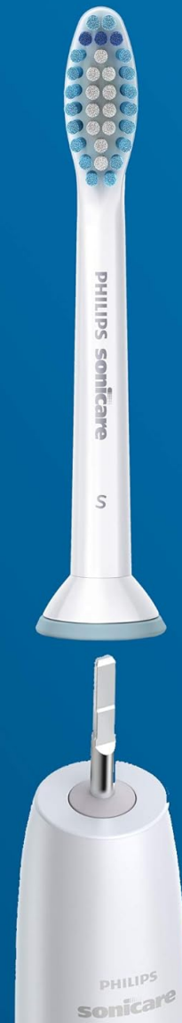
Image: A Philips Sonicare Sensitive brush head being clicked onto a Philips Sonicare toothbrush handle, demonstrating the easy attachment process.

Fits all Philips Sonicare click-on handles