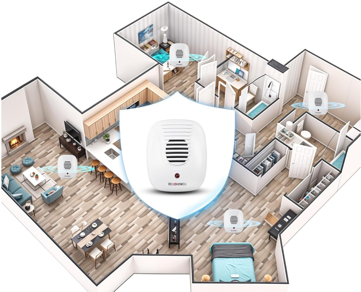
Figure 4: For complete room coverage, place one unit in each room as ultrasonic waves do not pass through walls.

Each Pest Repeller is Designed for One Room For Optimal Performance, Use One Per Room