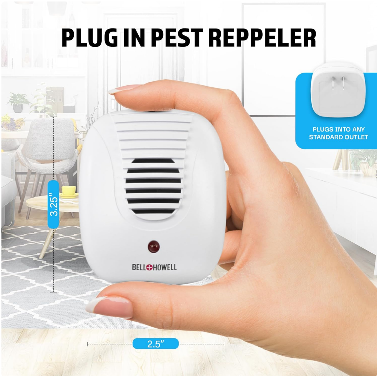
Figure 2: The Bell+Howell Pest Repeller is designed for easy plug-in installation.

For optimal performance, it is recommended to use one unit per room, as ultrasonic waves do not penetrate walls. For larger rooms or areas with significant pest issues, multiple units may be necessary to ensure complete coverage.