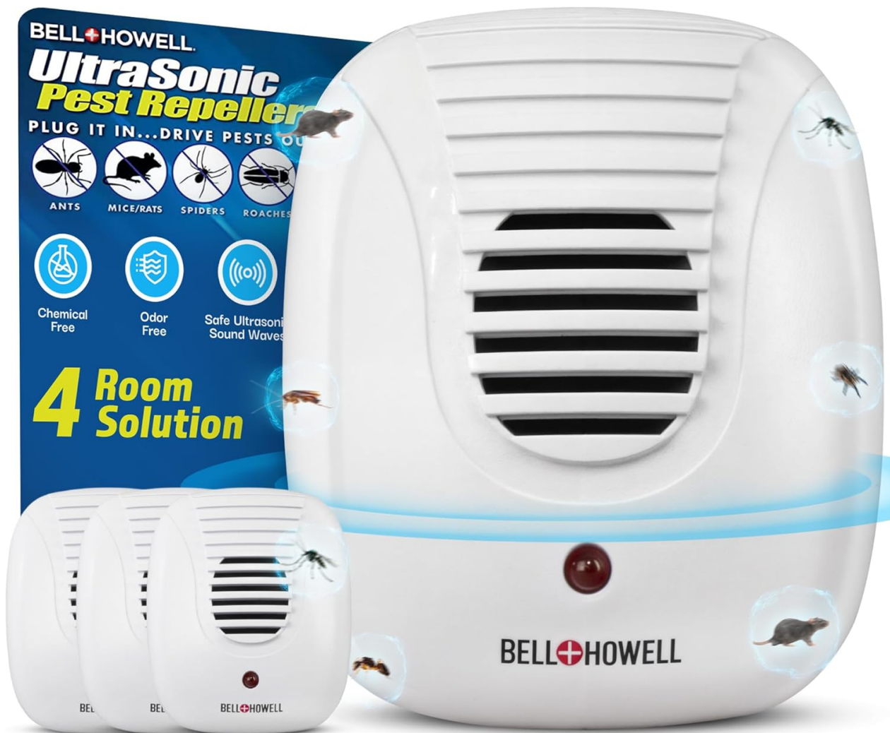
Figure 1: Bell+Howell Ultrasonic Pest Repeller units in a 4-pack.

Unlike traditional pest control methods that rely on harmful chemicals or messy traps, the Bell+Howell Pest Repeller provides a clean and convenient alternative. Simply plug it into a standard electrical outlet, and it begins working immediately to create an uncomfortable environment for pests, encouraging them to leave your premises.