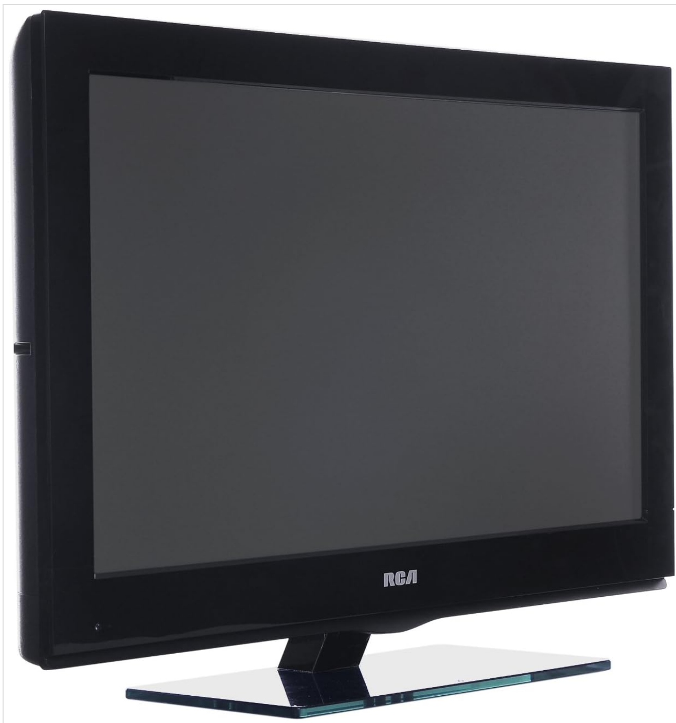
Front view of the RCA 32LB45RQ HDTV with its stand attached.

To attach the included stand, carefully place the TV screen-down on a soft, clean surface to prevent scratches. Align the stand with the mounting holes on the bottom of the TV and secure it using the provided screws. Ensure the stand is firmly attached before placing the TV upright.