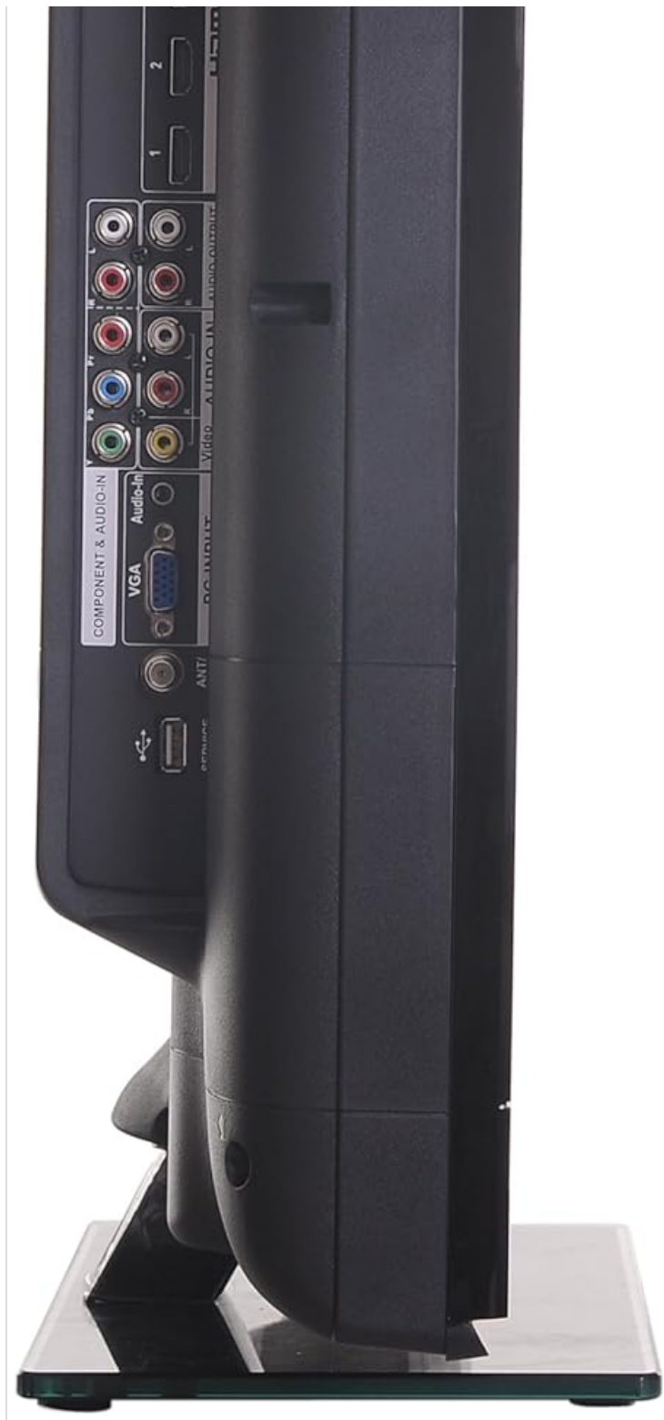
Side view of the RCA 32LB45RQ HDTV, showing additional input ports for convenient access.