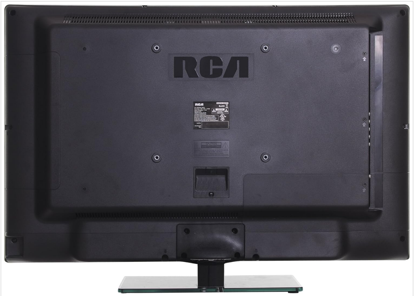
Rear view of the RCA 32LB45RQ HDTV, highlighting the various input ports for external devices.