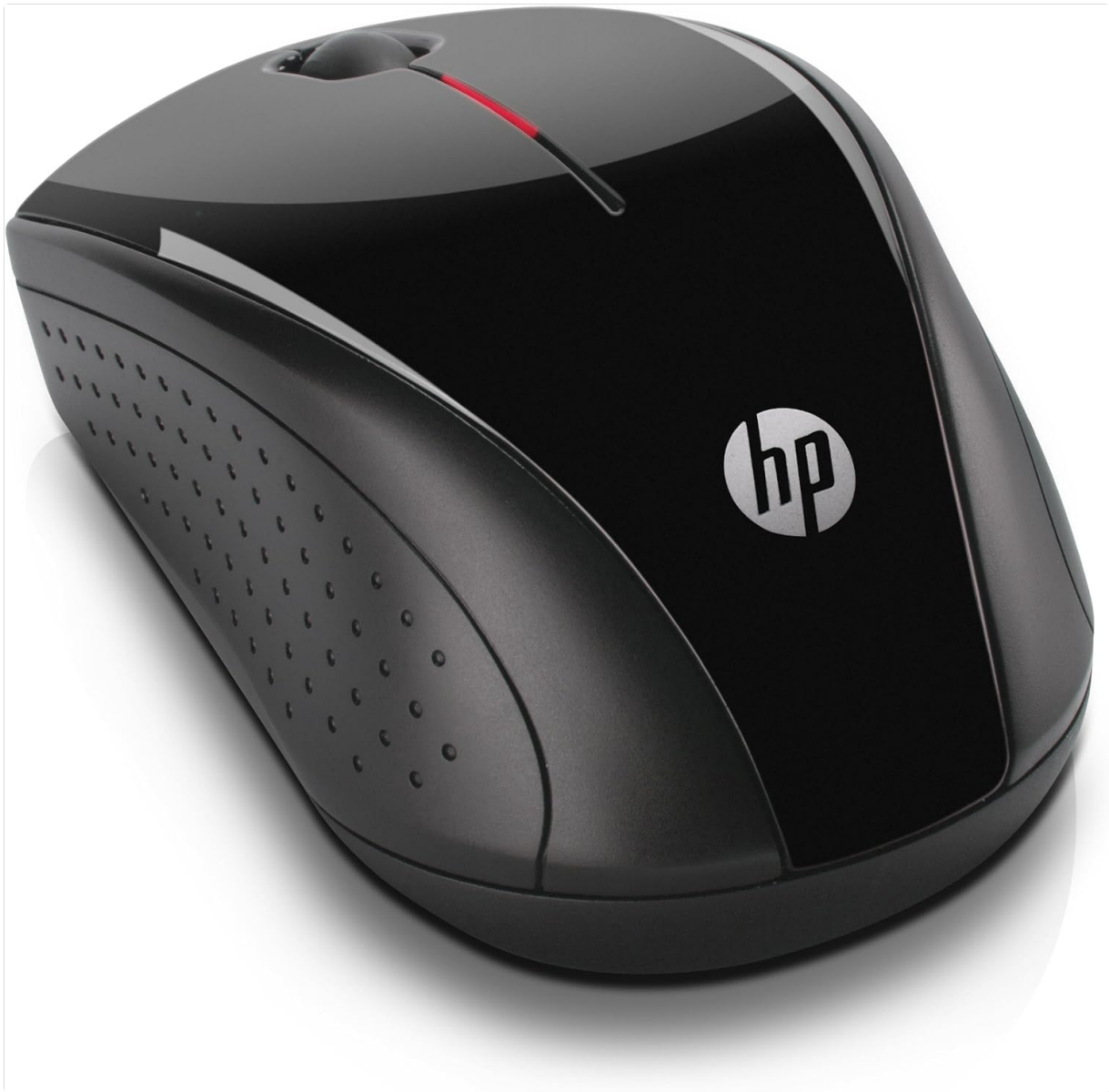
Image: HP X3000 Wireless Mouse, side view.

also be pressed as a middle button for additional functions in some applications.