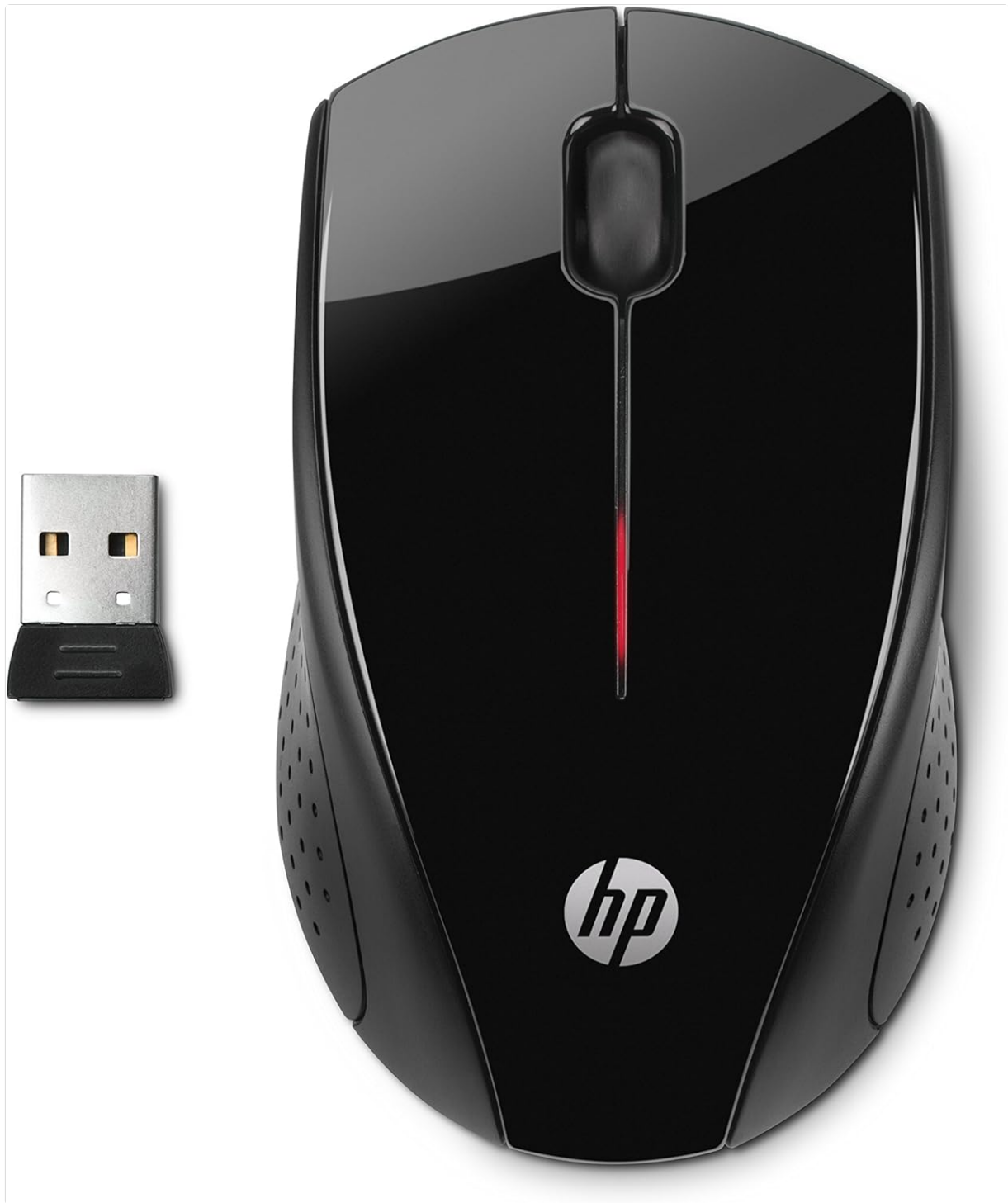
Image: HP X3000 Wireless Mouse with its USB receiver.