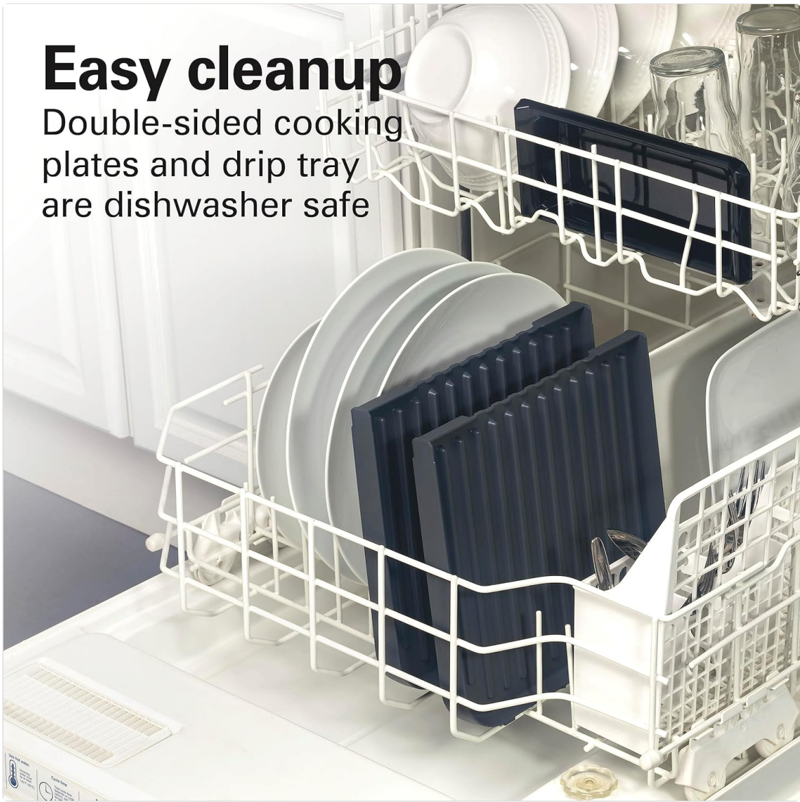
Figure 5.1: The double-sided cooking plates and drip tray are designed for easy cleanup and are dishwasher safe.

Double-sided cooking plates and drip tray are dishwasher safe