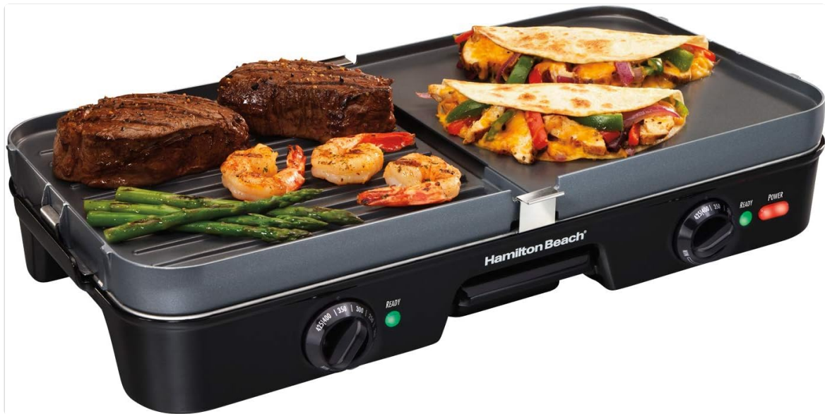
Figure 2.1: The Hamilton Beach 3-in-1 Electric Indoor Grill + Griddle in use, showcasing its dual functionality with grilled meats and vegetables on one side and quesadillas on the griddle side.

The Hamilton Beach 3-in-1 Electric Indoor Grill + Griddle offers versatile cooking options for a variety of meals. It features two reversible, nonstick cooking plates that can be used as a full grill, a full griddle, or a combination of both. Each cooking zone has independent temperature controls, allowing for precise cooking of different foods simultaneously.