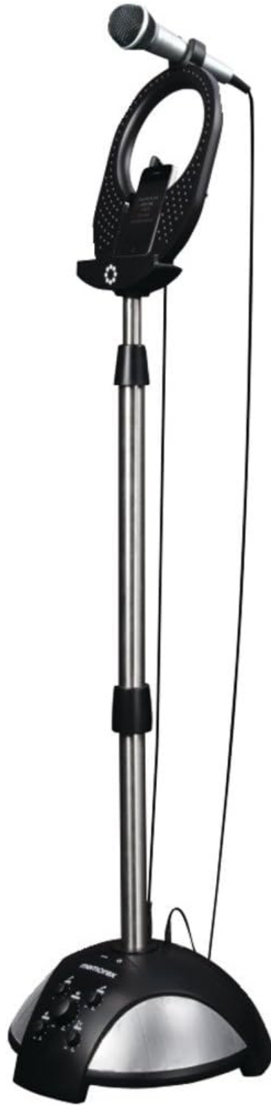
Figure 1: Memorex MKS-SS2 SingStand 2 unit, showing the microphone, stand, and base with integrated speakers.