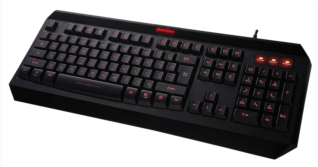
Figure 2.1: Top-down view of the Perixx PX-1000 keyboard with red backlighting activated. This image displays the full QWERTY layout, numeric keypad, and function keys.