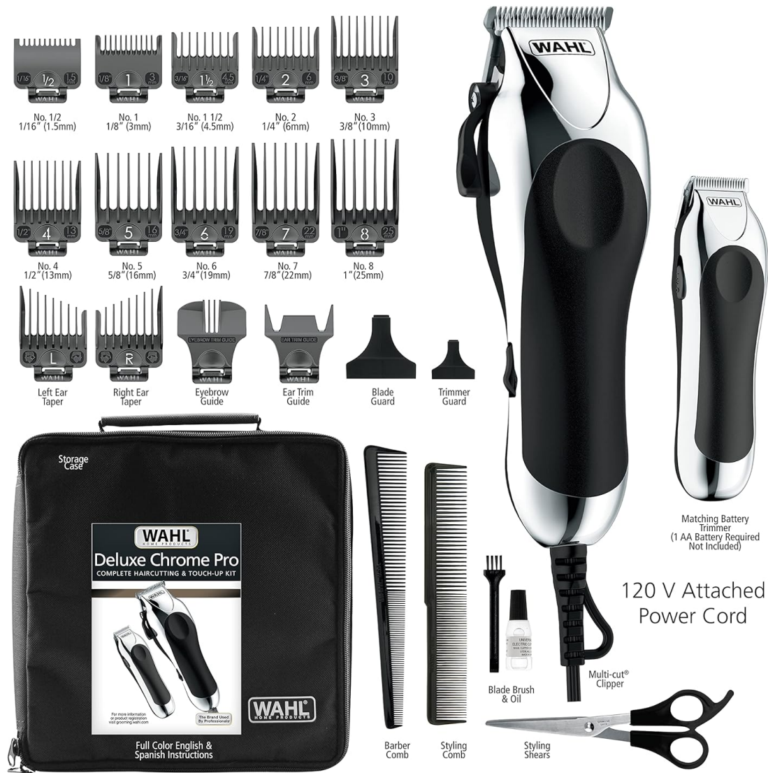
Image: A detailed layout of all 25 pieces included in the kit, featuring the main clipper, mini trimmer, multiple guide combs, scissors, combs, cleaning tools, and storage case.