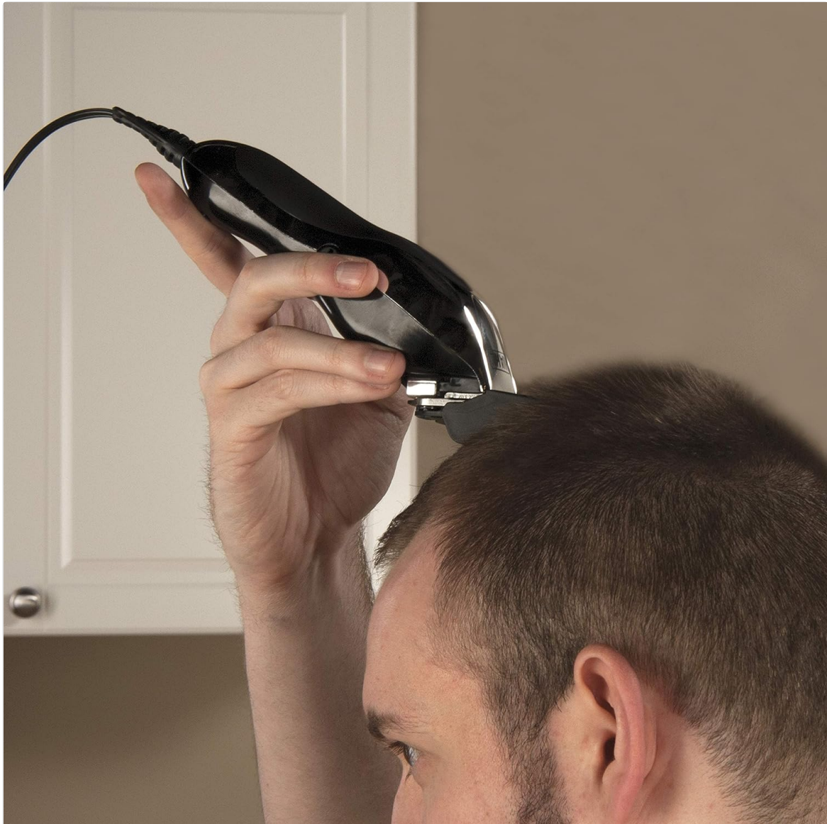
Image: A man demonstrating the use of the corded clipper for a self-haircut, illustrating proper grip and movement.