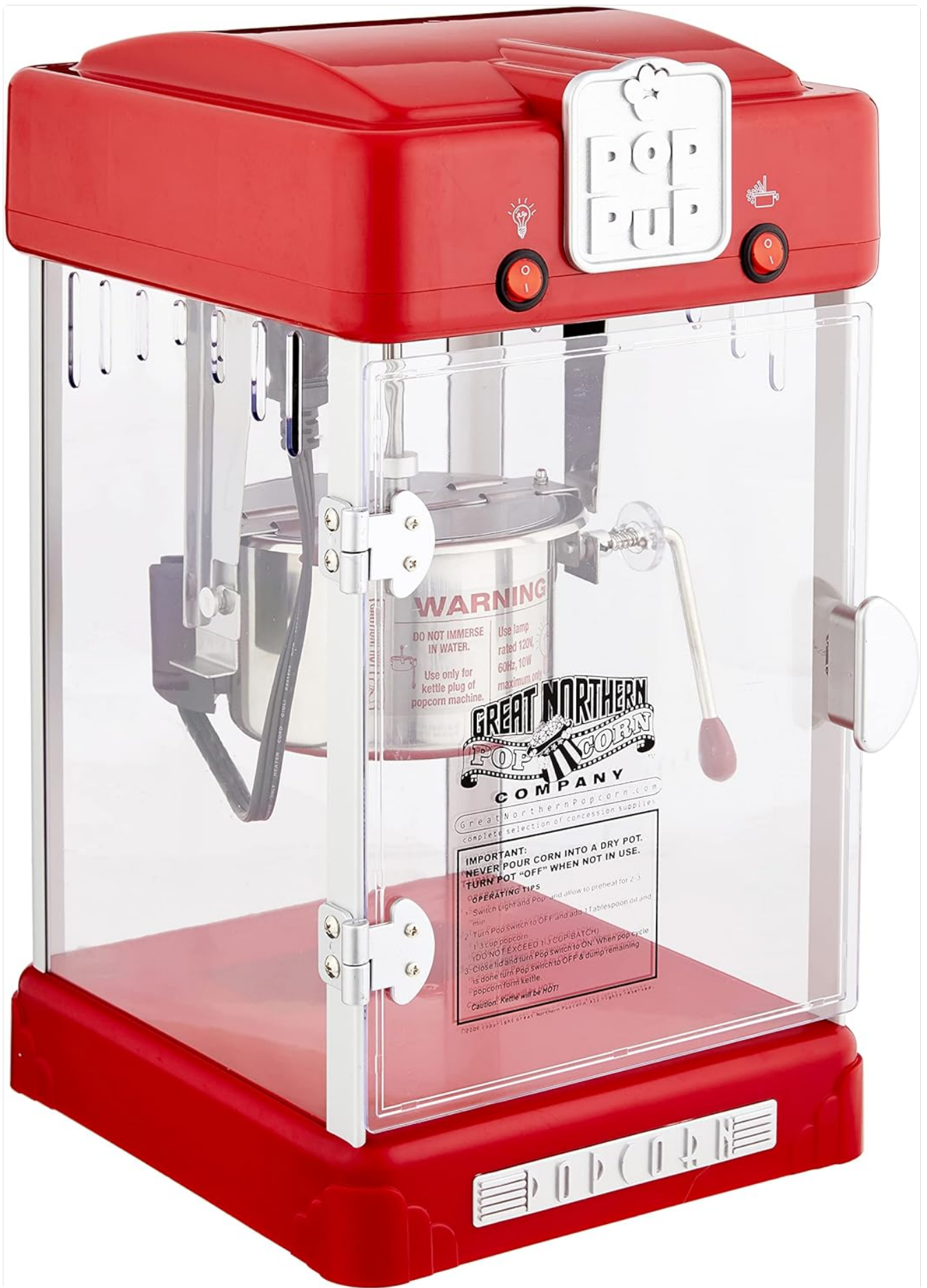
Image 1.1: The Pop Pup Popcorn Machine, showcasing its compact design and classic red finish.