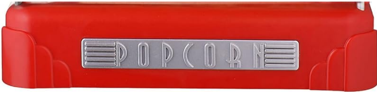
Image 3.1: Front view of the popcorn machine, highlighting the kettle, warming light, and removable serving tray.