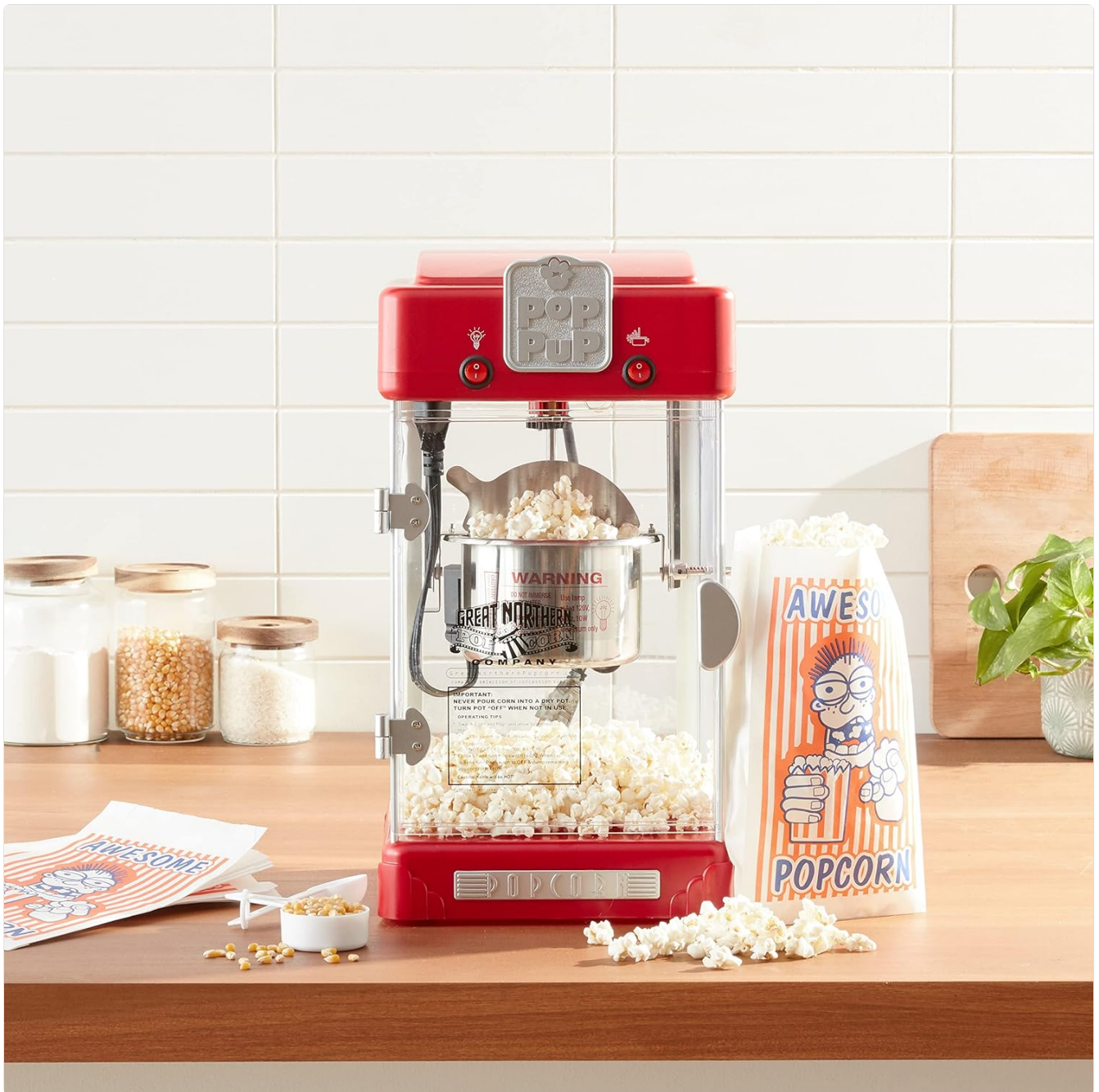
Image 6.1: The Pop Pup Popcorn Machine, clean and ready for use or storage on a kitchen counter.