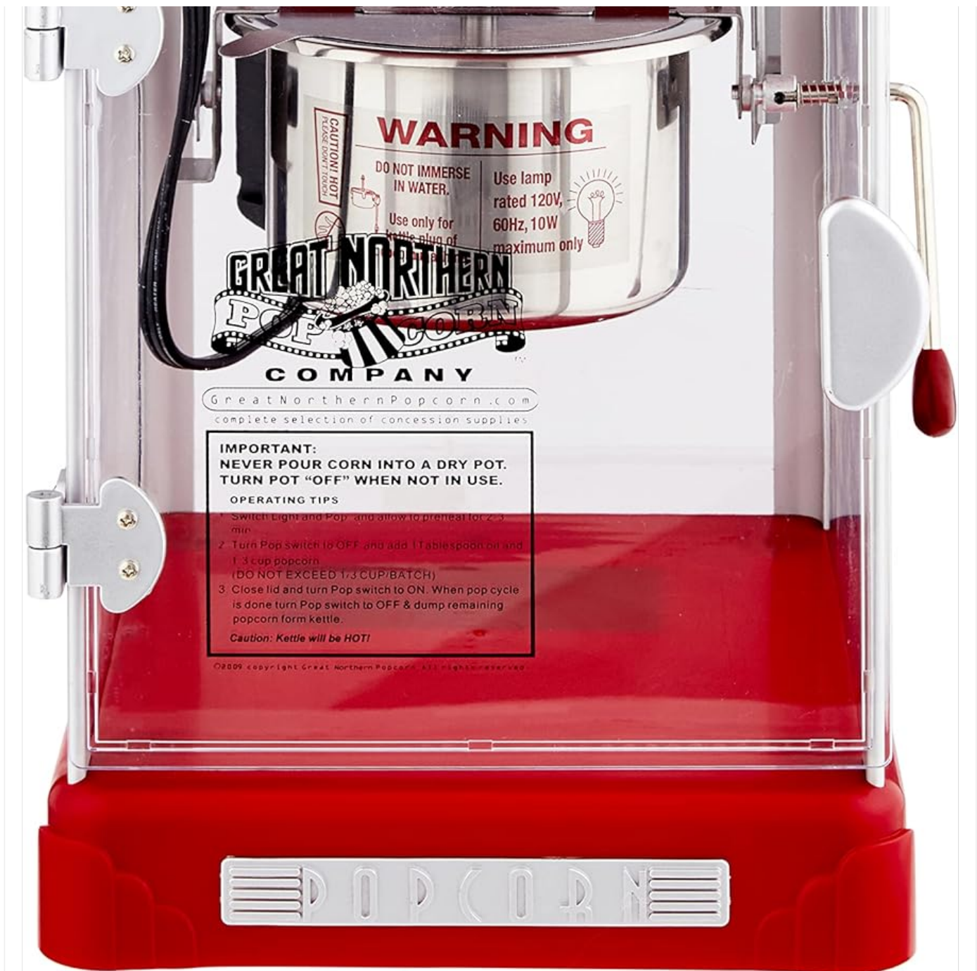
Image 2.1: Close-up of the popcorn machine's kettle, showing important warning labels regarding heat and electrical safety.