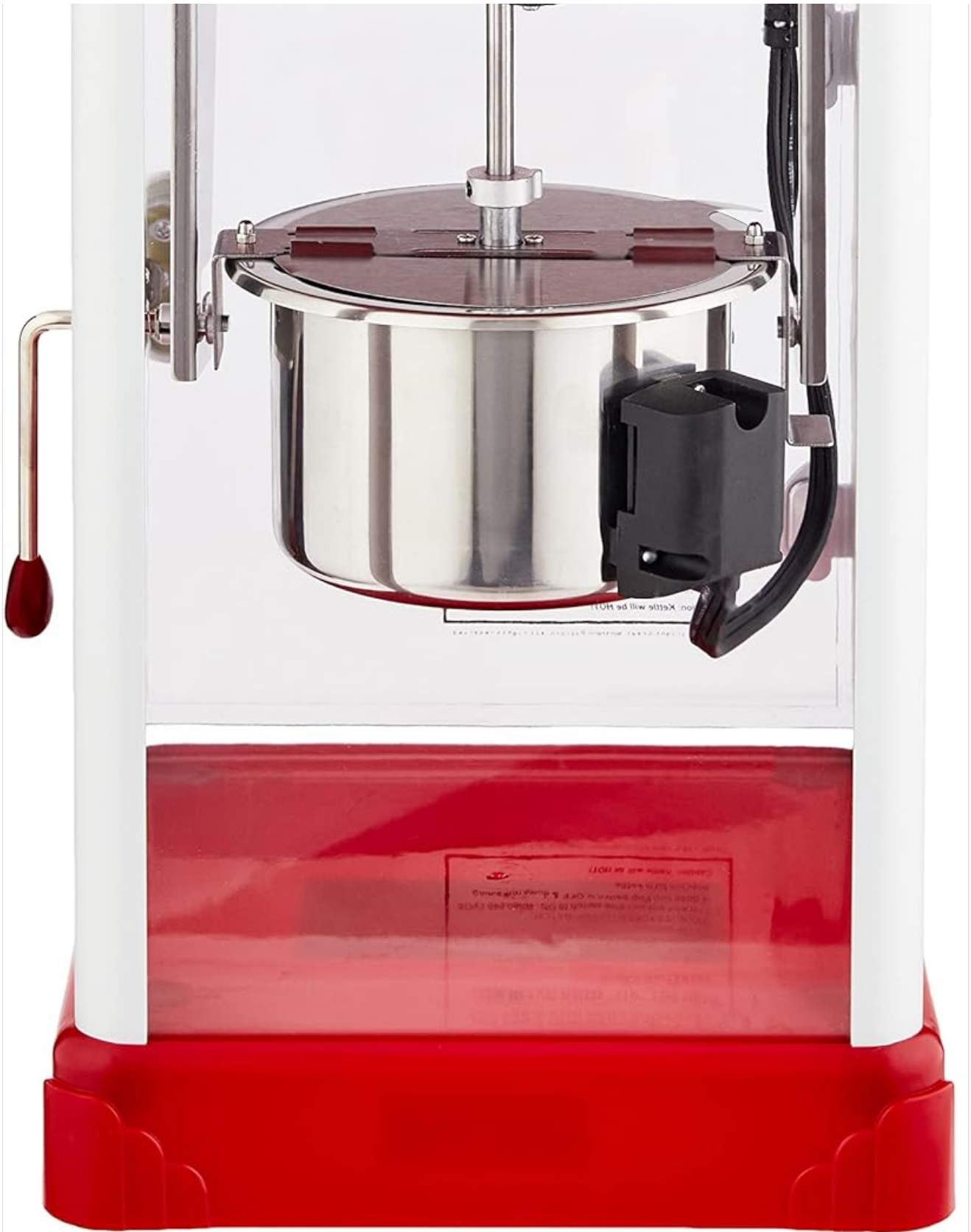
Image 5.1: The stainless-steel kettle, where kernels are heated and popped.