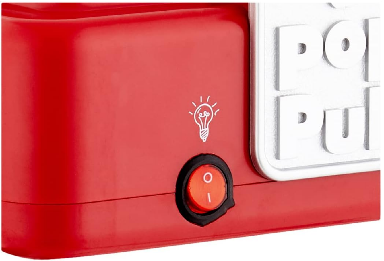
Image 5.2: The independent switch for the warming light, located on the top panel.