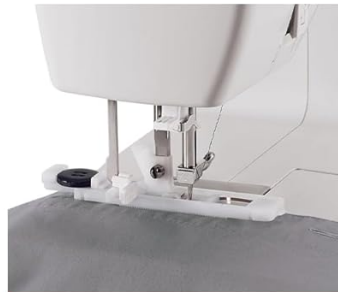
1 Step Buttonhole