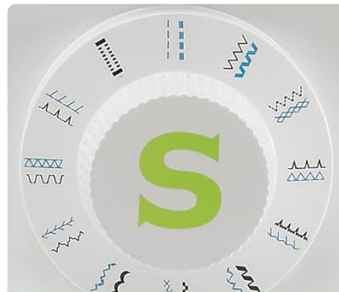
Easy Stitch Selection

Proper bobbin winding and insertion are crucial for smooth operation.