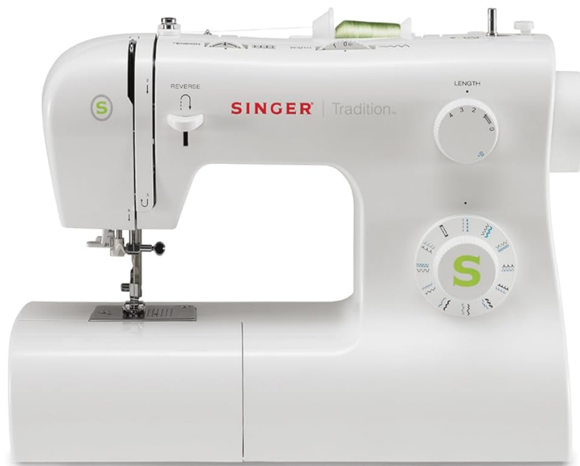
Image: The bobbin area of the SINGER Tradition 2277 sewing machine, showing the front-load bobbin system.

For detailed instructions on how to insert a front-loading bobbin, please refer to the video below: