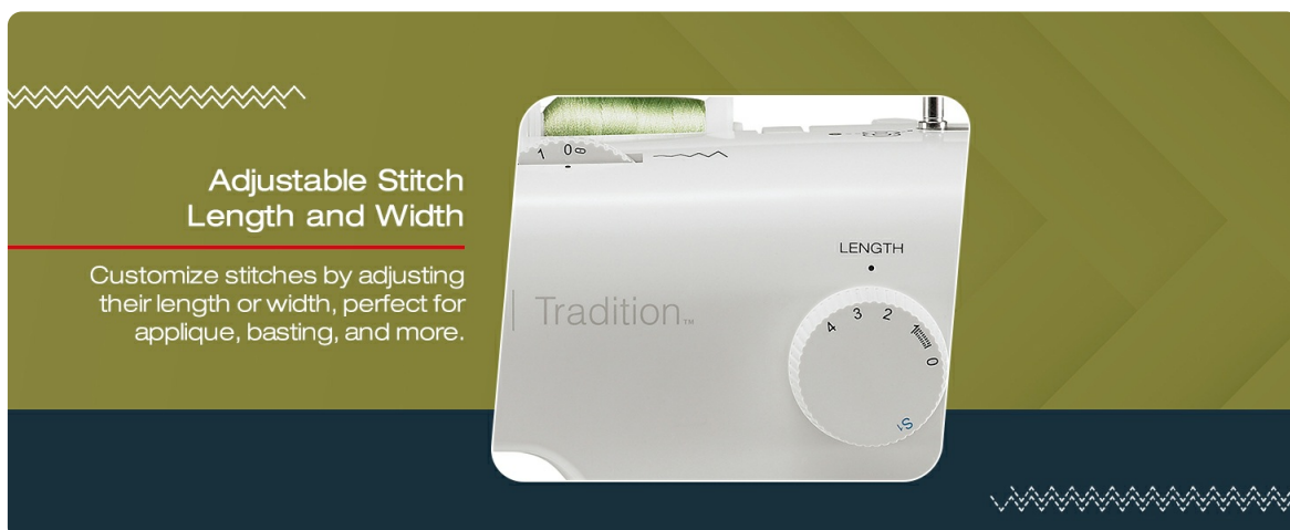
Image: The adjustable stitch length and width dials on the SINGER Tradition 2277, allowing for precise stitch customization.

Customize your stitches by adjusting their length and width using the dedicated dials. This allows for stronger seams and prevents fabric bunching, adapting to different fabric types and project requirements.