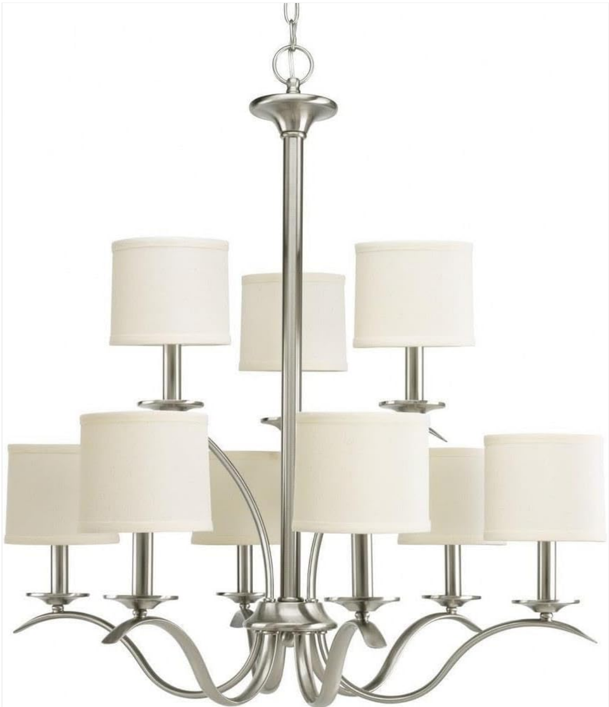
Image: The Inspire Collection 9-Light Chandelier featuring a brushed nickel finish and off-white linen shades.