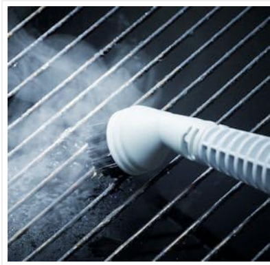
Figure 4: Using steam to clean a grill surface.