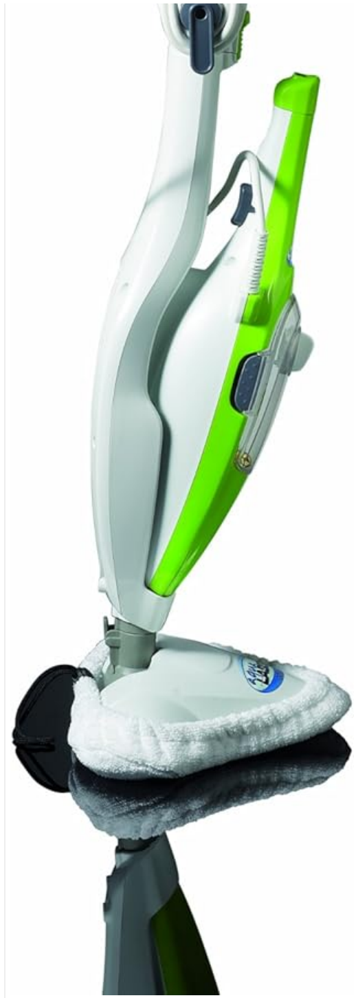
Figure 1: Aqua Laser Gold Steam Cleaner main unit.