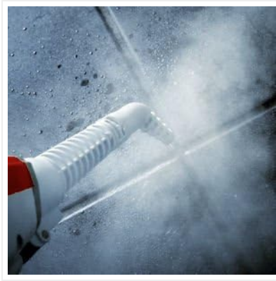
Figure 3: Cleaning grout with a specialized nozzle.