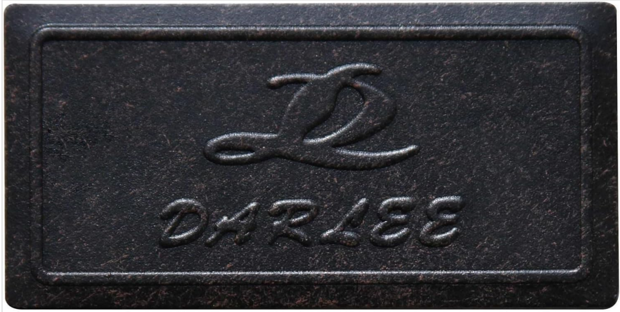
Image: Close-up of the Darlee brand logo embossed on a metal plate, showcasing the quality and branding of the product.