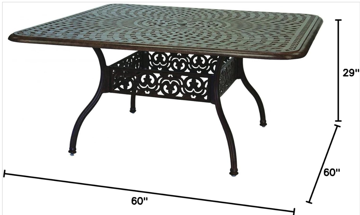
Image: Darlee Series 60 Patio Dining Table showing overall dimensions (60" W x 60" D x 29" H). This image illustrates the assembled table with its width, depth, and height measurements.