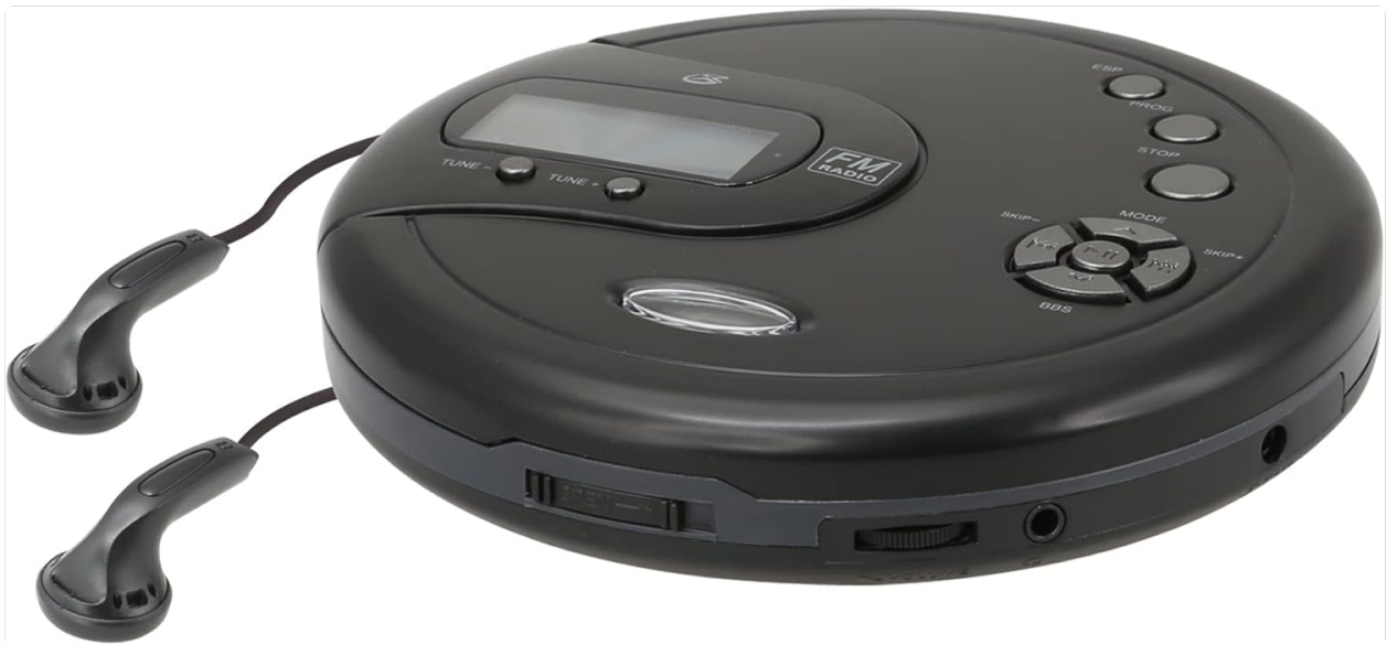
Figure 3.2: A compact disc correctly placed within the player's compartment.