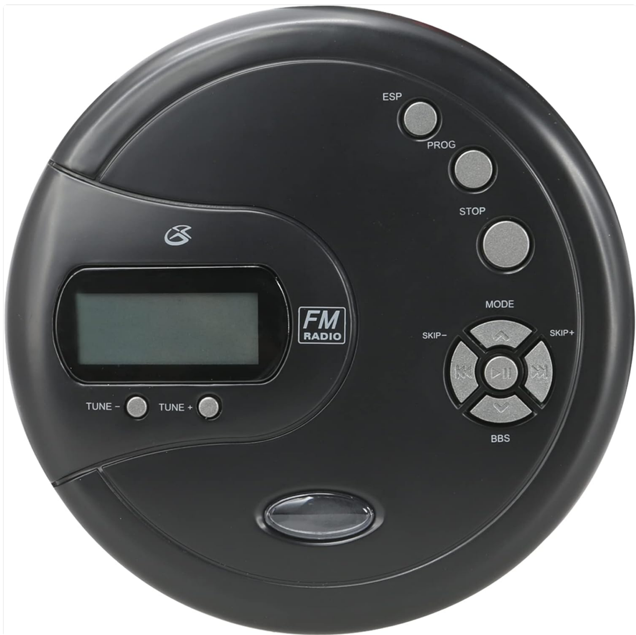
Figure 1.1: Top view of the GPX PC332B Portable CD Player, highlighting its compact design and accessible controls.