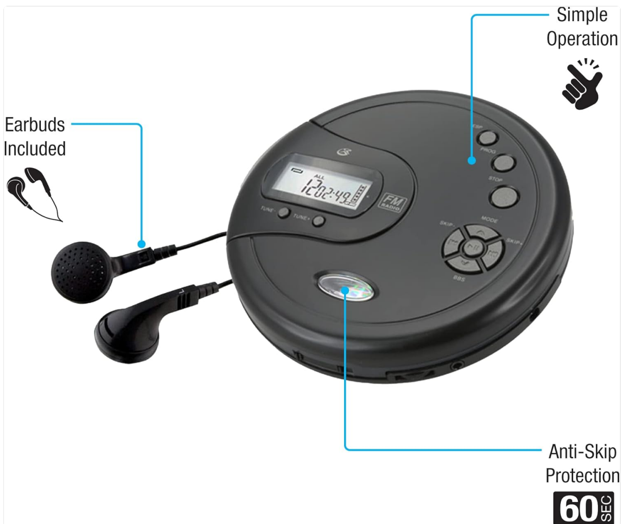
Figure 1.2: The portable CD player with connected stereo earbuds, demonstrating its simple operation and 60-second anti-skip protection.

Video 1.1: A product summary video showcasing the GPX PC332B Portable CD Player's features and design.