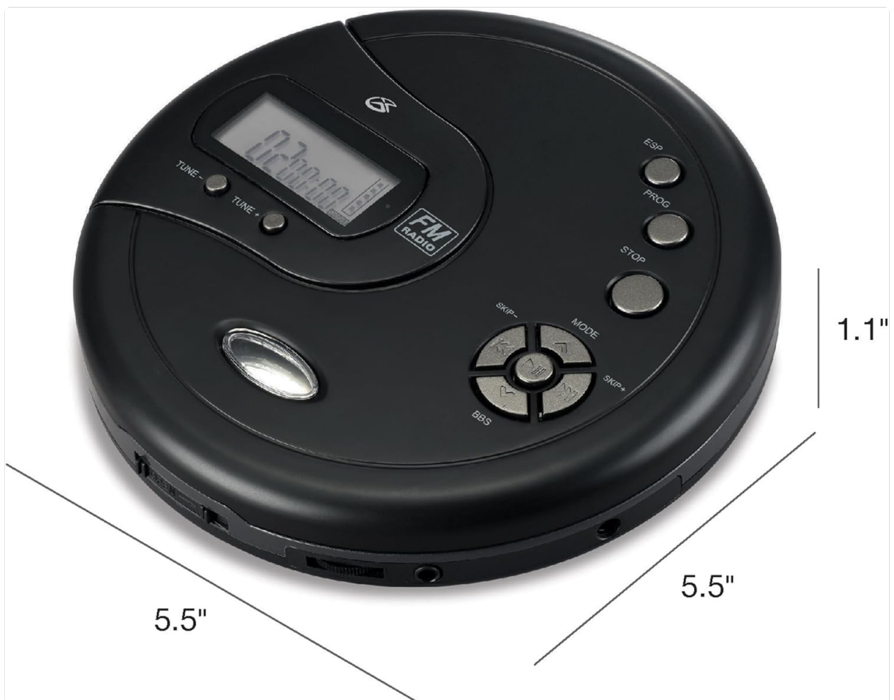
Figure 6.1: Dimensions of the GPX PC332B Portable CD Player.