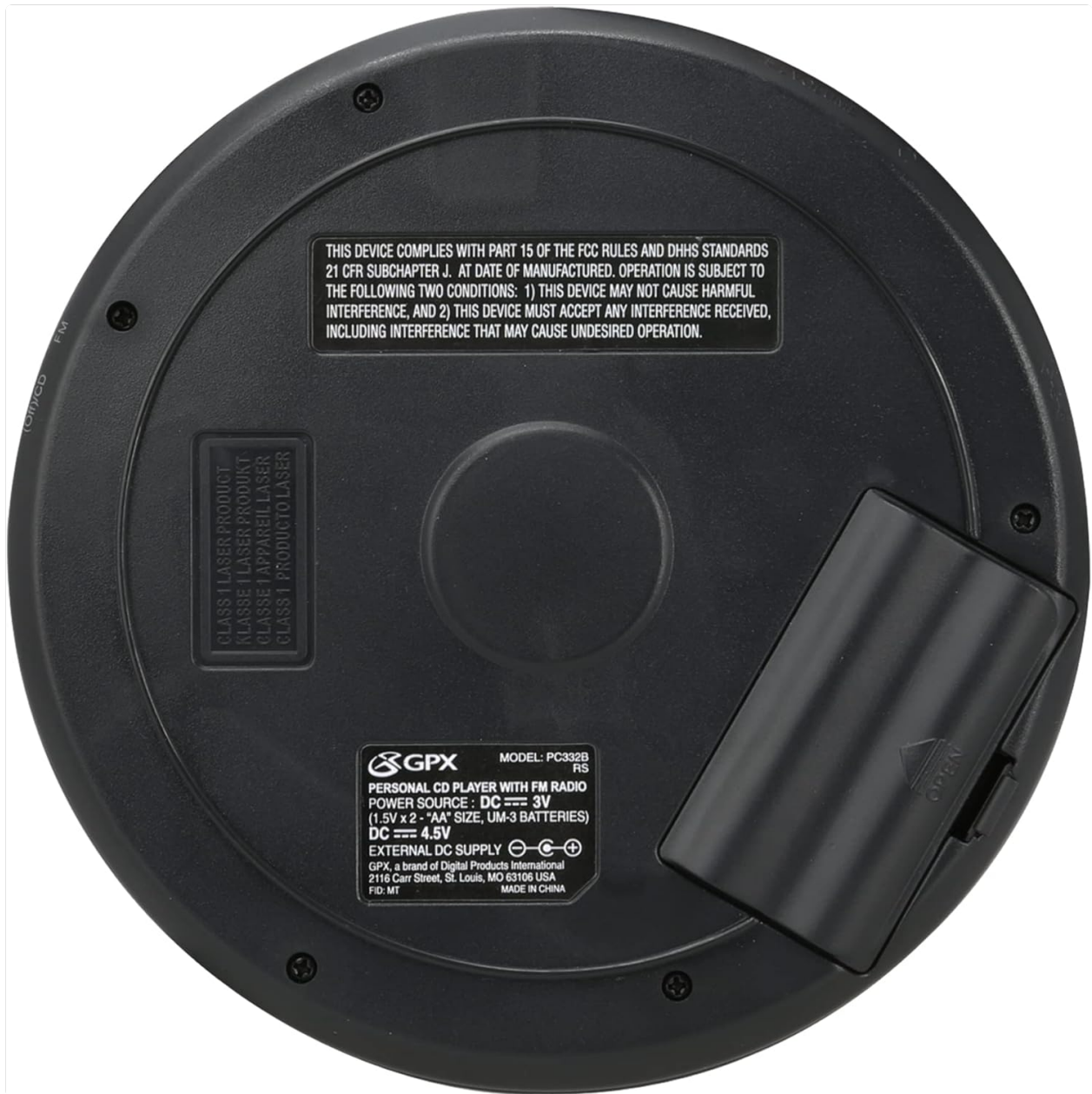
Figure 2.1: Bottom view of the unit, illustrating the battery compartment for AA battery installation.