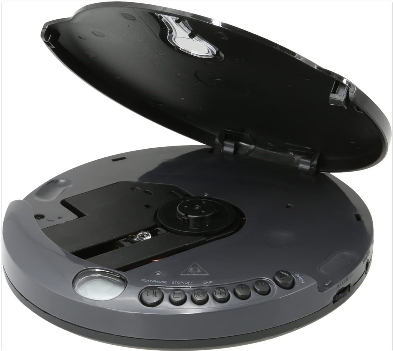
Figure 3.1: The CD player with its lid open, ready for disc insertion.