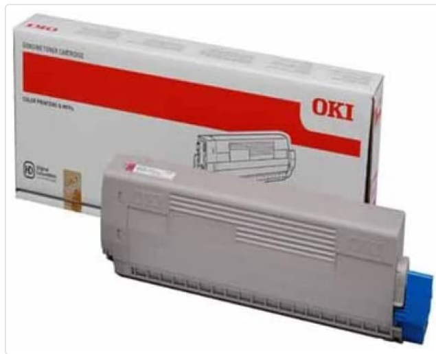
Image 1: OKI C822 Magenta Toner Cartridge. This image displays the OKI C822 Magenta Toner Cartridge alongside its retail packaging. The cartridge is gray with a blue end cap, and the box is white with a prominent red band and the 'OKI' logo.