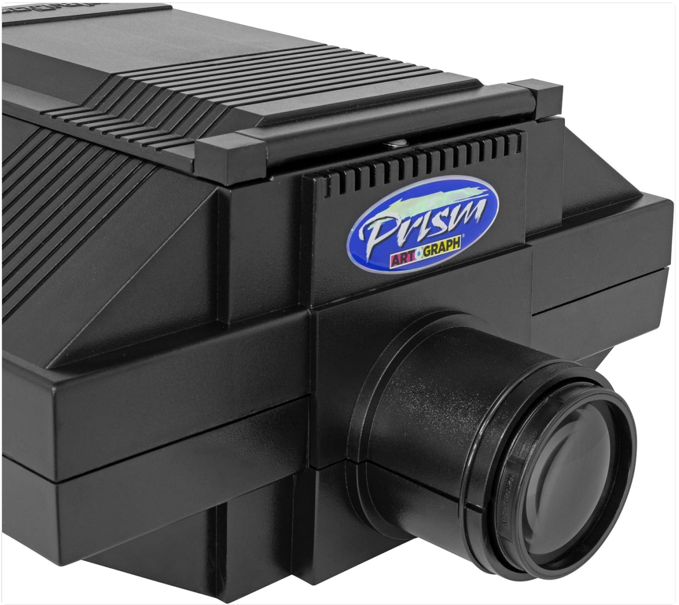
Image: Close-up view of the projector's lens, highlighting its design.