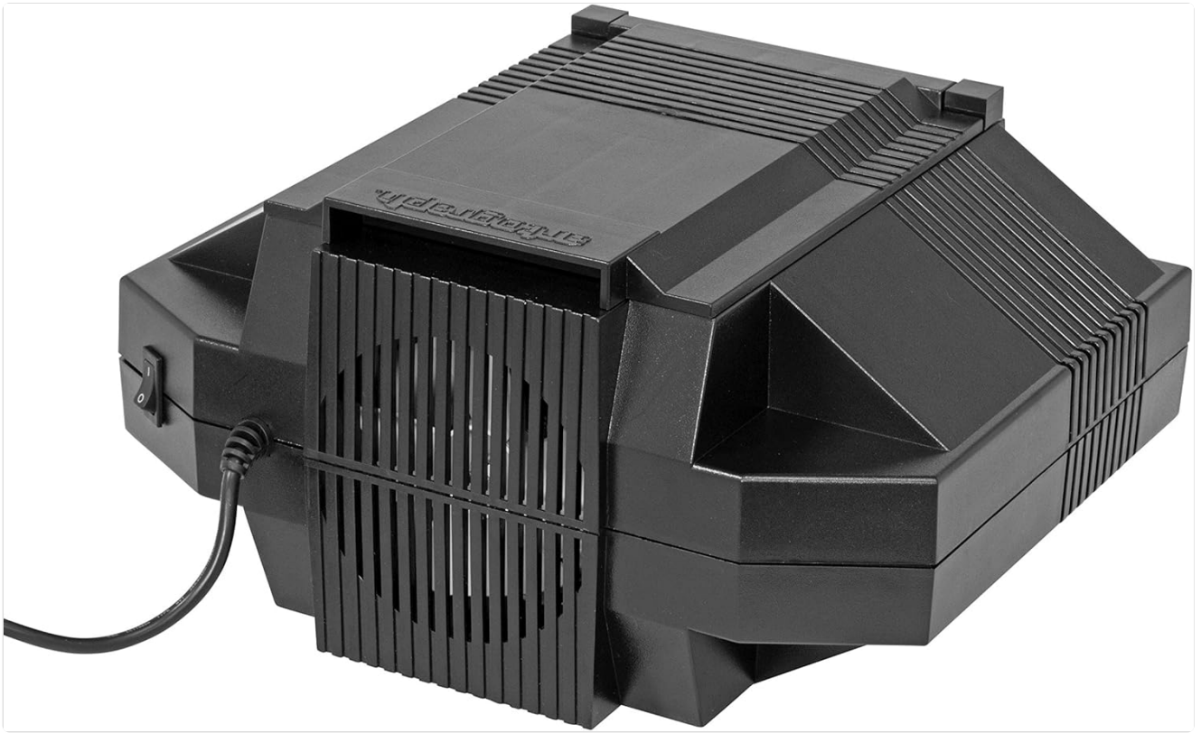
Image: Rear view of the projector, showing the power cord connection point and cooling fan.