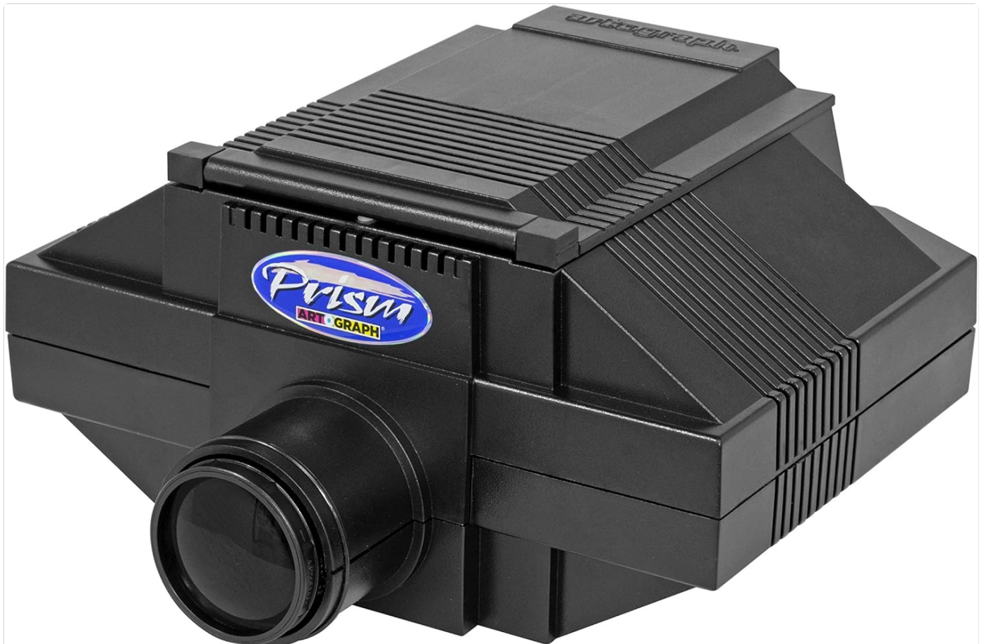
Image: Front view of the Artograph Prism Art Projector, showcasing its compact design and lens.

The Artograph Prism Art Projector is a high-quality, single lens, tabletop opaque projector designed for convenient projection of various art forms, including artwork, designs, patterns, prints, and line drawings, onto a vertical surface. Its reversible lens allows for a wide projection range, from 80% reduction up to 20 times enlargement, providing full-color reproduction. The projector features 500-Watts of photo-quality lighting (two 250-Watt bulbs) for a bright and clear image. The 7" x 7" (178 x 178 mm) top-loading area simplifies the placement of your original material. Magnetic door latches and a spring clip ensure your original stays flat and secure during projection. For optimal performance and to prevent overheating, the unit is fan-cooled and includes thermal overload circuit protection. A darkened room is required for maximum visibility and projection clarity.