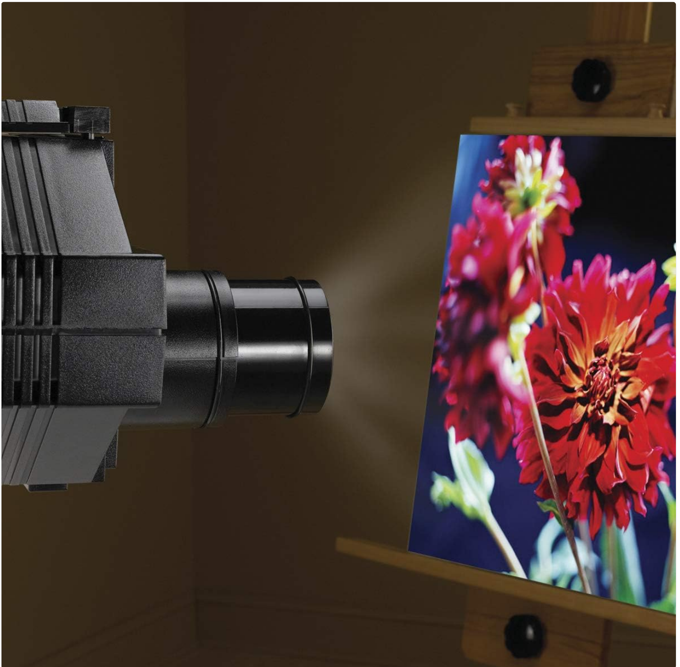
Image: The top-loading area of the projector shown open, ready for placing original artwork.