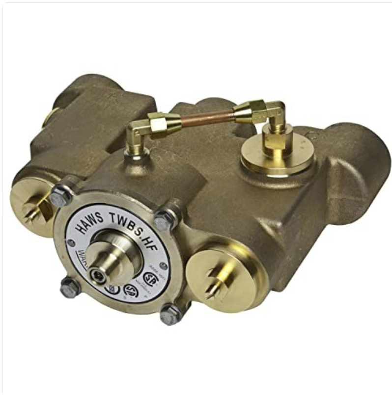
Figure 2: Side view of the Haws TWBS.HF Thermostatic Mixing Emergency Valve, highlighting the inlet and outlet connections.