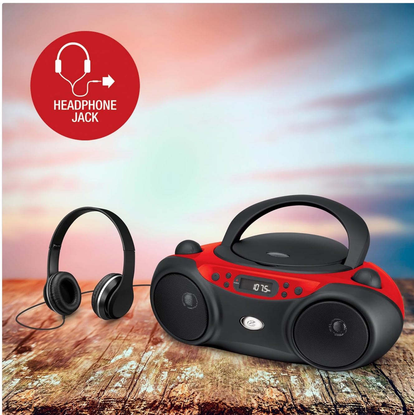
Figure 5.3: The boombox shown with headphones, indicating the presence and use of the headphone jack for private listening.