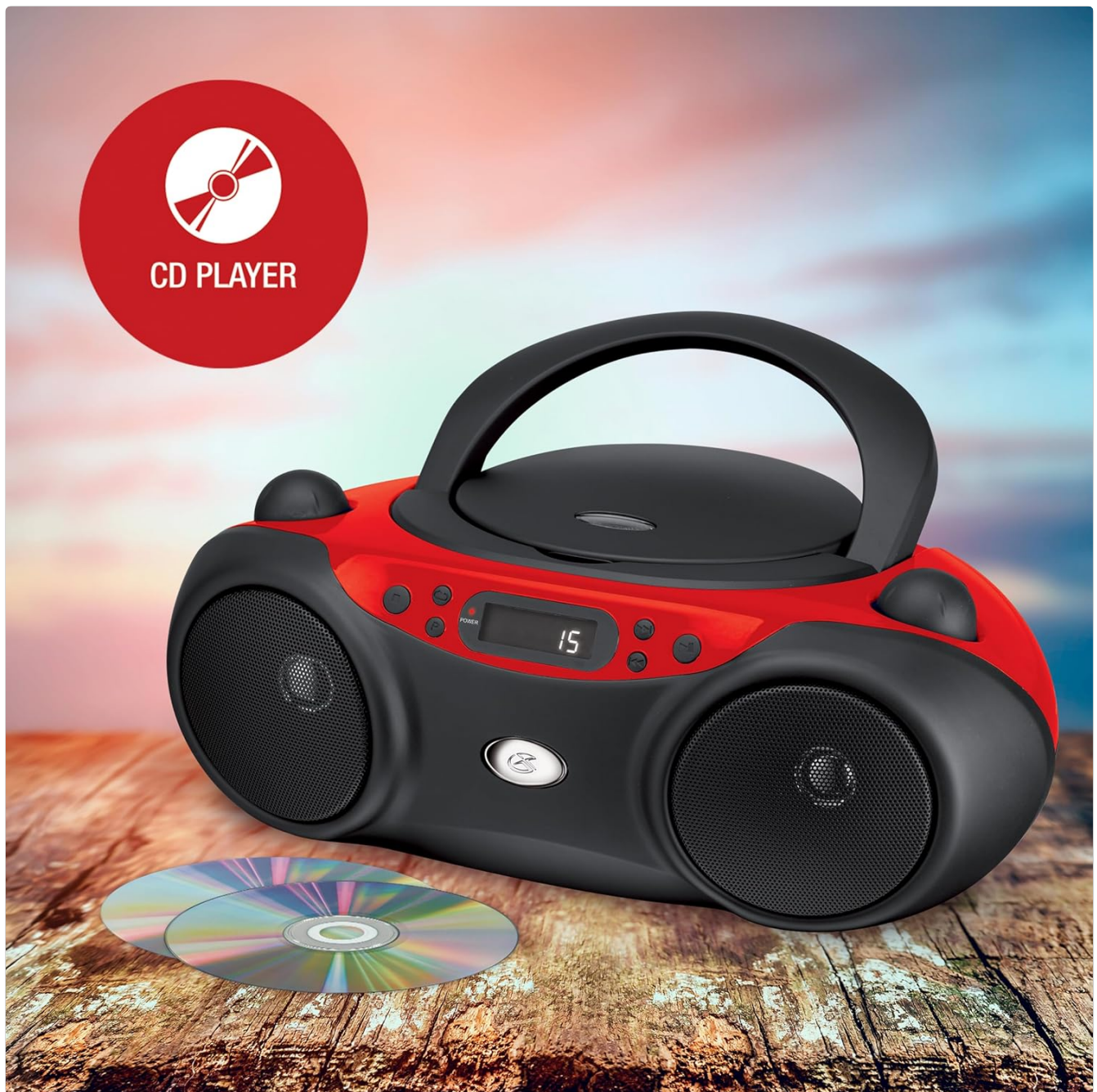
Figure 5.1: The boombox positioned next to a compact disc, illustrating its primary function as a CD player.