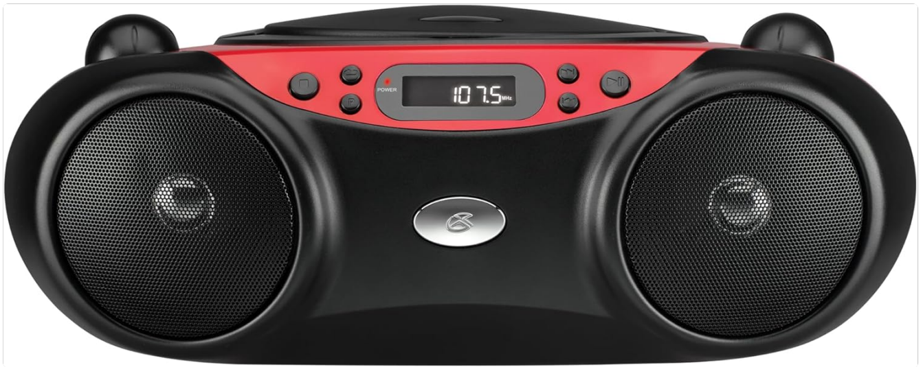
Figure 3.1: Front view of the GPX BC232R Portable CD Boombox, showing the speakers, control buttons, and digital display.