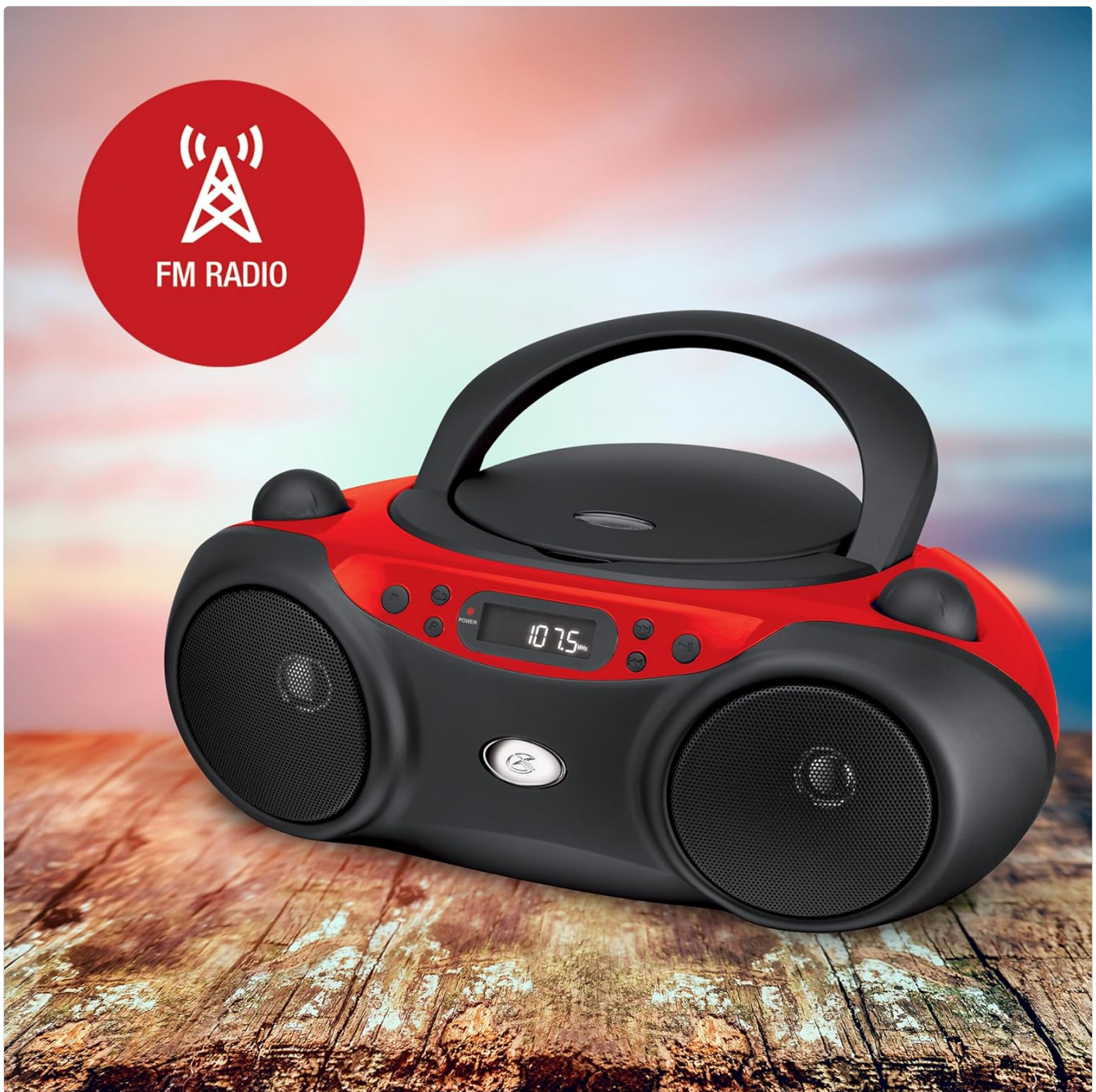
Figure 5.2: The boombox highlighting its FM radio capability, with the digital display showing a radio frequency.