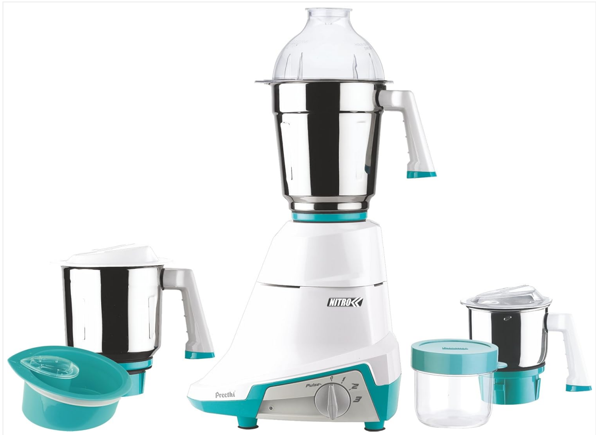
Image: The Preethi Nitro MG 173 Mixer Grinder, showcasing the main motor unit and the three stainless steel jars with their respective lids.