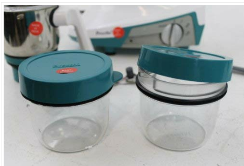
Image: A closer view of the smaller 0.5 Litre chutney jar and the 1.0 Litre middle jar, both with turquoise lids, ready for use.