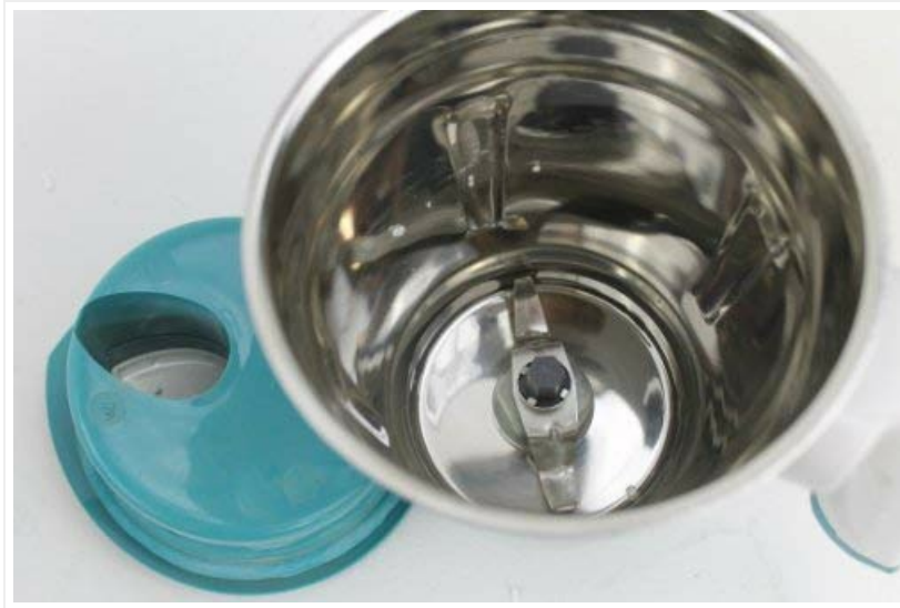
Image: An internal view of one of the stainless steel jars, showing the machine-ground and polished blades designed for optimal grinding efficiency.