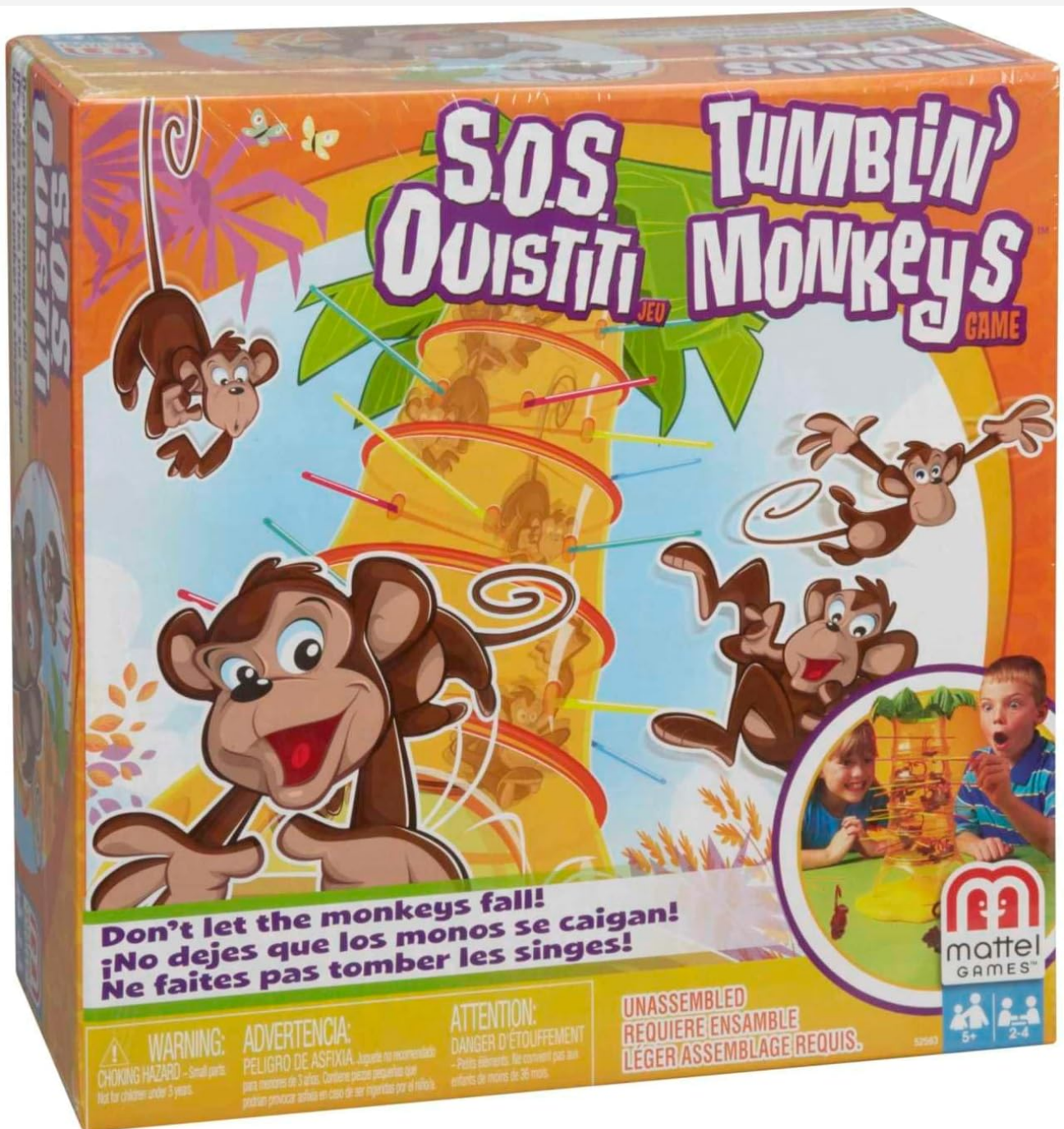
Figure 1: The Mattel Tumblin' Monkeys Game box, showing the game's title and playful monkey illustrations.