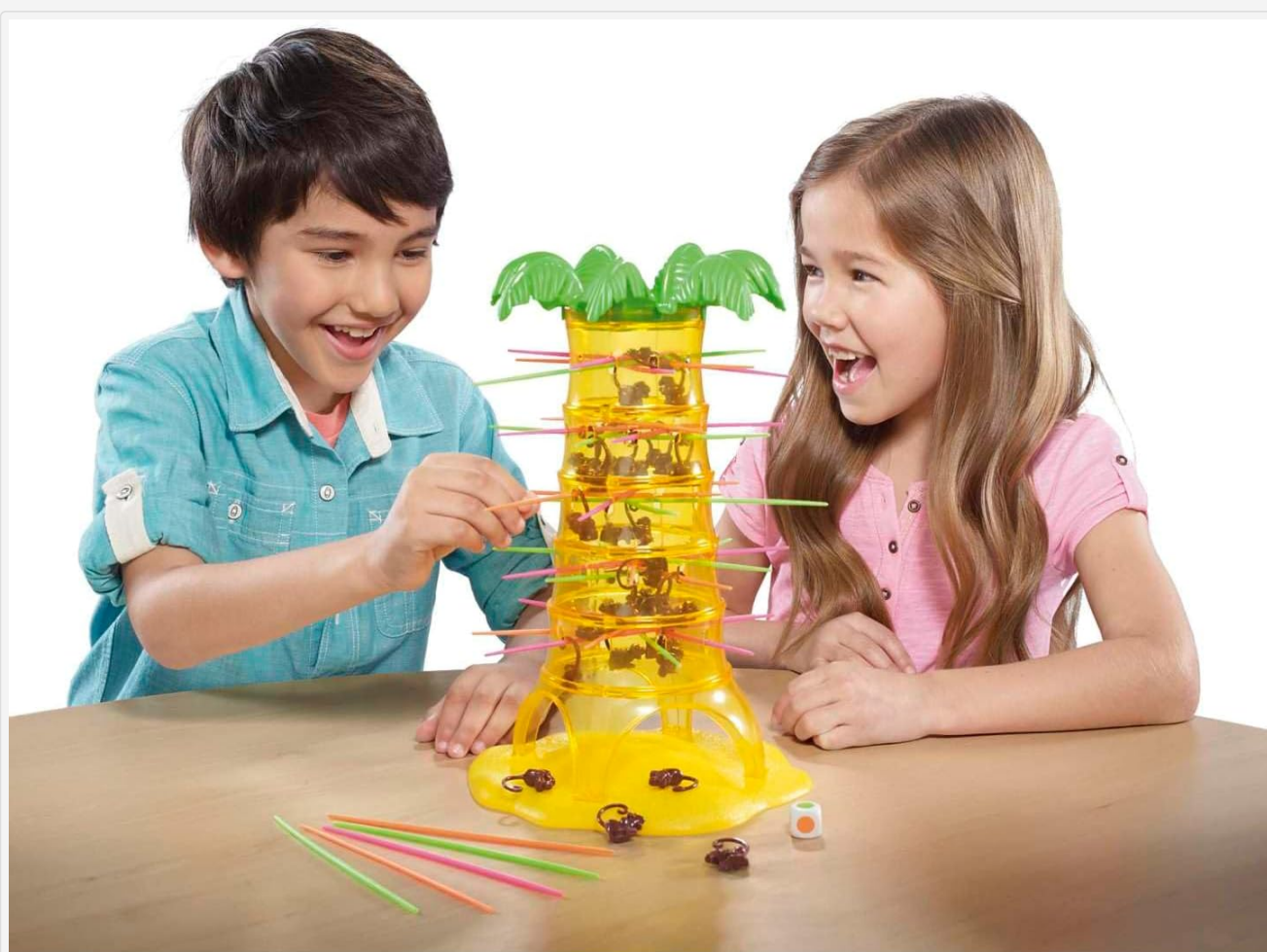
Figure 3: Two children engaged in playing the Tumblin' Monkeys game, carefully removing sticks from the tree.

Once all monkeys have fallen, each player counts the number of monkeys they collected. The player with the fewest monkeys wins the game.