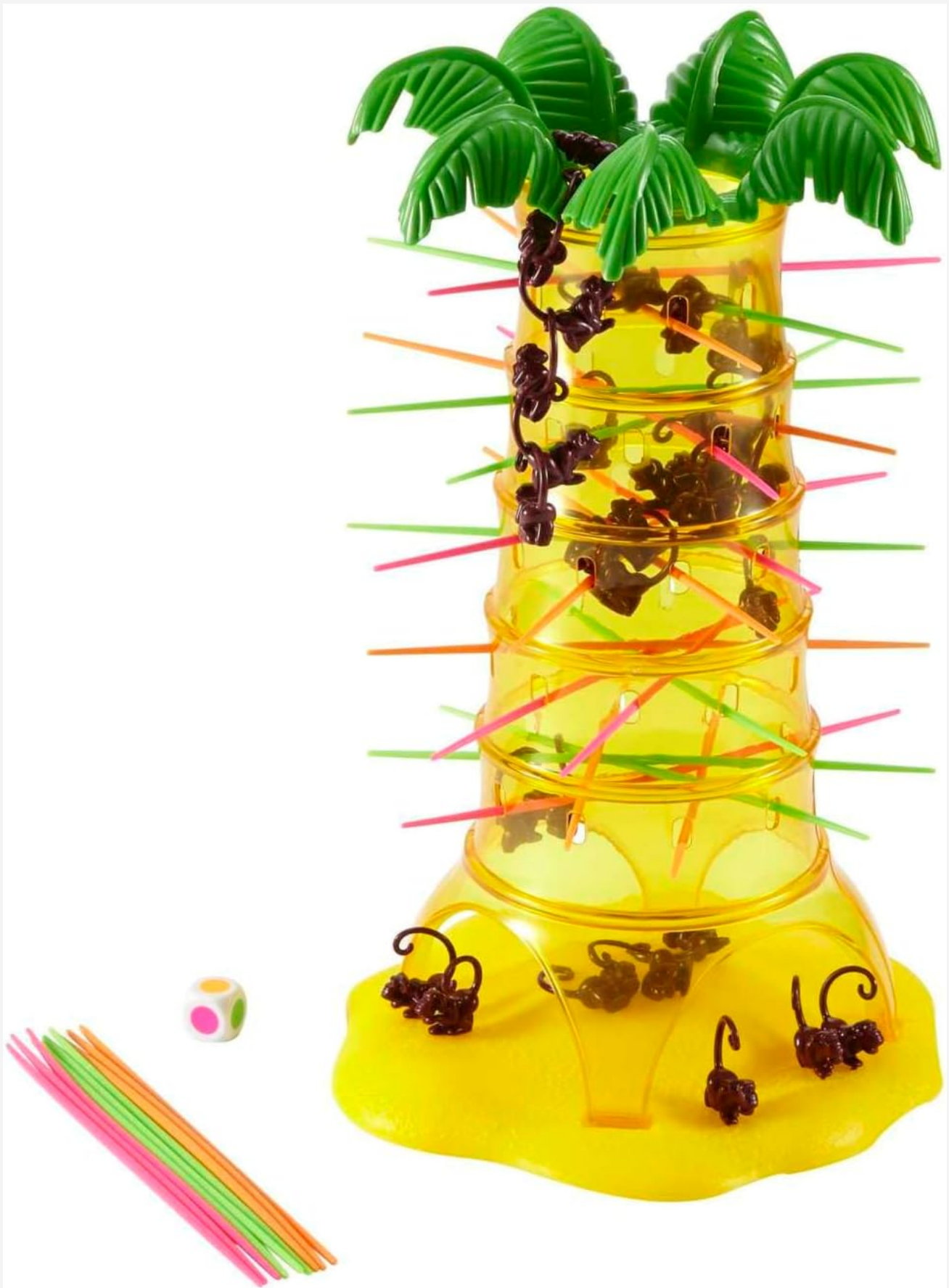
Figure 2: The Tumblin' Monkeys game fully assembled, with monkeys hanging from the colored sticks within the clear tree trunk.