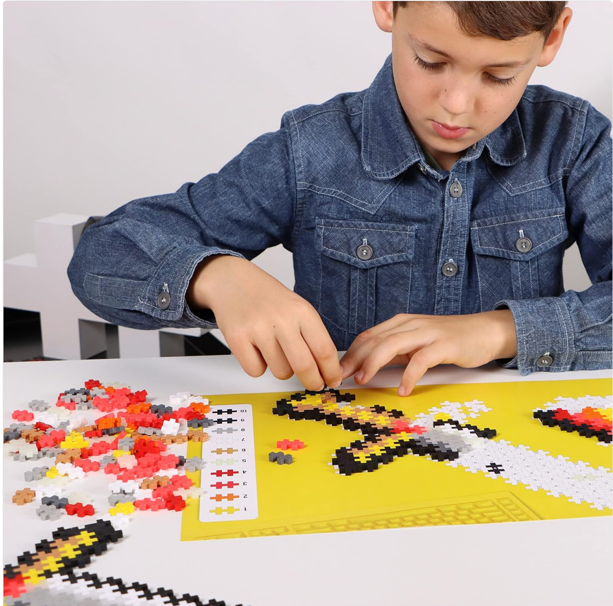
Image 4.1: An overhead view of a child actively assembling PLUS PLUS pieces on the puzzle mat, following the numbered pattern.