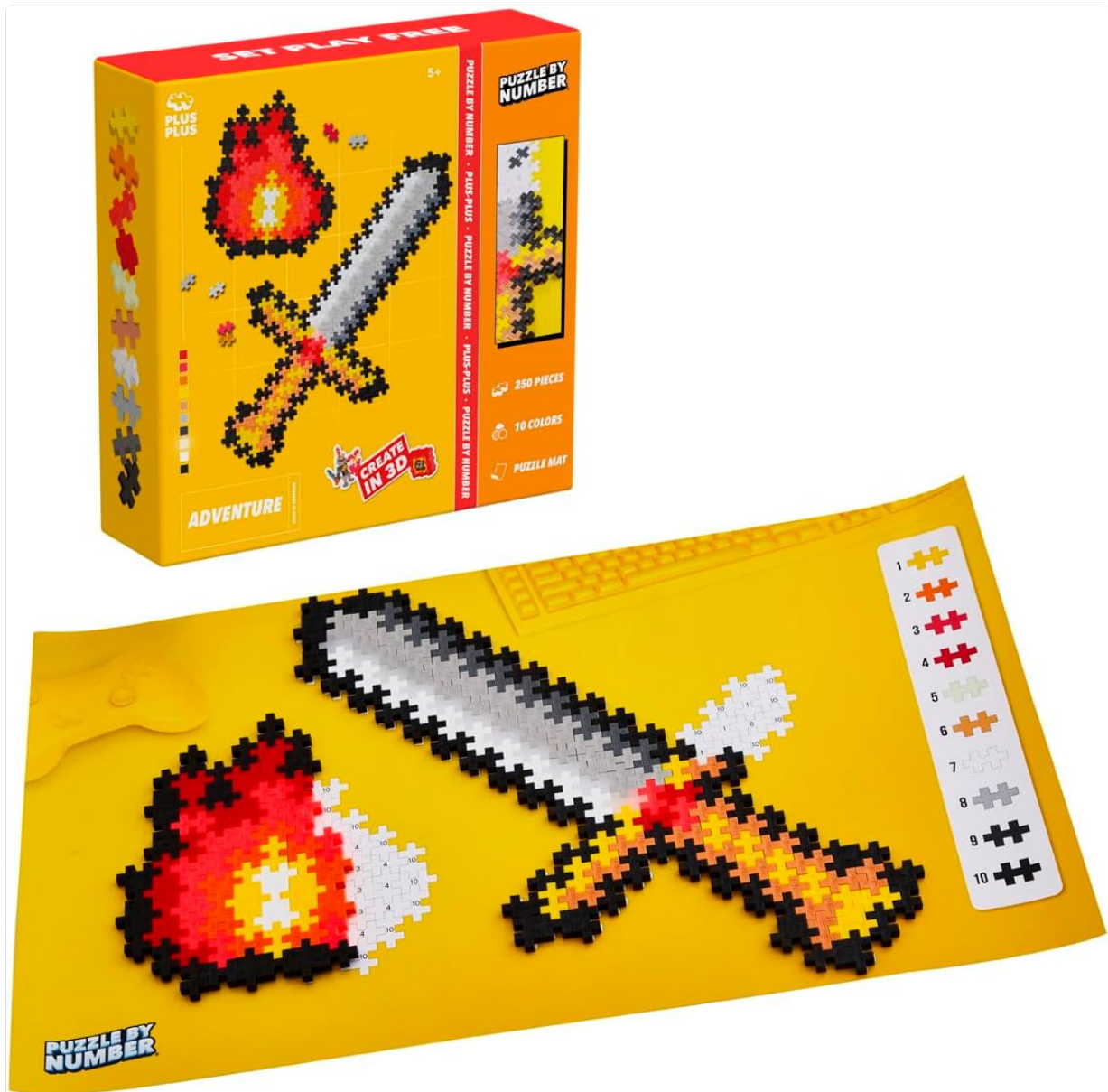
Image 3.1: The PLUS PLUS Mini Adventure Construction Set, showing the box, the puzzle mat, and loose construction pieces ready for assembly.