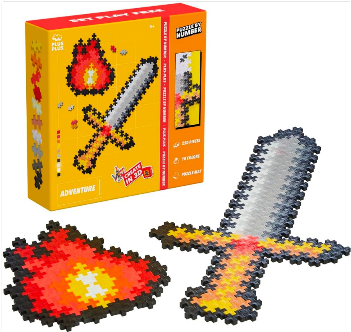
Image 1.1: The PLUS PLUS Mini Adventure Construction Set, showing the product packaging and the completed sword and fire models.