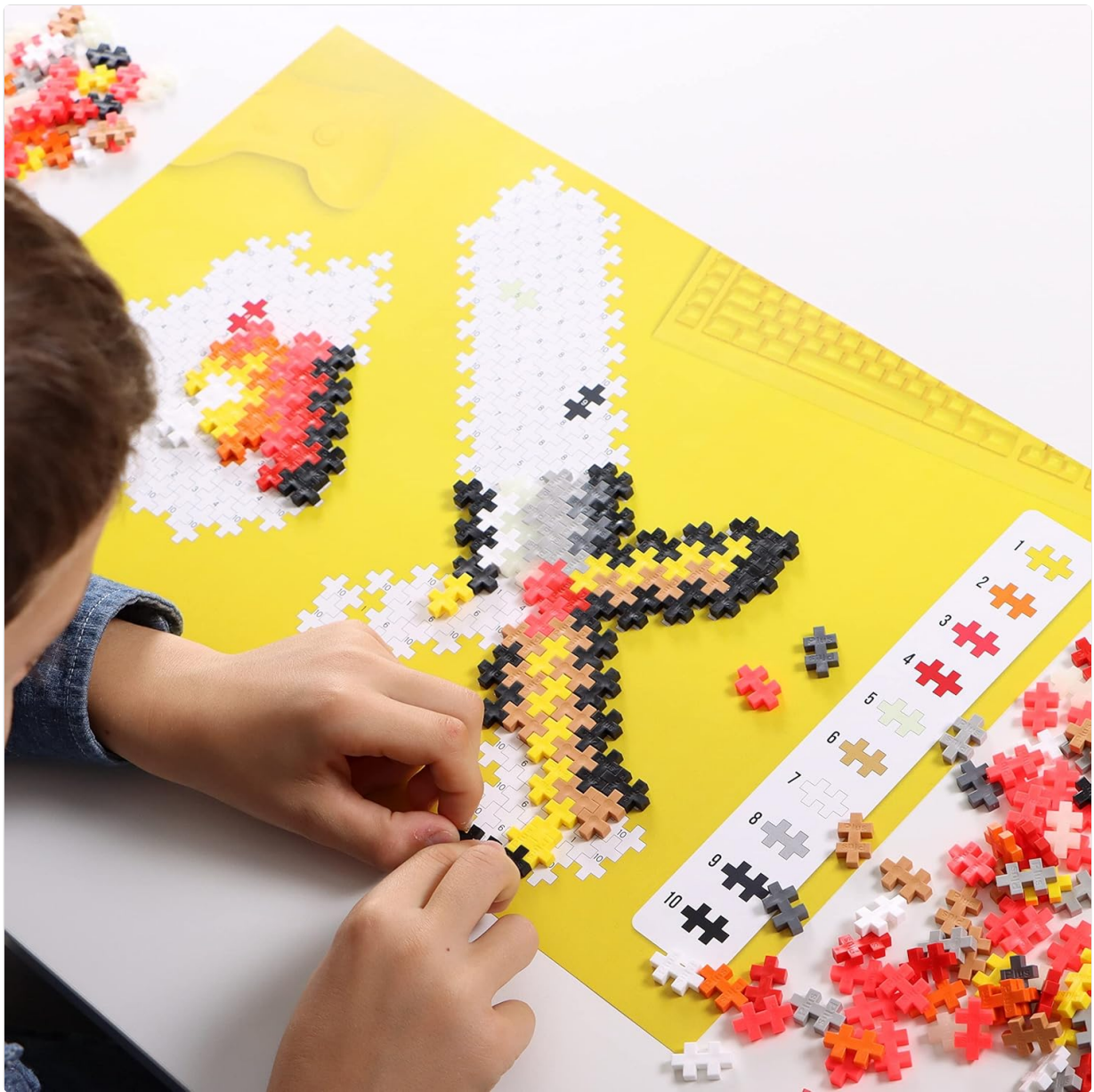
Image 4.2: A side view of a child engaged in assembling the PLUS PLUS construction set on the provided puzzle mat.