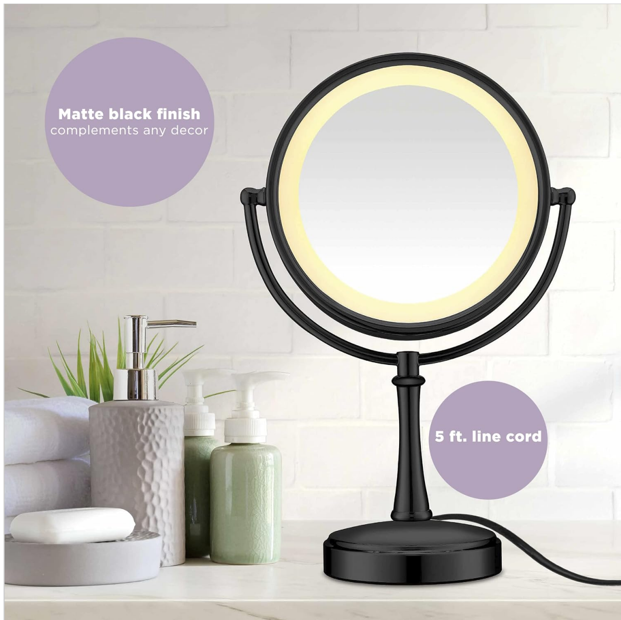
Image: The Conair Reflections mirror in matte black, illustrating the 5-foot power cord connected to an electrical outlet. This image also highlights the mirror's aesthetic design suitable for various decors.