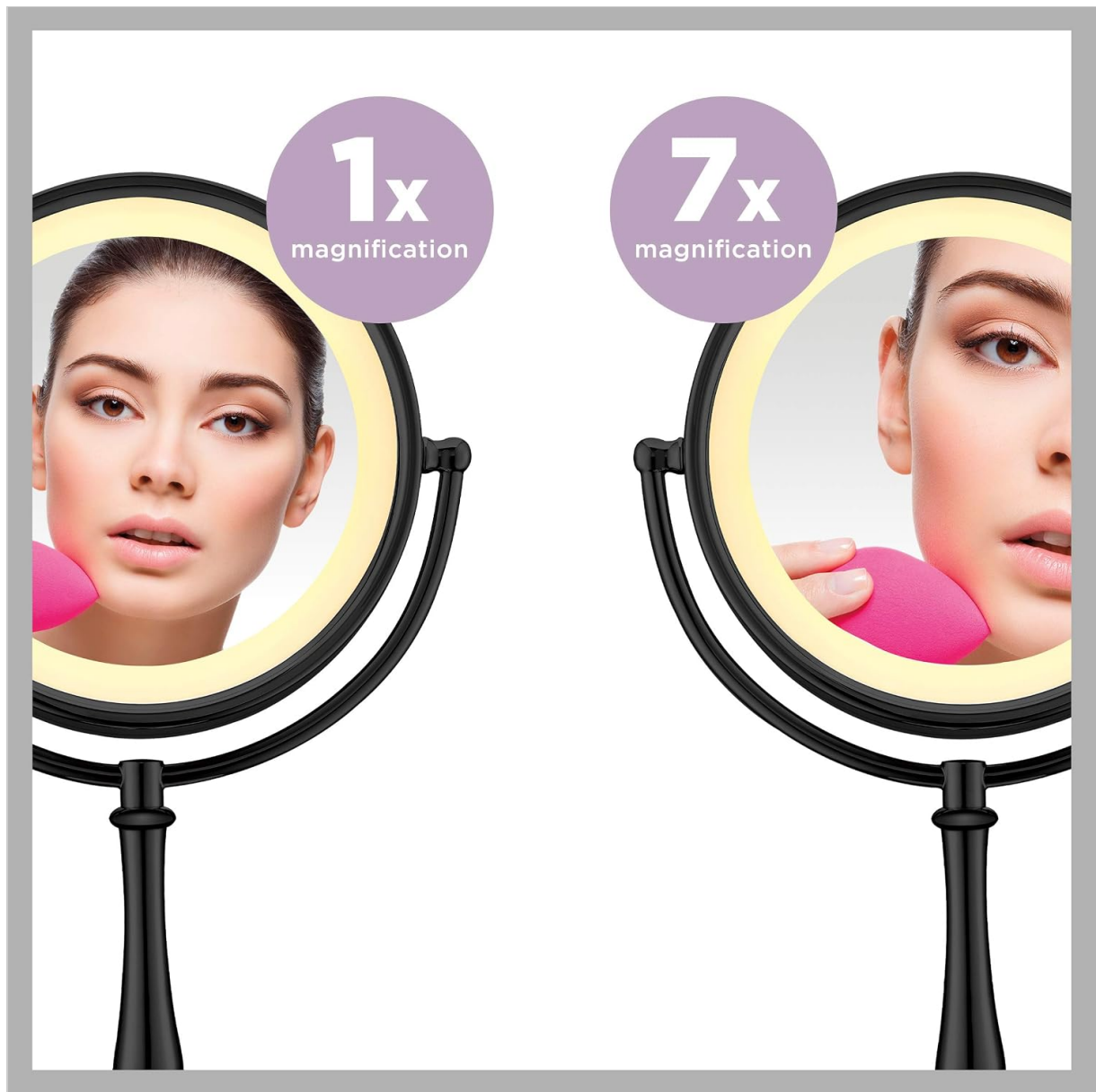
Image: This illustration compares the 1x and 7x magnification sides of the mirror, demonstrating the clarity and detail provided by the 7x magnification for precise grooming.