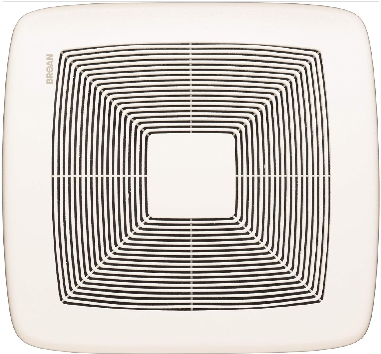
Image 5.1: Close-up view of the fan grille, which should be periodically cleaned.