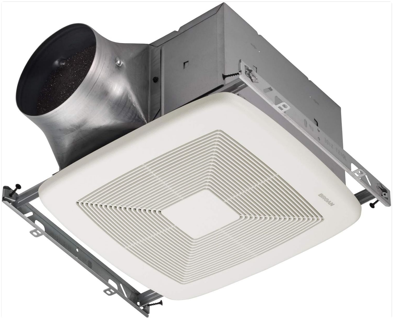
Image 1.1: Broan-NuTone XB80 Exhaust Fan showing the main unit, duct, and grille.