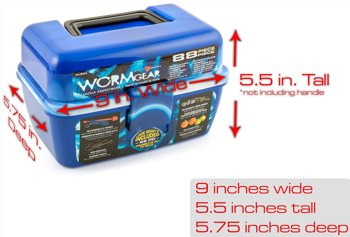
Figure 6: A diagram illustrating the approximate external dimensions of the tackle box (e.g., 9 inches wide, 5.5 inches tall, 5.75 inches deep). Note that formal product dimensions are listed above.