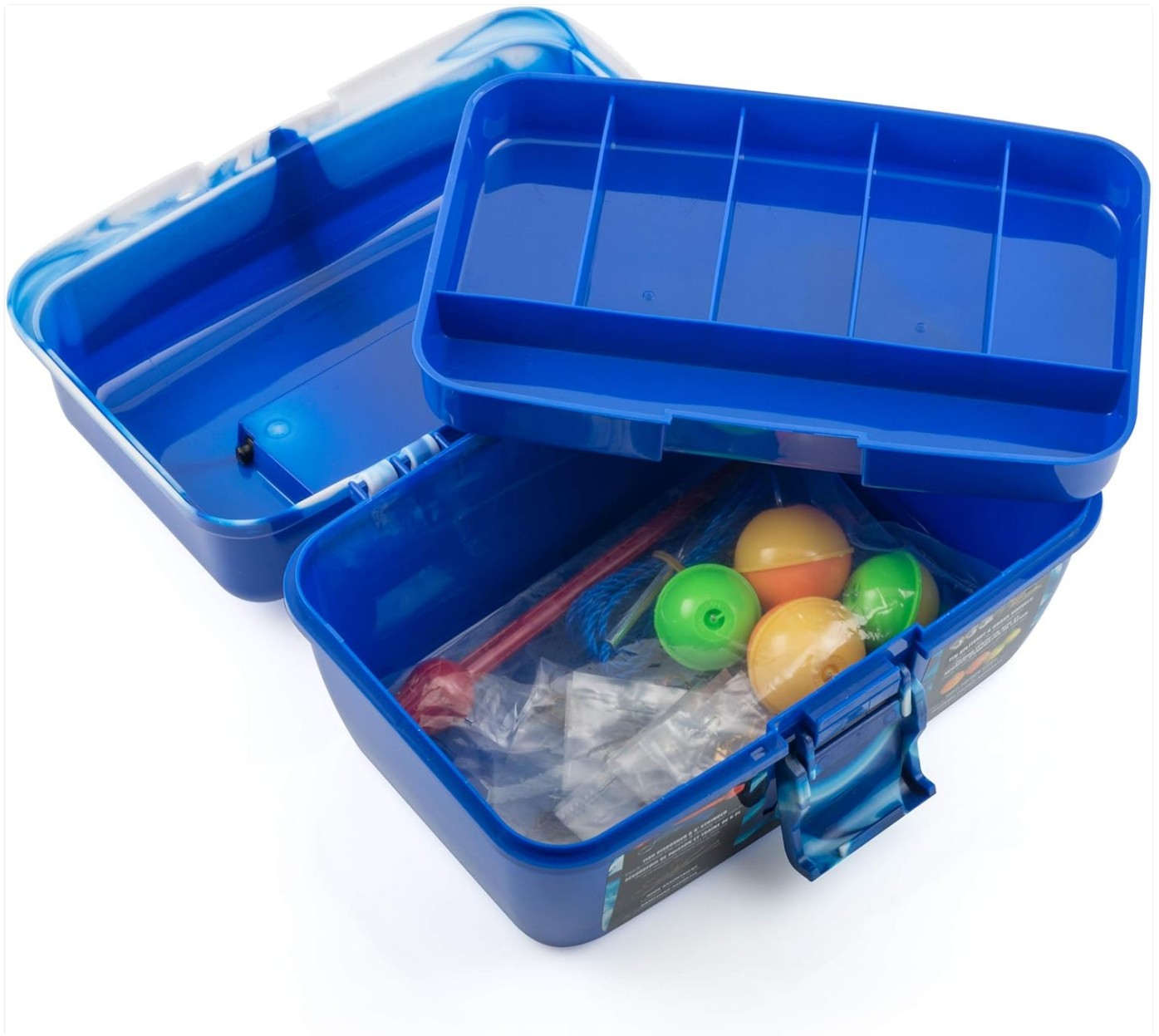
Figure 4: The tackle box with its single tray removed, illustrating the two main sections for organizing fishing gear.