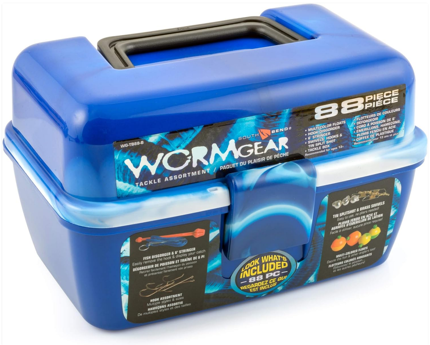
Figure 1: The SOUTH BEND WG-TB88-B Wormgear 88-Piece Loaded Tackle Box in its closed state, showcasing its compact blue design.