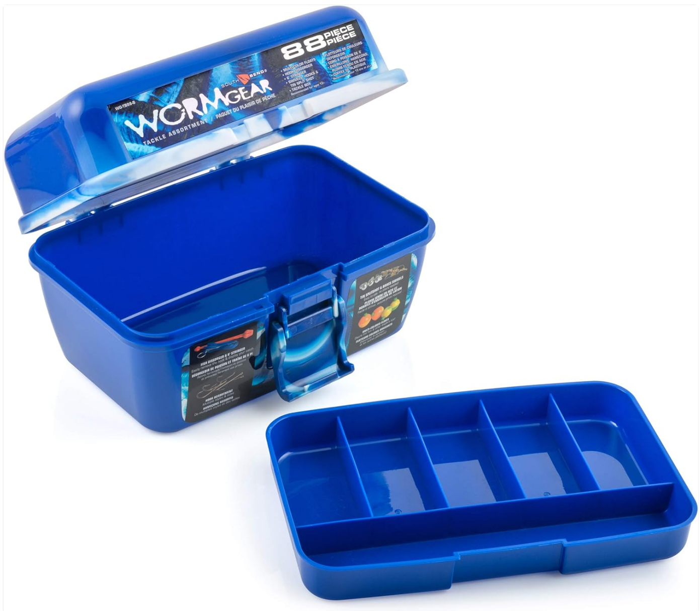
Figure 5: The tackle box with the tray fully removed, showing the empty main storage area and the separate tray.