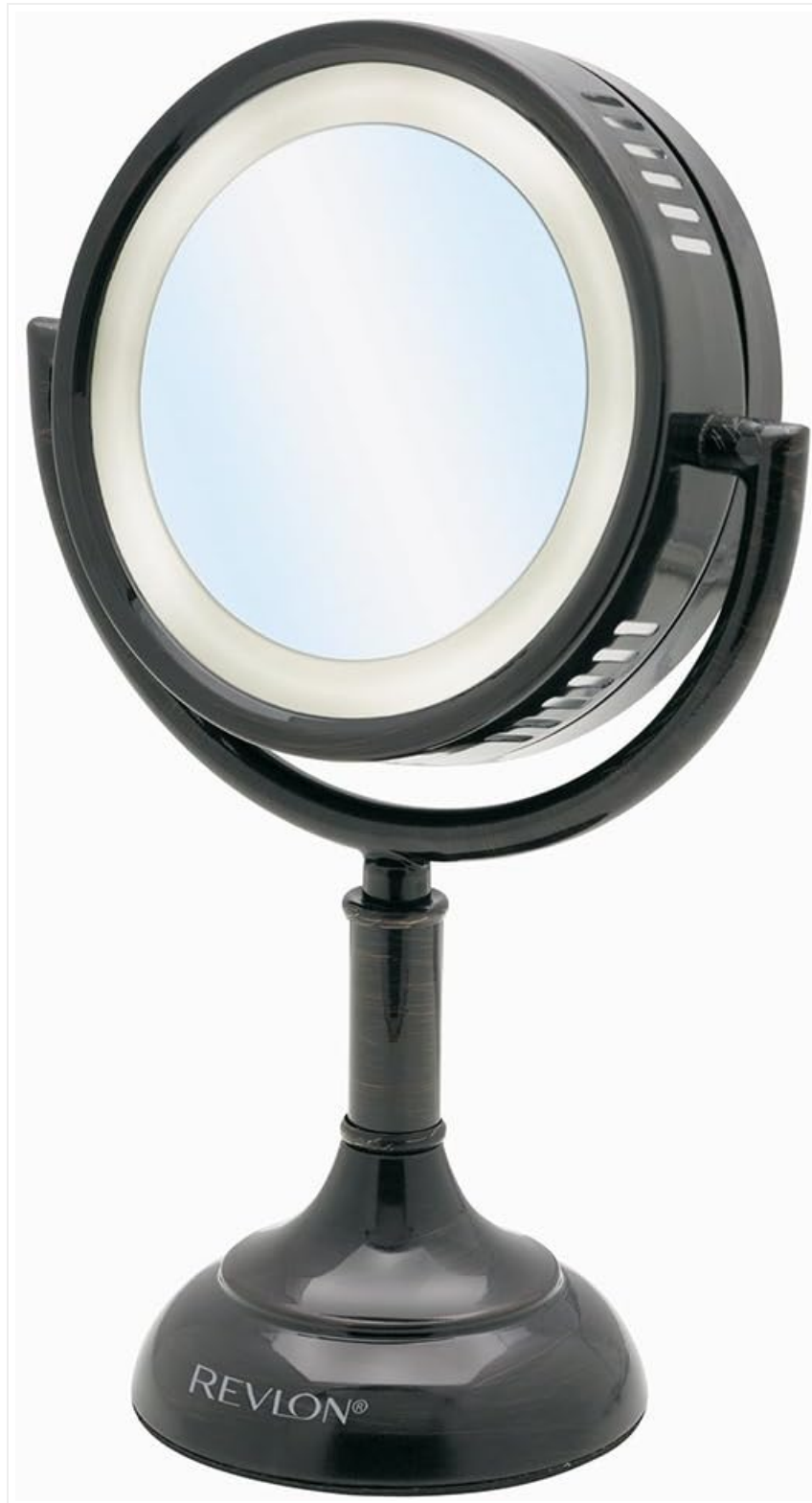
Image: Front view of the Revlon Lighted Swivel Bathroom Mirror, showcasing its black finish and illuminated rim.