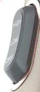
Image: A close-up view of the Conair hair dryer's control panel, highlighting the Cool Shot button, the 3 Heat/2 Speed settings switch, and the power switch. This illustrates the user interface for adjusting airflow and temperature.