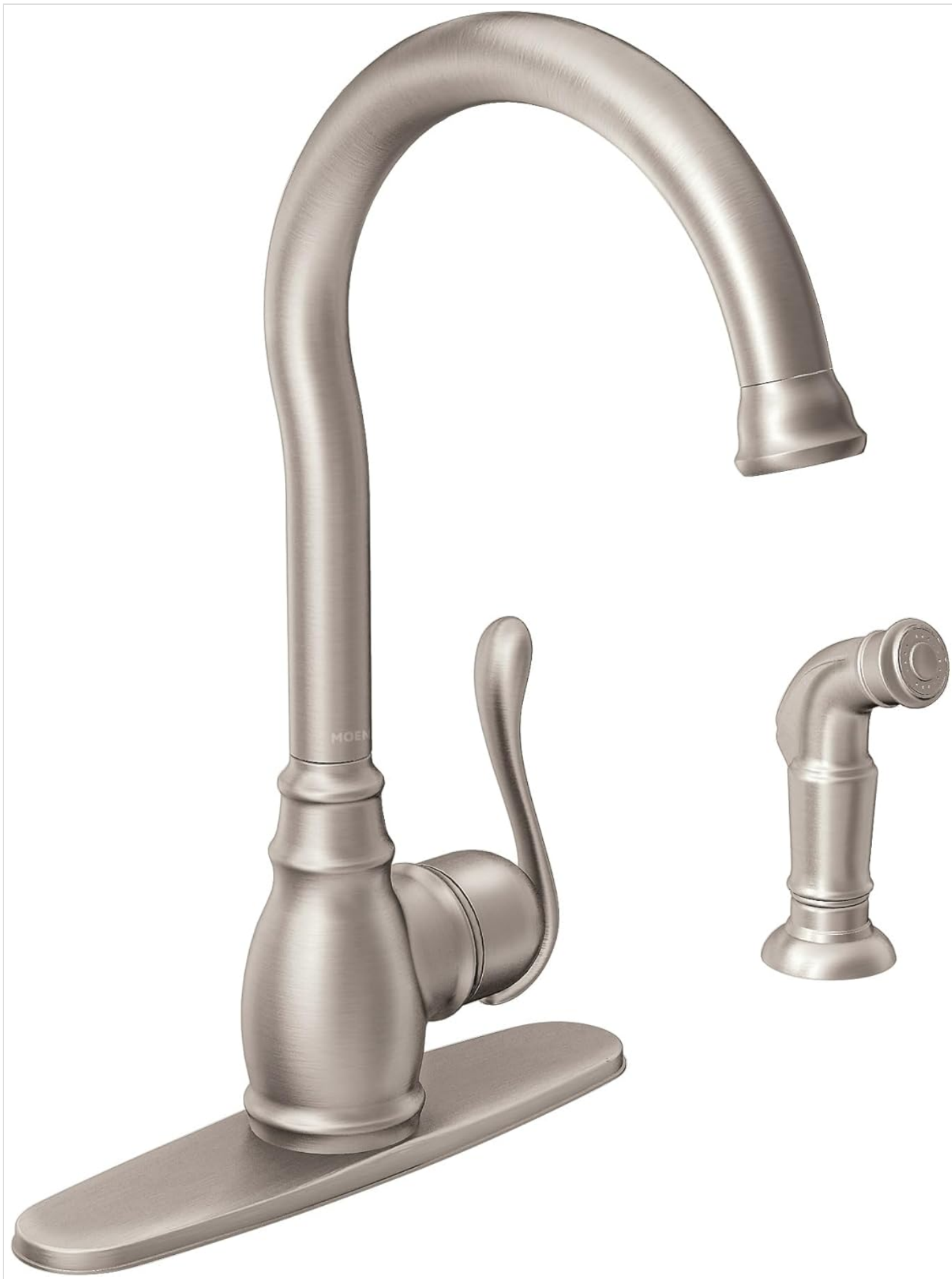
Figure 2: Moen Anabelle Kitchen Faucet with Side Spray.