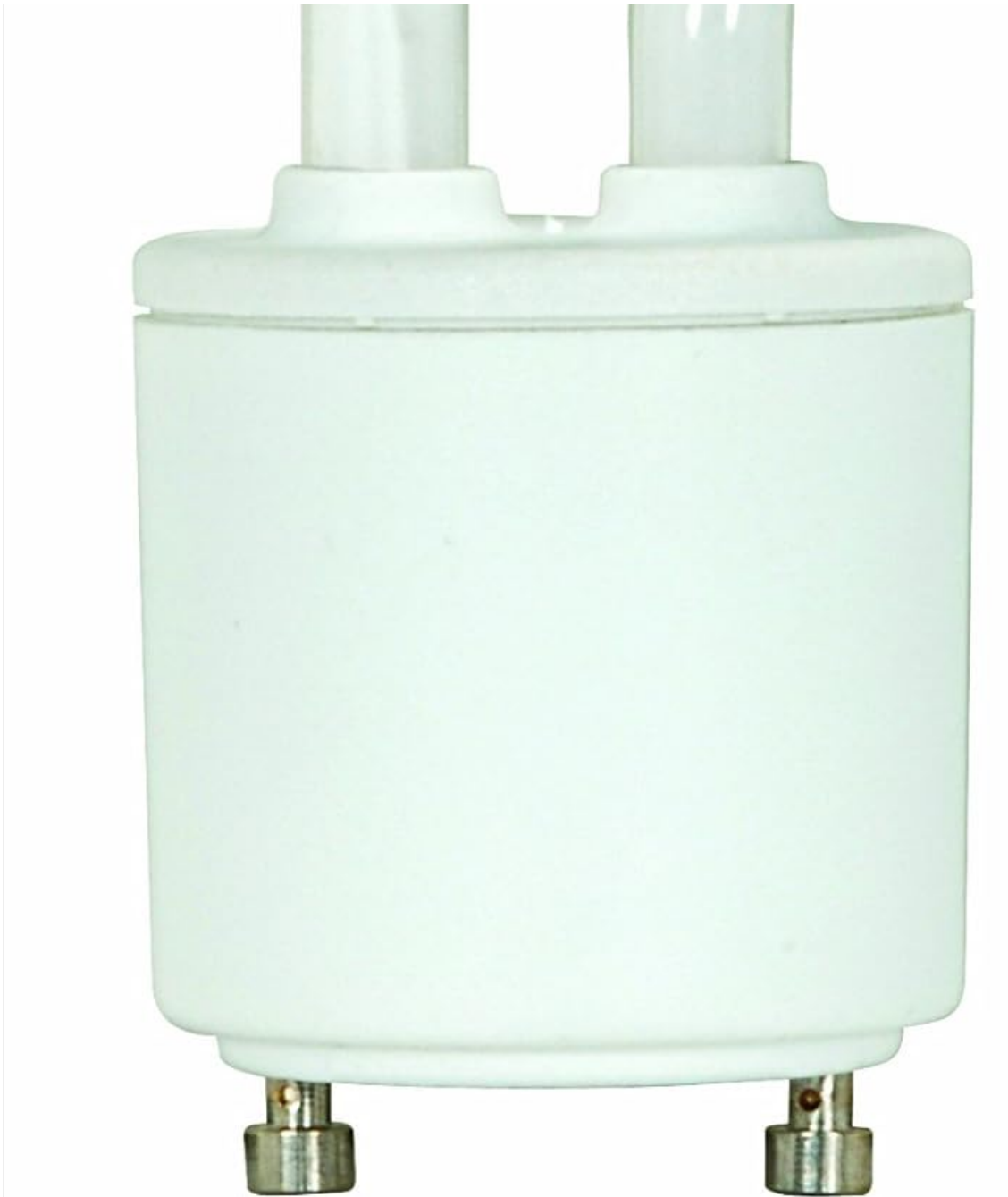
Image: The Satco S8226 Mini Spiral CFL light bulb, featuring its distinctive spiral shape and GU24 base.