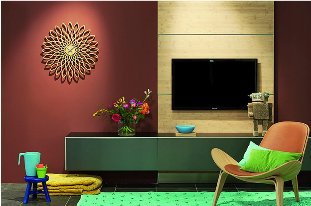
Image 1.2: The Karlsson Sunflower Wall Clock displayed in a home environment.