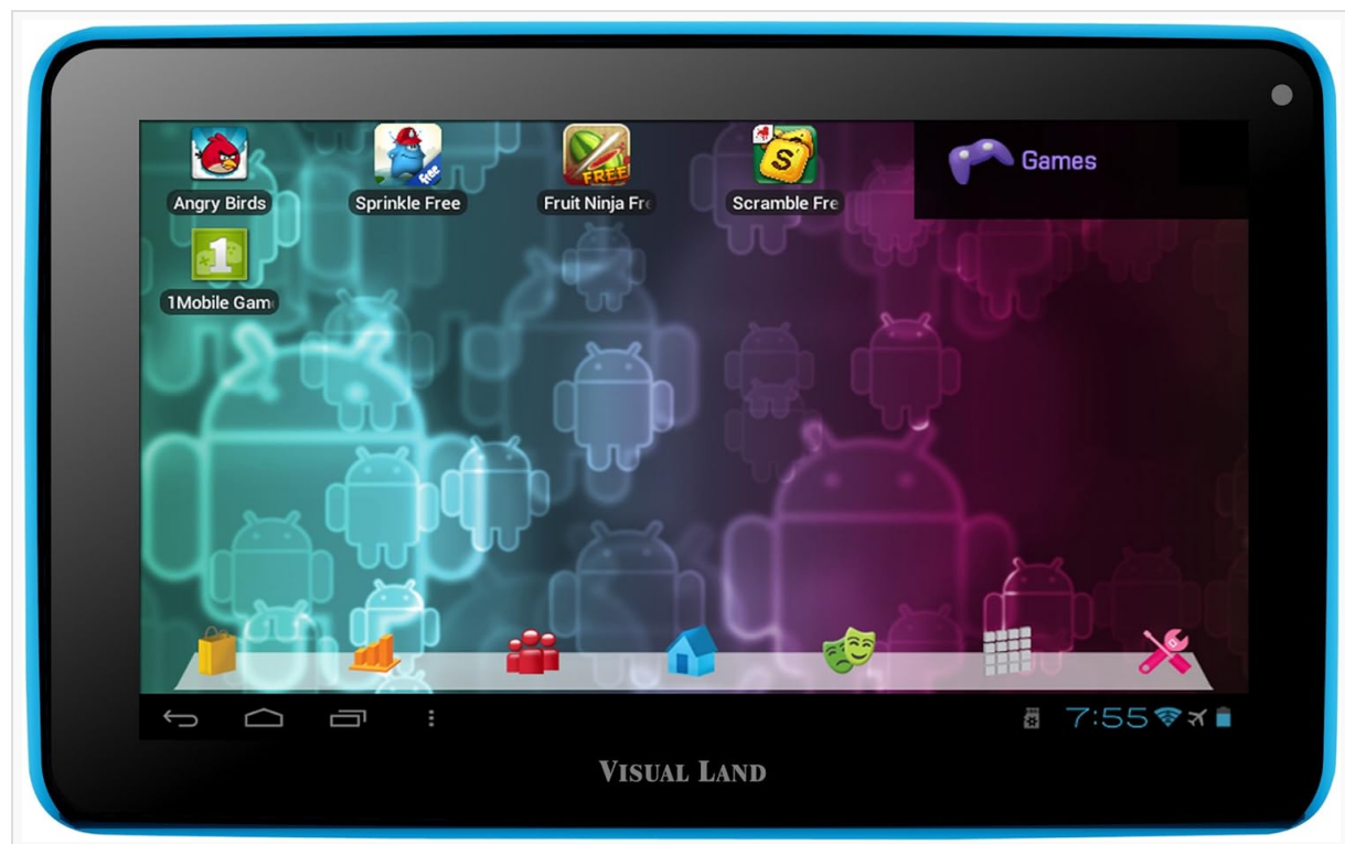
Image: Front view of the Prestige 7 tablet, showing the main home screen with various application icons.

The Prestige 7 features a 7-inch capacitive 5-point multi-touch screen. Use gestures such as tap, swipe, pinch-to-zoom, and long-press to interact with the tablet.