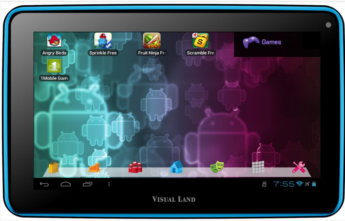
Image: The tablet screen displaying a selection of pre-installed and downloaded application icons.