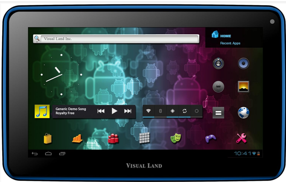
Image: The tablet screen displaying a media player interface, including playback controls and a search bar.