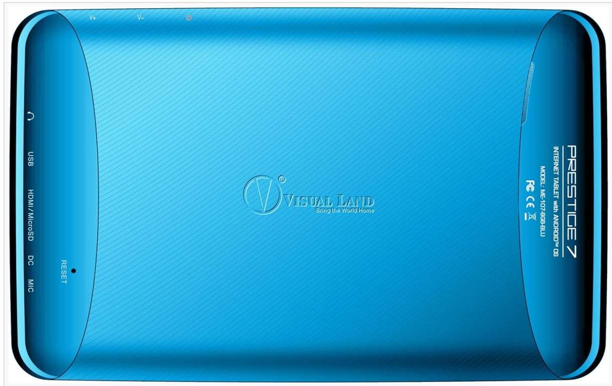
Image: Rear view of the Prestige 7 tablet, clearly showing the various input/output ports.

The tablet includes a USB 2.0 port for connecting external devices such as USB drives or keyboards. It also has a microSD card slot for expanding storage up to 32GB.