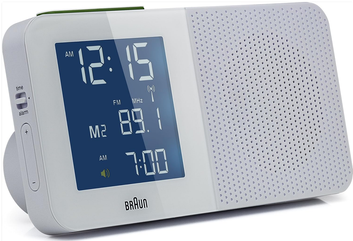
Image: The Braun BNC010 Digital Alarm Clock Radio, showcasing its sleek white design, large digital display, and integrated speaker grille.

Thank you for purchasing the Braun BNC010 Digital Alarm Clock Radio. This manual provides detailed instructions for setting up, operating, and maintaining your new device. Please read this manual thoroughly before use to ensure proper function and longevity of your product.