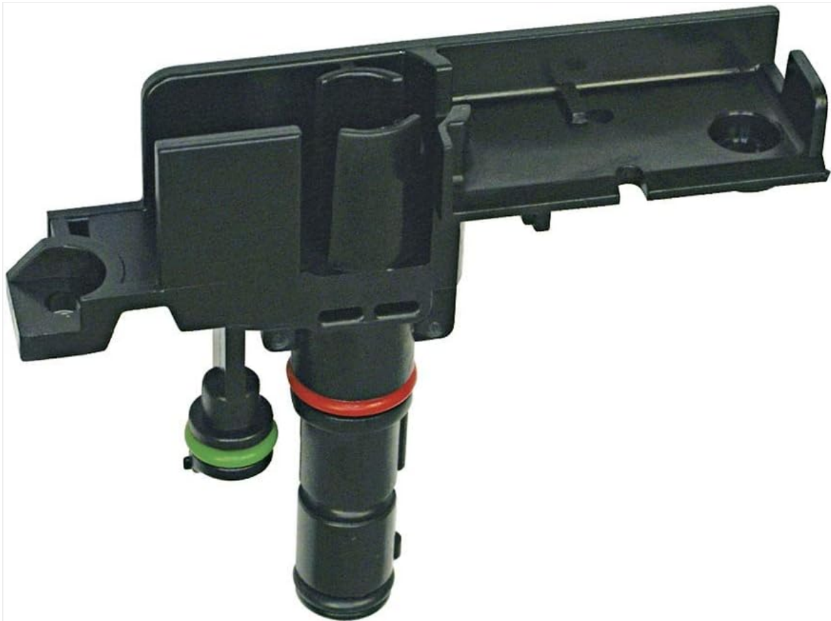
Figure 2: Rear view of the De'Longhi Milk Pitcher Connector. This image shows the reverse side of the connector, highlighting its structural design and the various connection points for integration with the coffee machine's milk system.