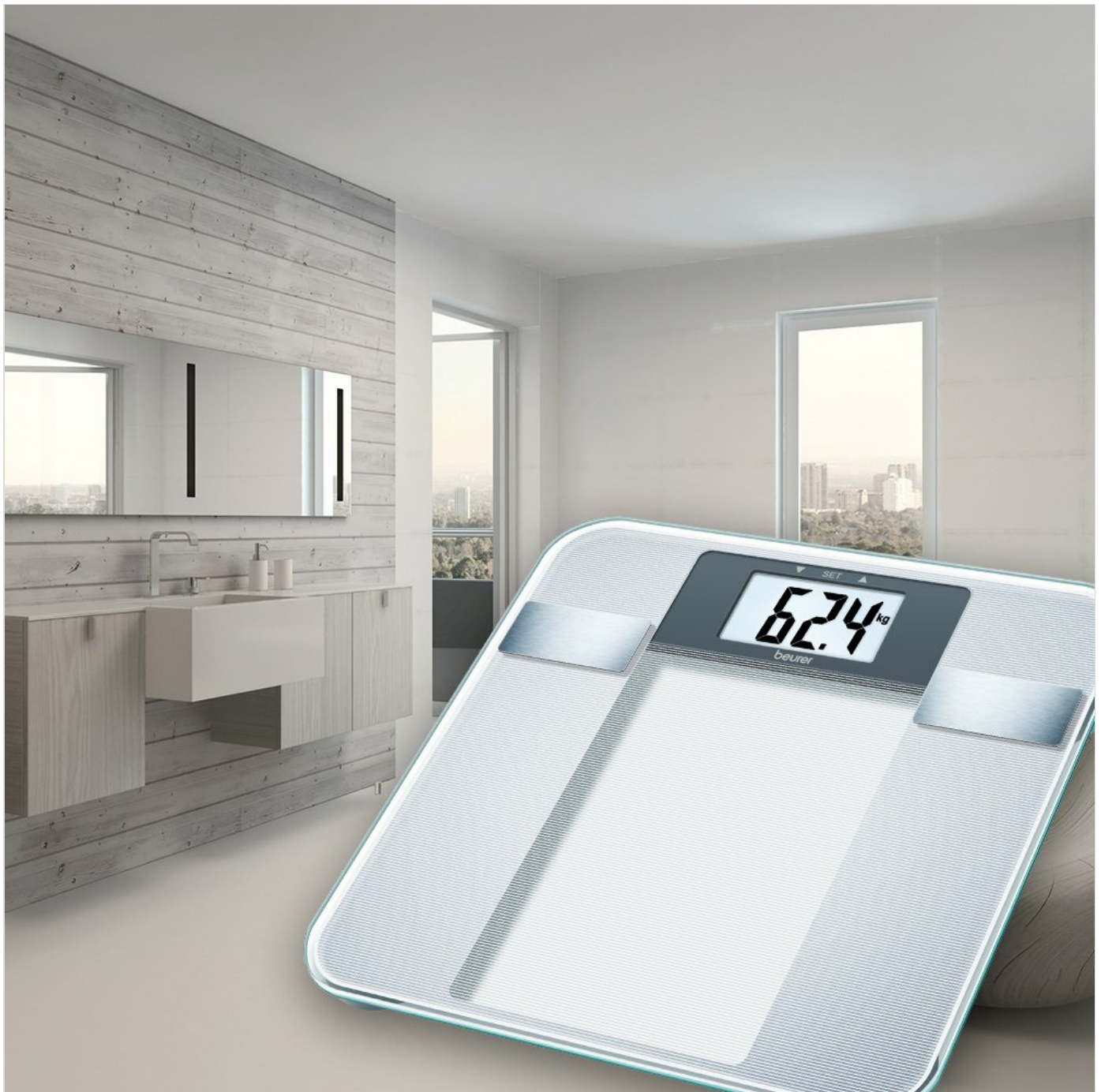
Image: The Beurer BG13 Diagnostic Bathroom Scale, showcasing its sleek design in a bathroom environment.