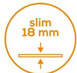
Image: Visual representation of key features including Body Mass Index calculation, 10 user memory slots, 150 kg weight capacity, and a slim 18 mm profile.