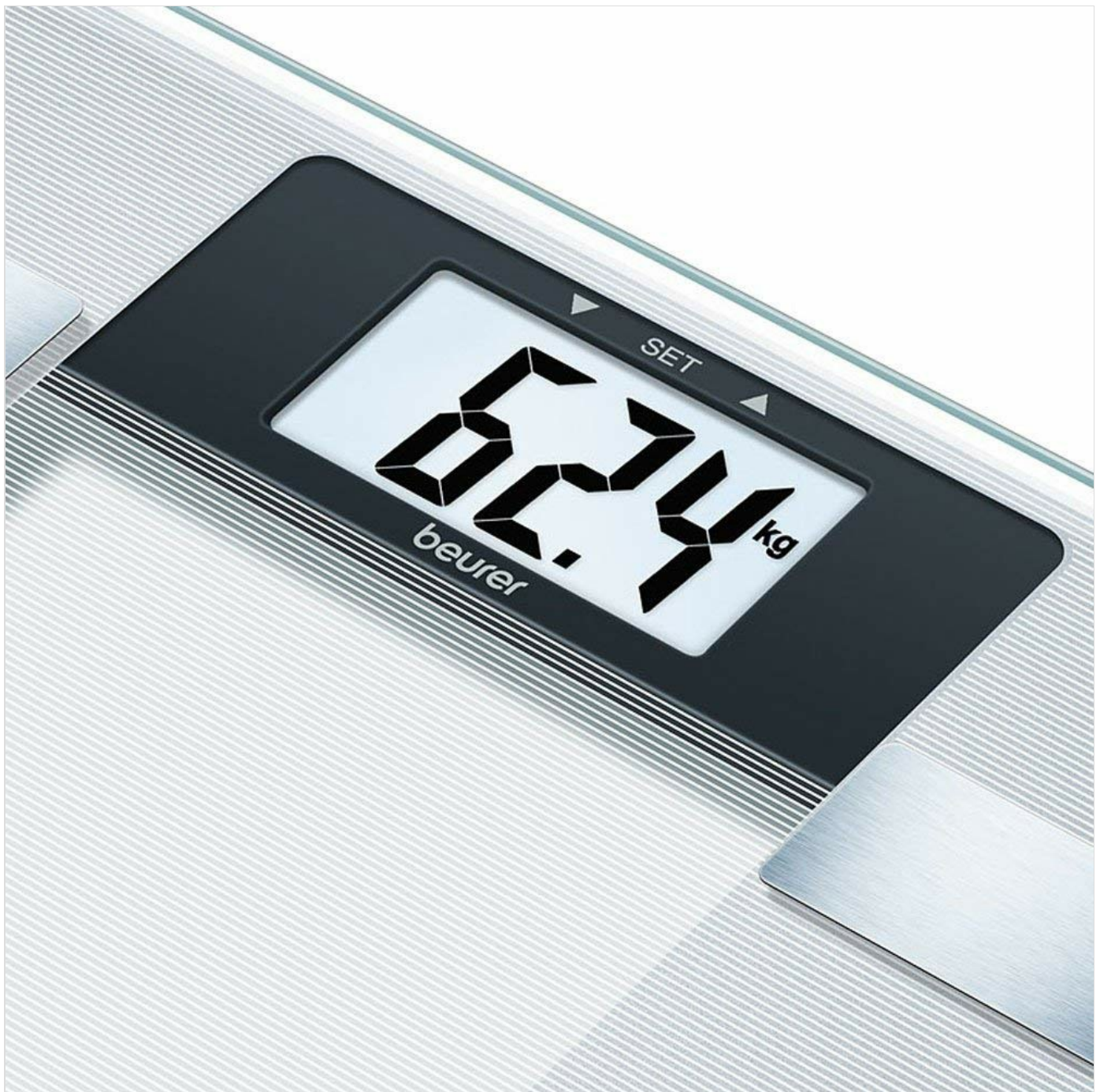
Image: A detailed view of the scale's large digital display, showing a weight measurement in kilograms.