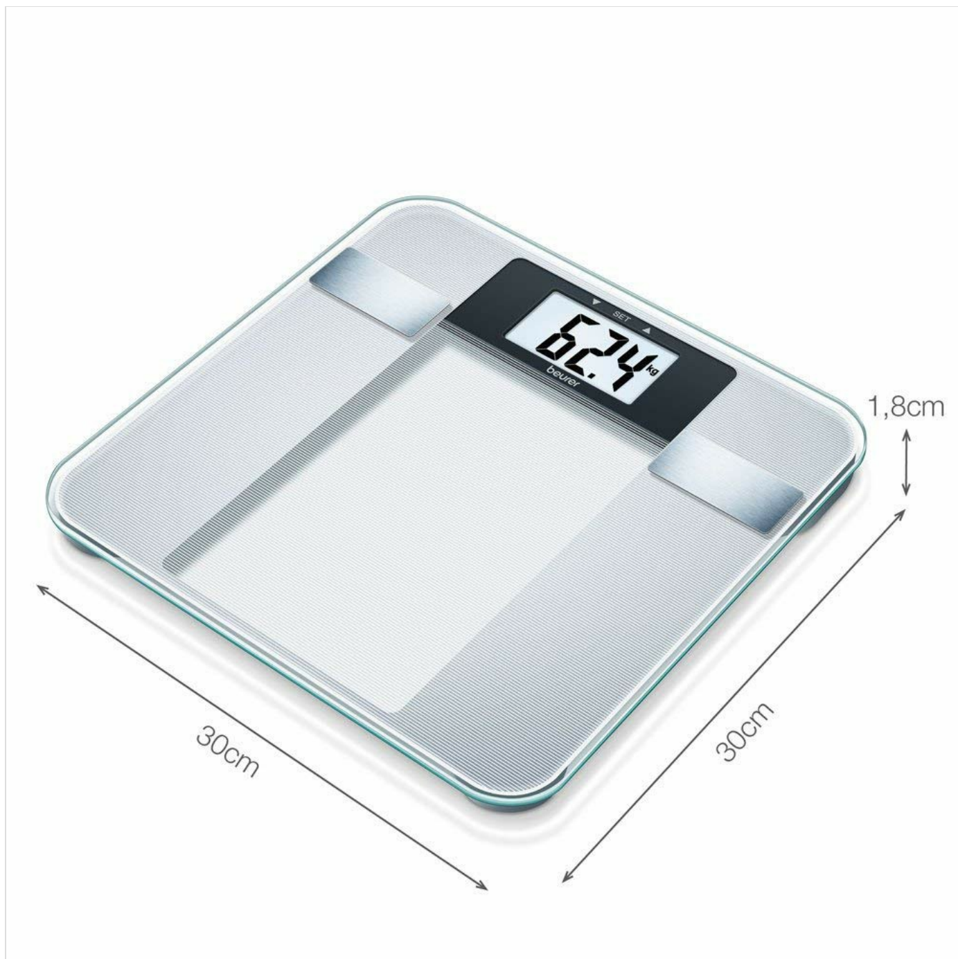
Image: The Beurer BG13 scale illustrating its compact dimensions of 30 cm length, 30 cm width, and 1.8 cm height.